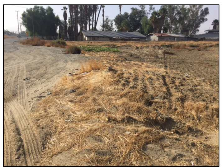
Plate 2. Overview of the project area from the southwest, view to the south; discing visible.