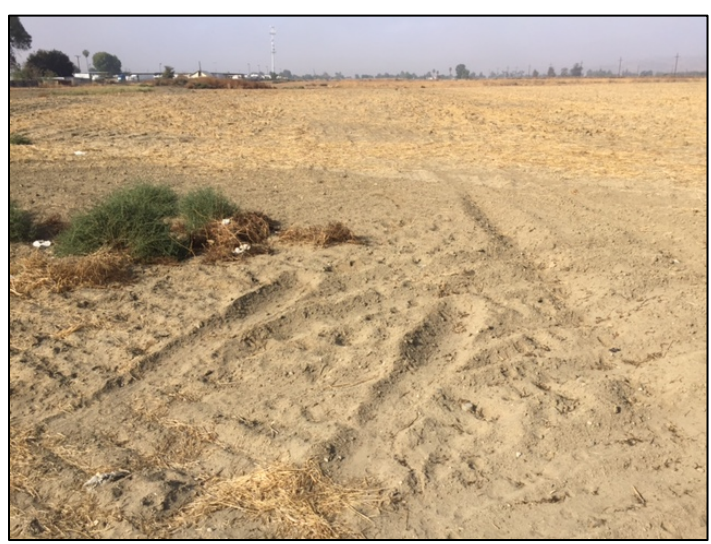
Plate 1. Overview of the project area from the southwest, view to the west.

Visibility was excellent for most of the project area, although vegetation obscured the ground in some areas (Plates 1 and 2). The soil encountered was silty sand with light compaction as a result of recent discing (Plate 2). A moderate amount of modern trash was scattered throughout the property boundaries.