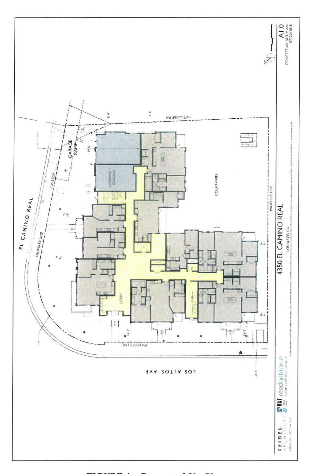
FIGURE 4 – Conceptual Site Plan