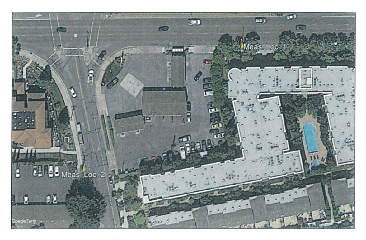
FIGURE 5 - Noise Measurement Locations

Vehicular traffic noise contains a wide spectrum of frequency components (from 100 to 10,000 Hertz), which are associated with engine, tire, drive-train, exhaust and other sources. The frequency components are centered primarily in the 250 and 500 Hz octave bands and were used in determining the noise control measures recommended for this project.