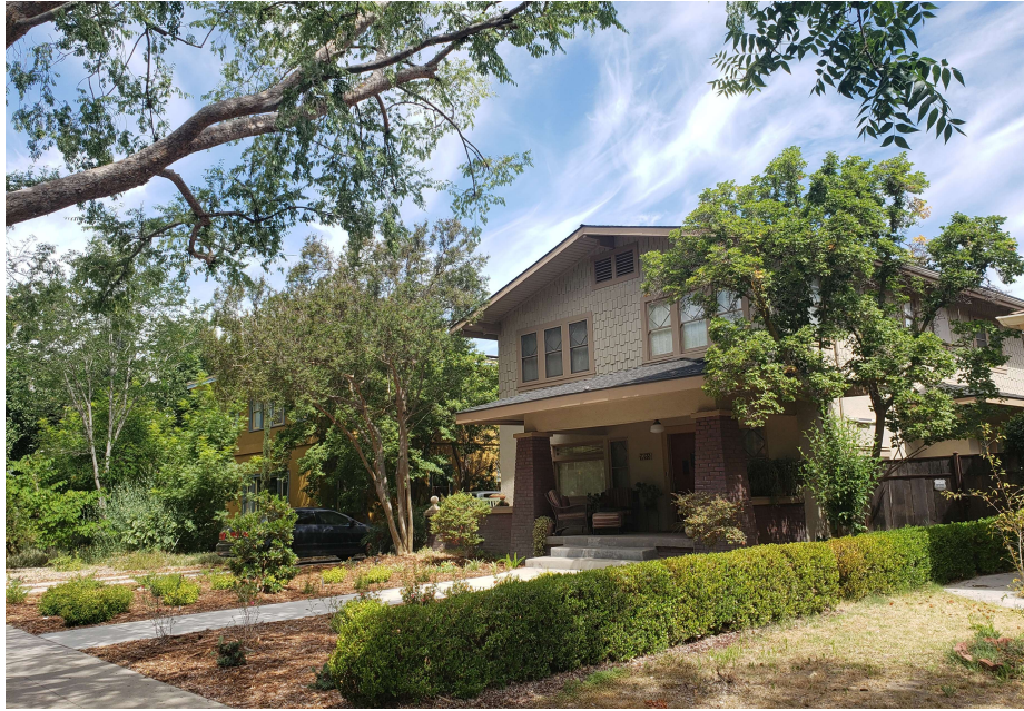
Home, Porter Tract Historic District, E. Yale Avenue, west of N. College Avenue

sity of early 20 th century architectural styles. The Porter Tract was designated as Fresno's first historic district by the City Council in April 2001 (Guide to Historic Architecture accessed May 5, 2019).