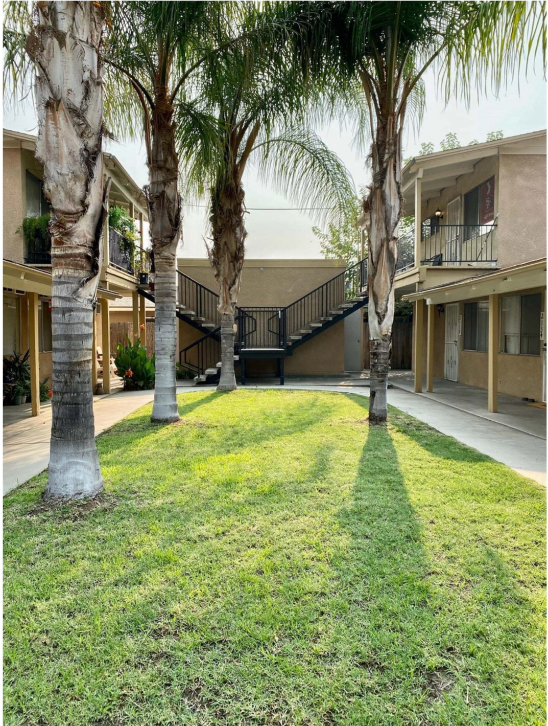
Interior courtyard and 2 story units