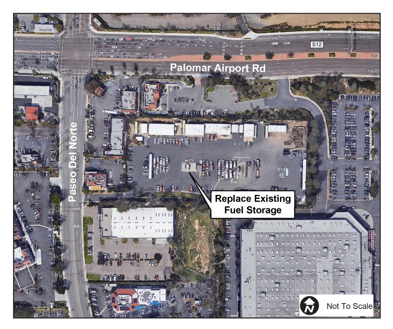
Figure 4 – Carlsbad Maintenance Station (#5719)