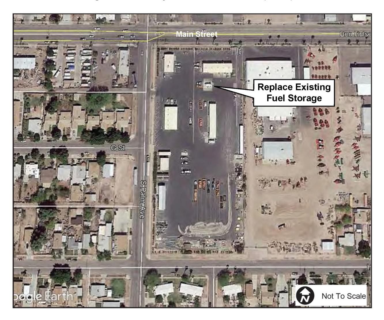
Figure 3 – Brawley Maintenance Station (#5725)