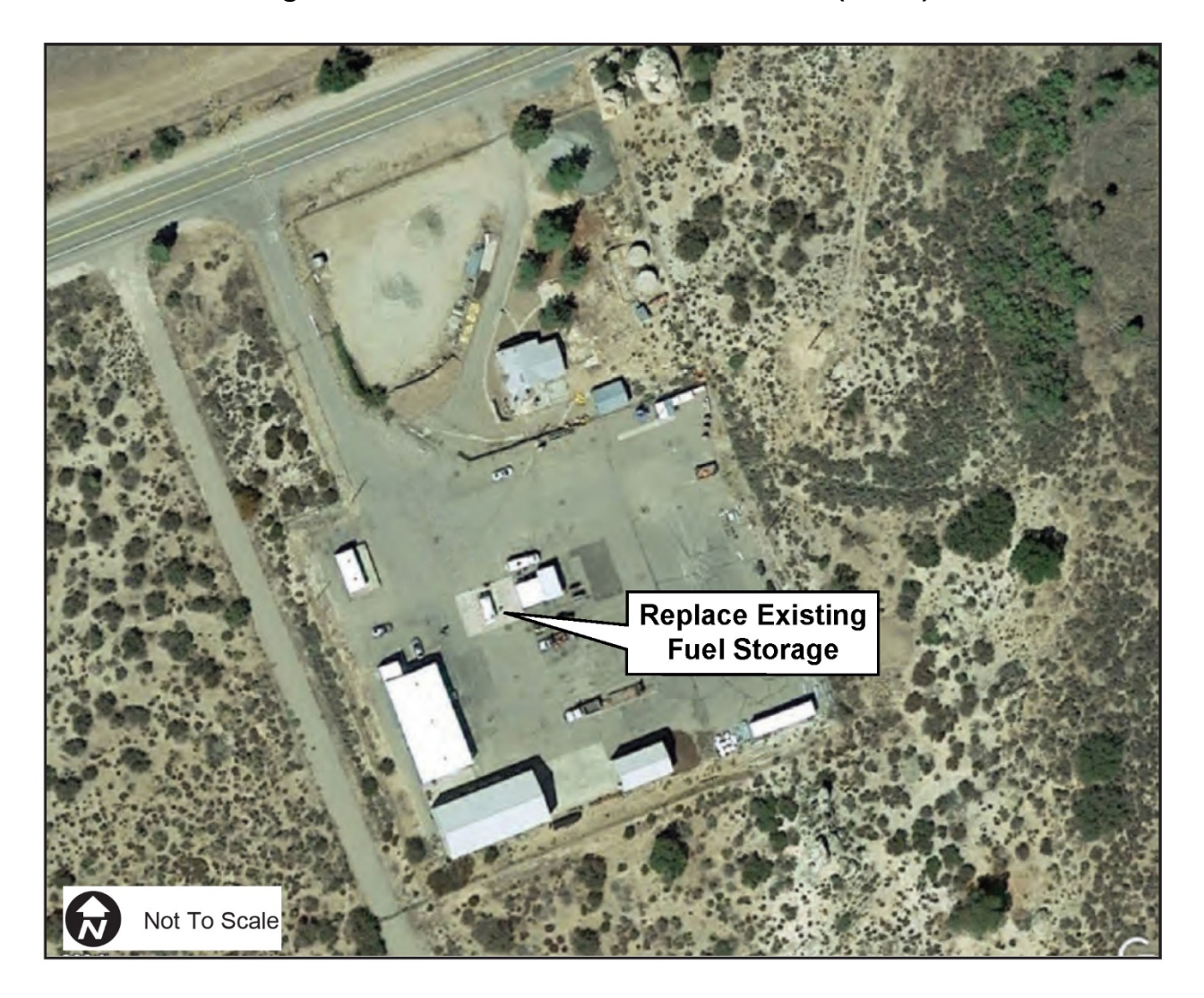
Figure 2 – Boulevard Maintenance Station (#5713)