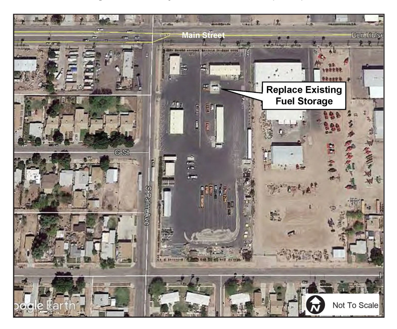
Figure 3 – Brawley Maintenance Station (#5725)