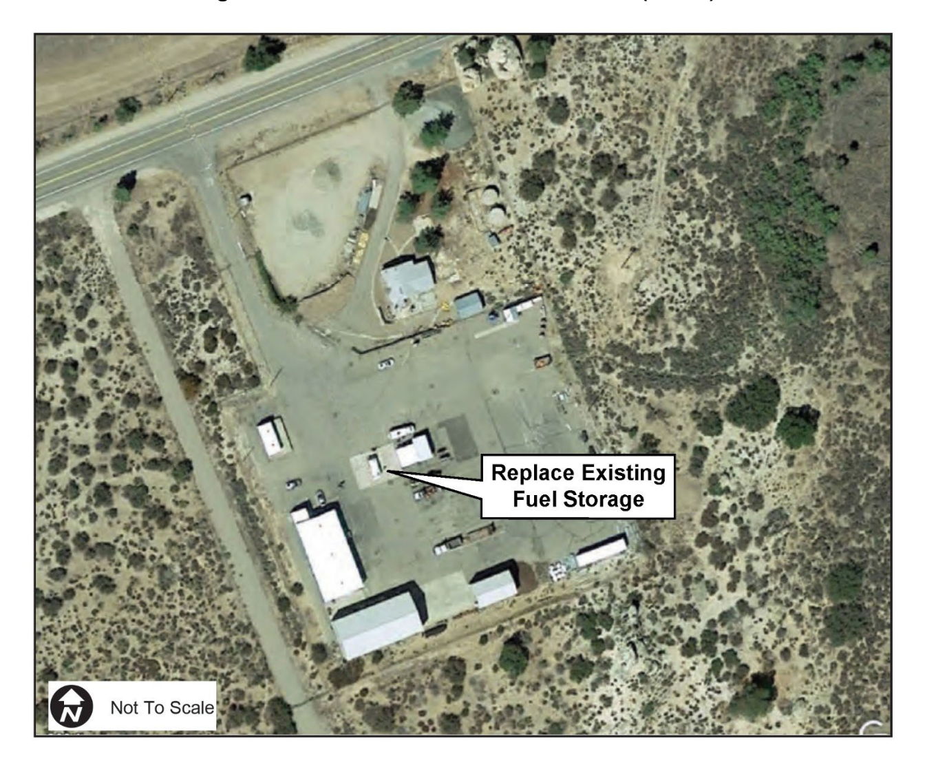
Figure 2 – Boulevard Maintenance Station (#5713)