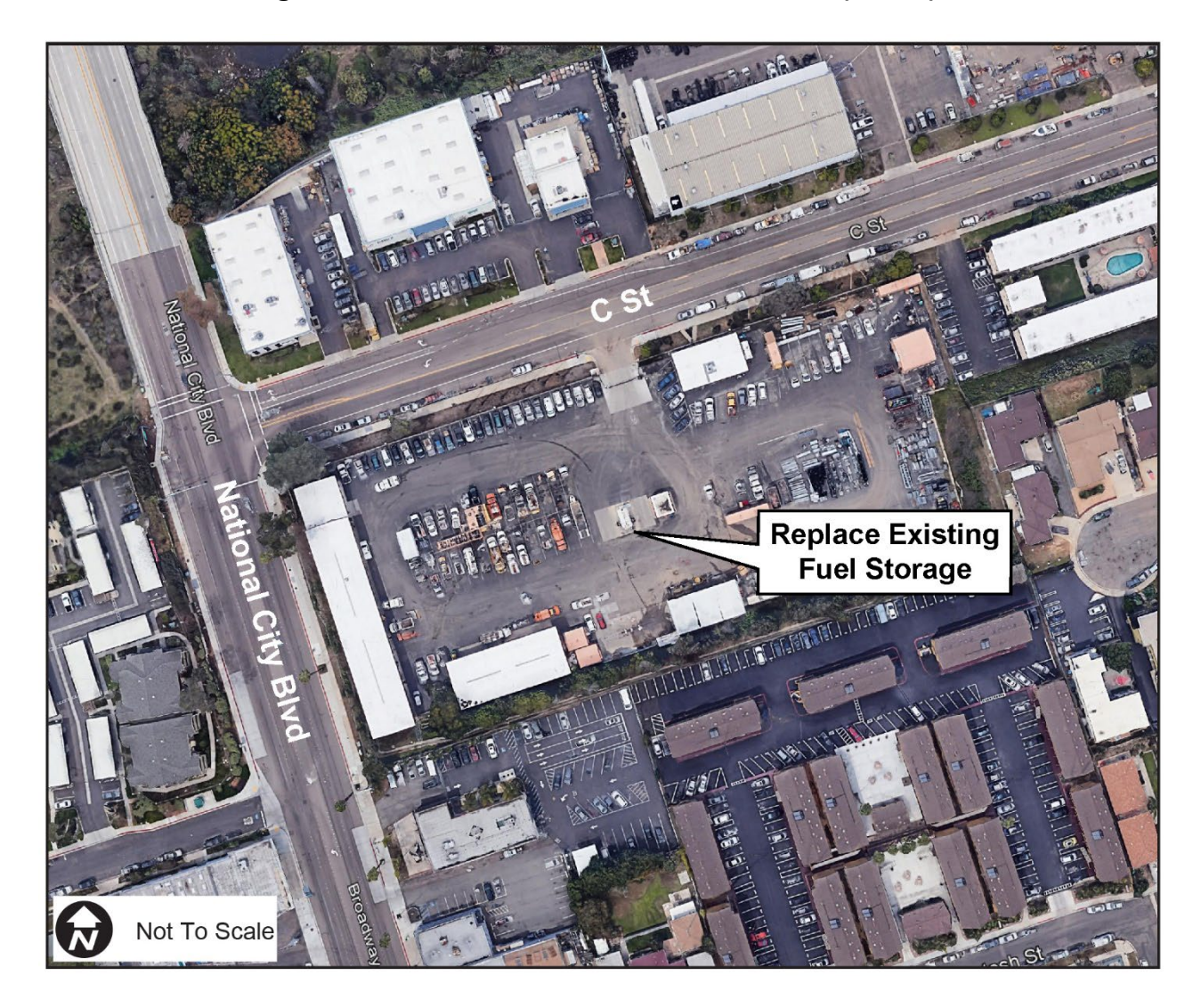
Figure 5 – Chula Vista Maintenance Station (#5705)