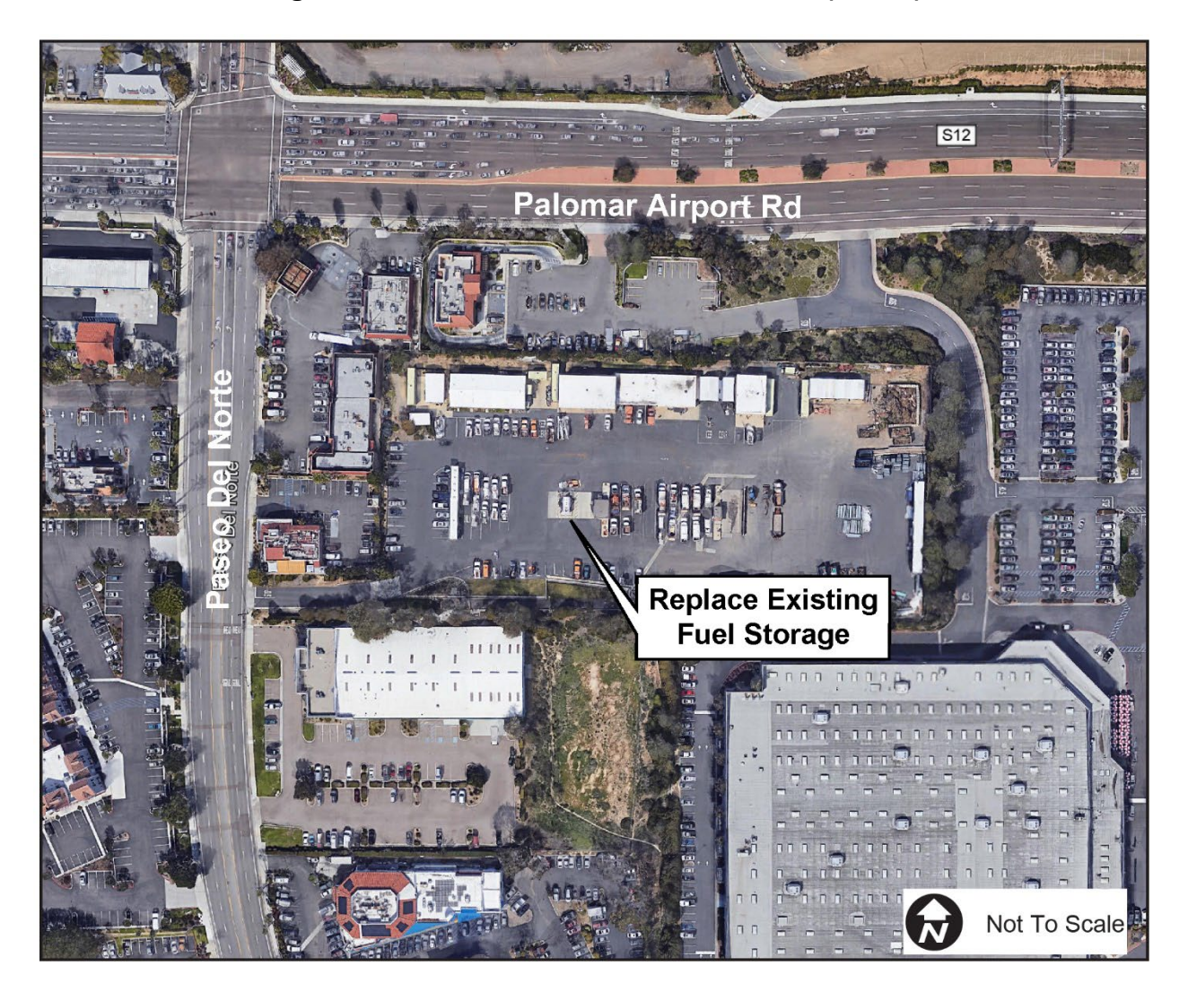
Figure 4 – Carlsbad Maintenance Station (#5719)