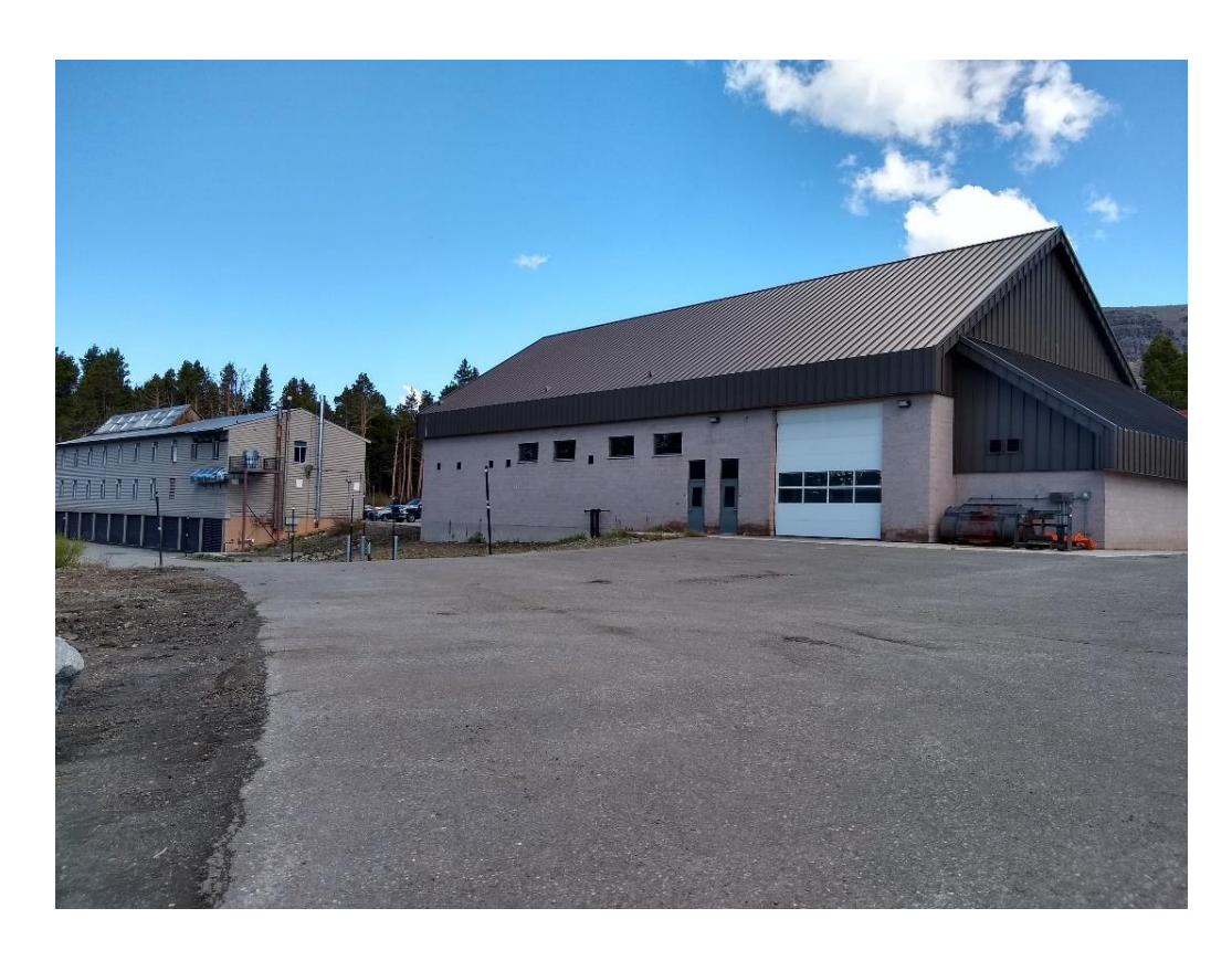
Prepared by the State of California Department of Transportation