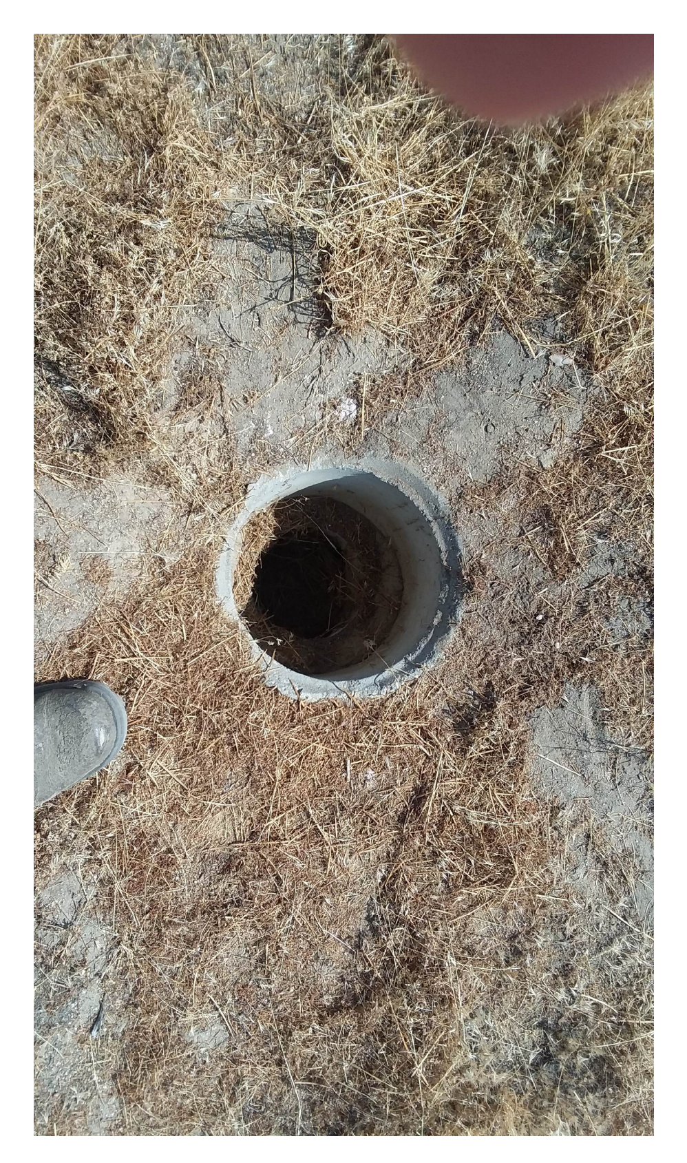
Figure 3 R-1, Concrete Waterlines