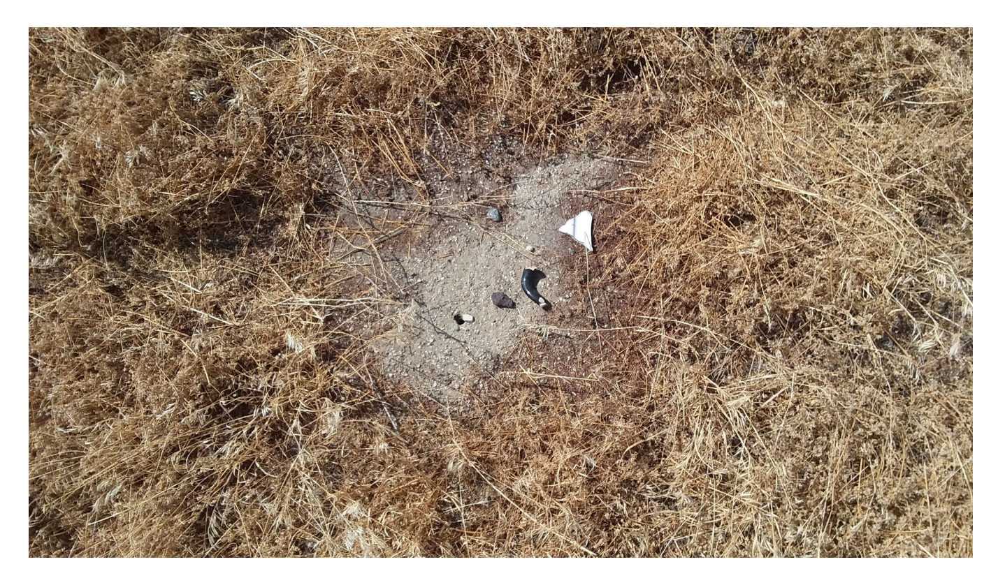
Figure 4 R-1, Domestic Artifacts

No further work is required. If archaeological resources are encountered during the course of construction, a qualified archaeologist should be consulted for further evaluation.