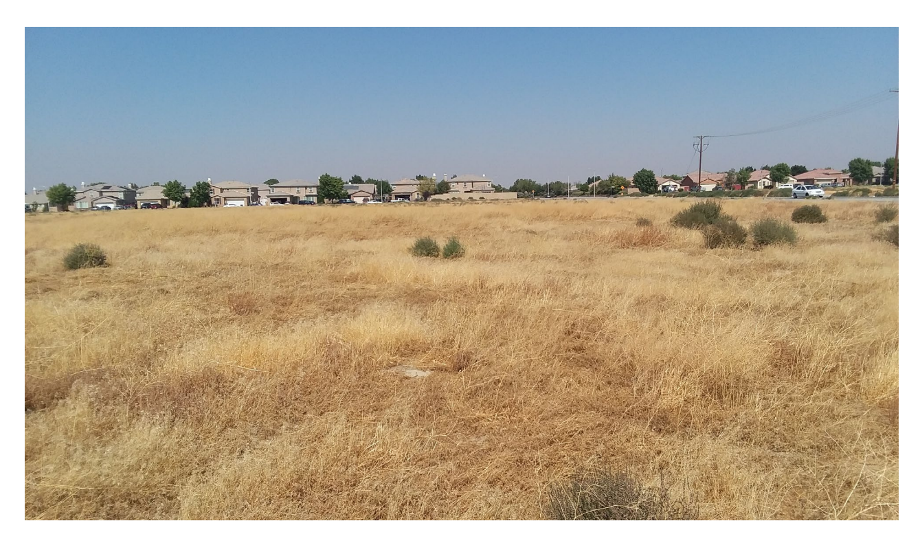
Figure 2 Project Area, View to the North

Flat were believed to have extended their food-collecting activities into the surrounding mountains (Wallace 1977:121).