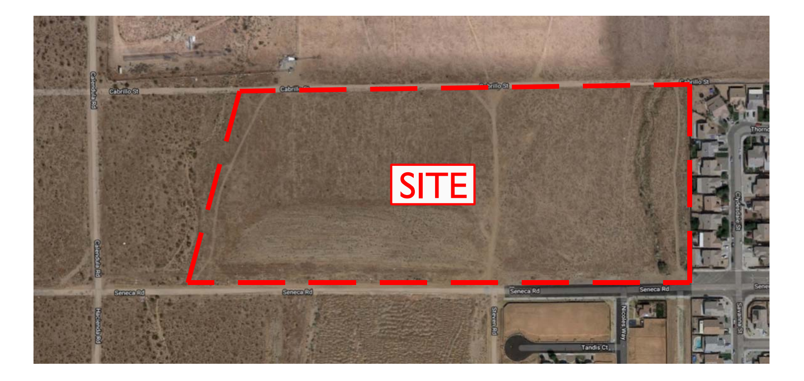
Exhibit A Location Map