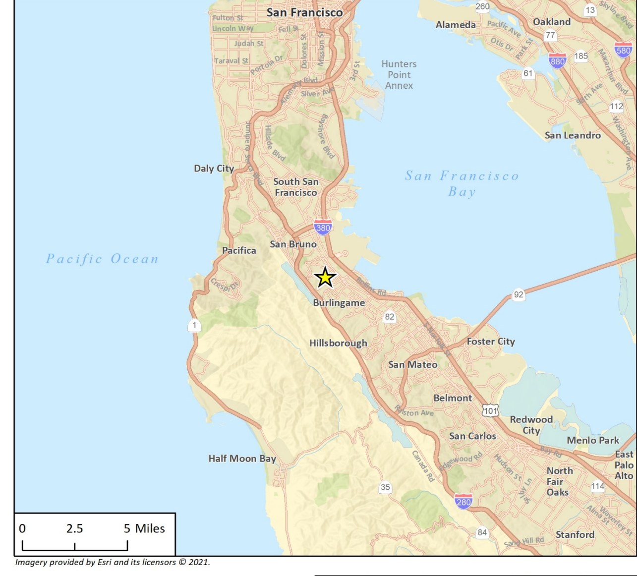
Figure 1 Regional Location