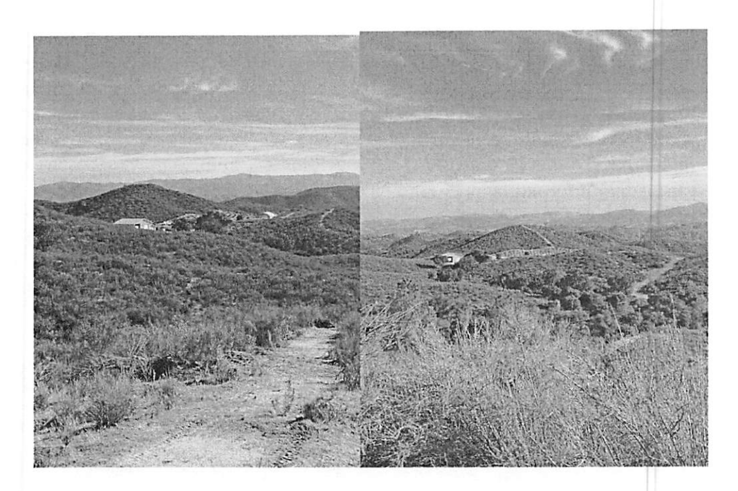
Page 5 of the Development Statement states: "Cannabis has been cultivated outdoors at this site for several years with no odor complaints of any kind." This is not true. The tenants on our property have for the past several years experienced significant odor problems from the existing operations on the Bigfoot Property. They have complained that the cannabis odor is frequently overpowering and nauseating. I have also personally expressed complaints to local law enforcement about the existing cannabis operation over the past several years. It is extremely misleading for Bigfoot to suggest that its neighbors have not been adversely impacted by or upset with the existing cannabis operations.

These factors weigh heavily against the setback modification requested by Bigfoot. In the Development Statement, Bigfoot acknowledges that its proposed cultivation sites do not comply with the requirement that they be setback at least 300' from all property lines. The proposed cultivation site is a mere 204' from the southern property line, which borders our residential property. Strictly adhering to the 300' setback requirement is especially important for this project given the impact on the neighboring properties, including odor (which is already a significant problem), not to mention visibility of development, light, noise and other impacts. Under no circumstances should the setback requirements be modified for this proposed project.