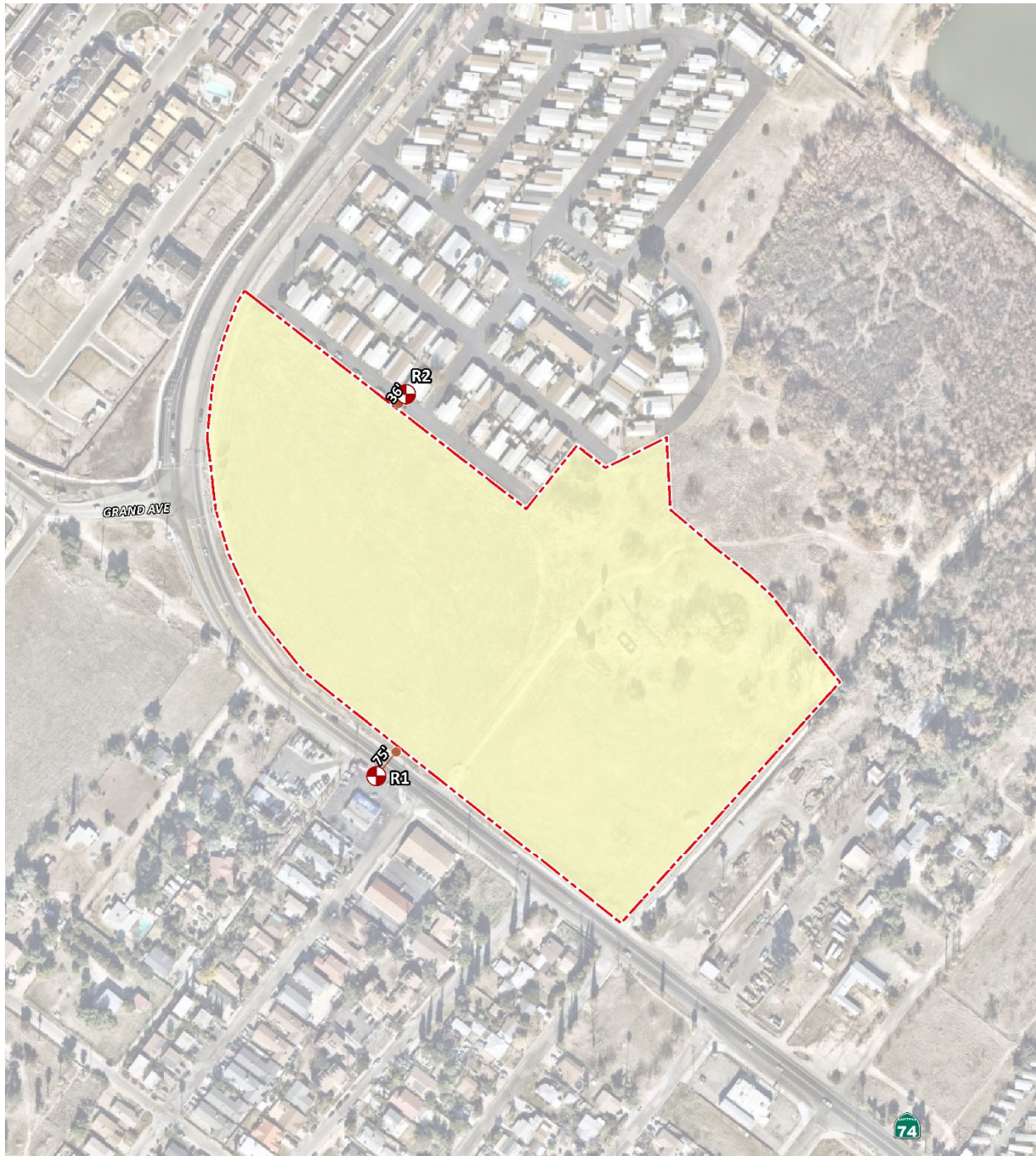
EXHIBIT 3-A: SENSITIVE RECEPTOR LOCATIONS