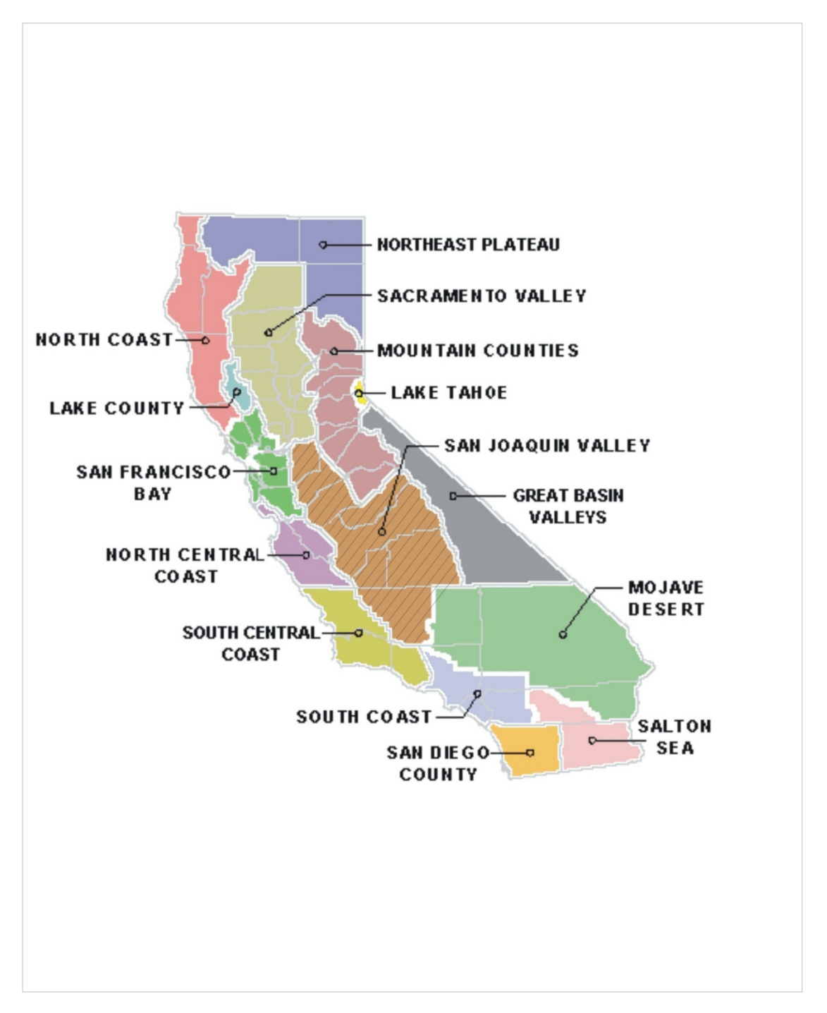
FIGURE 2 California Air Basins