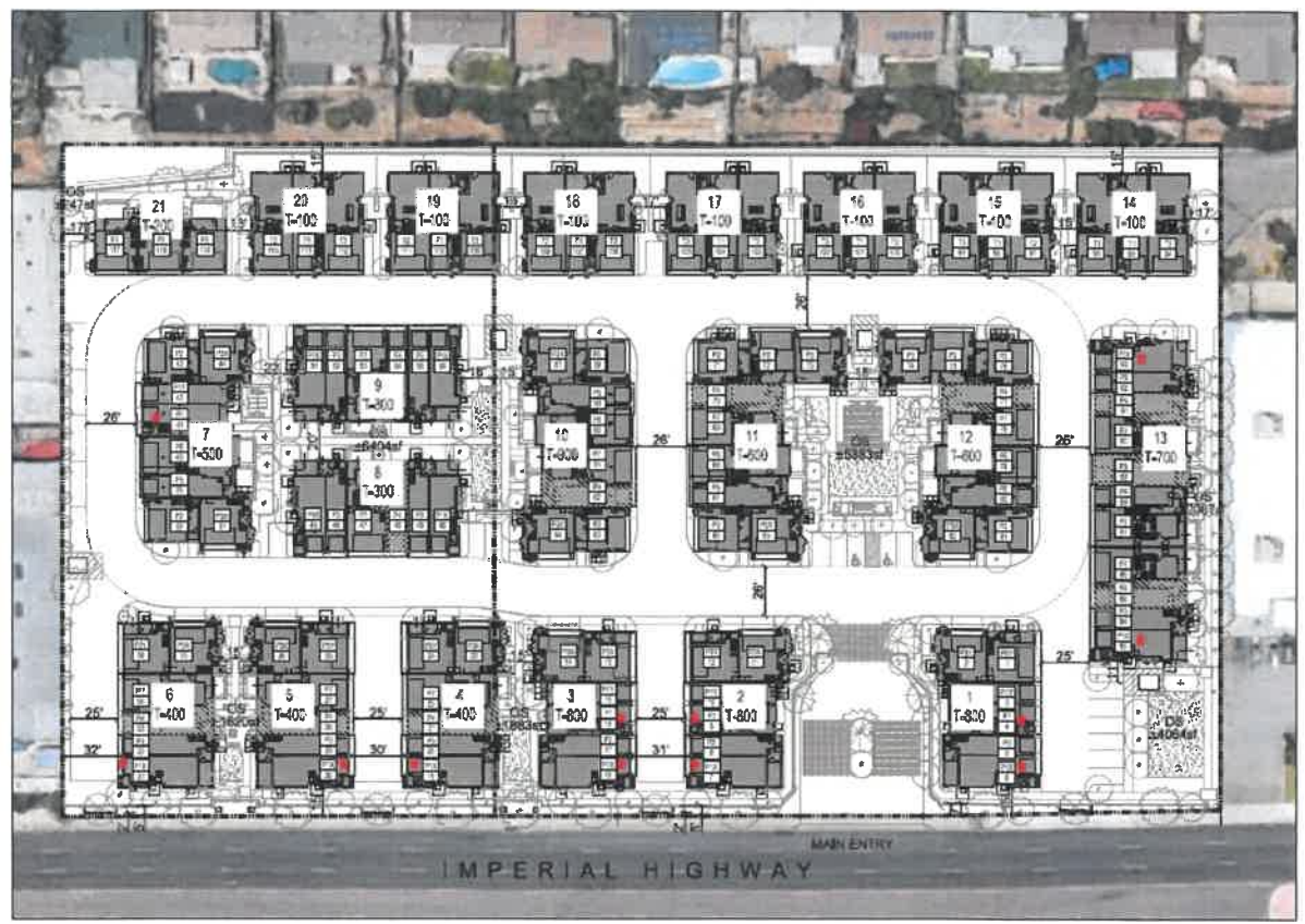
Figure 3. Proposed Project Site Pan