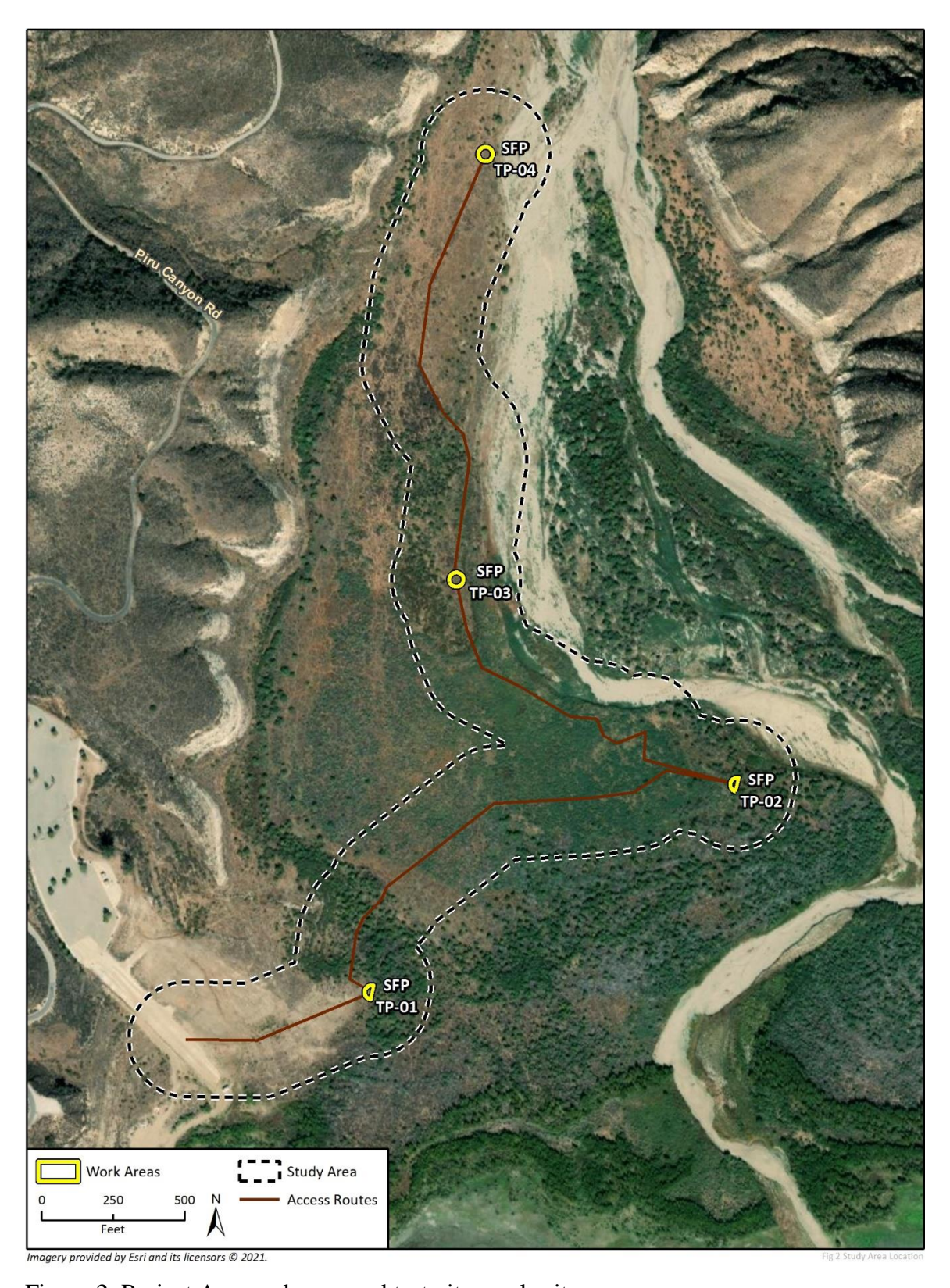
Figure 2. Project Area and proposed test pit sample sites.