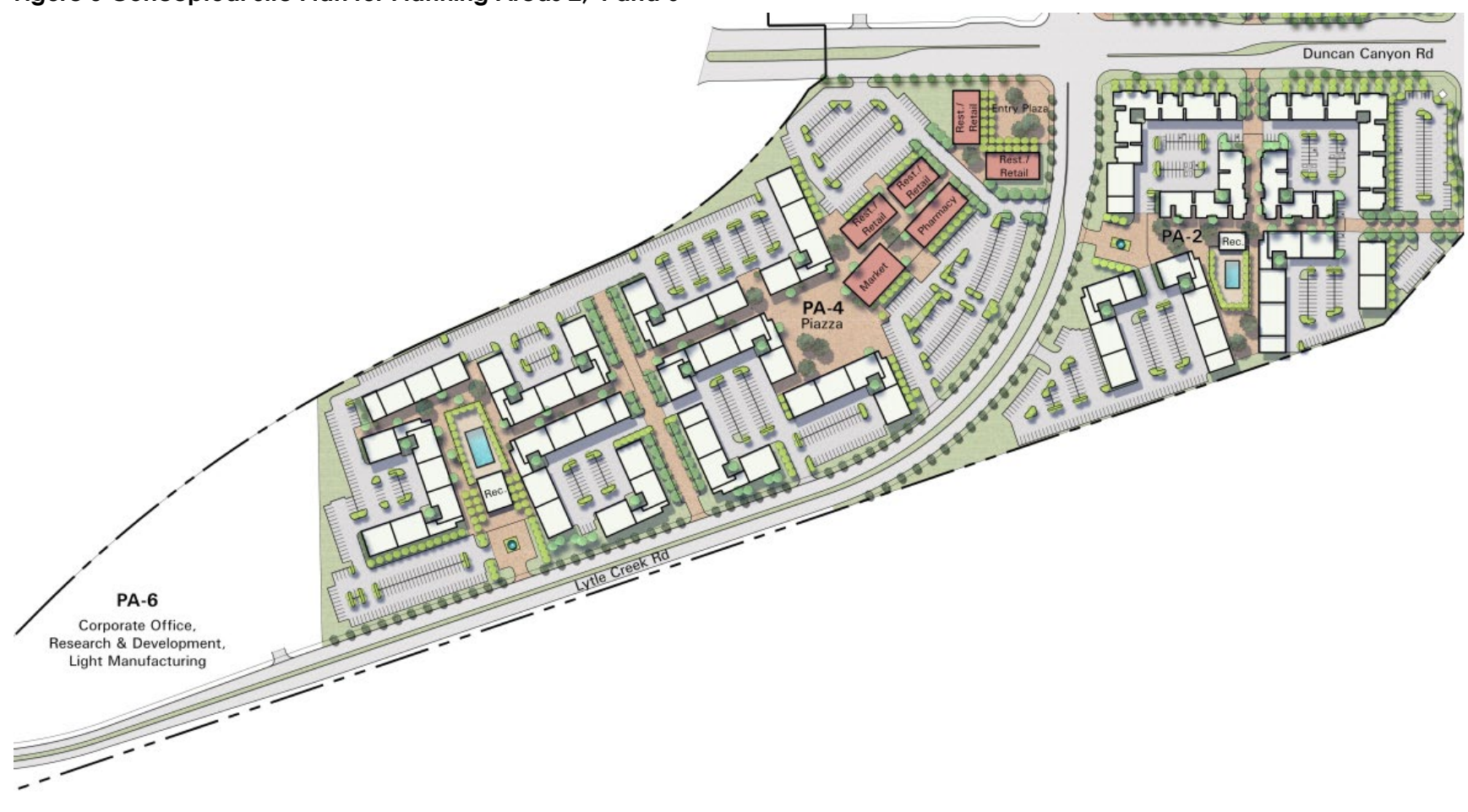
Figure 5 Conceptual Site Plan for Planning Areas 2, 4 and 6