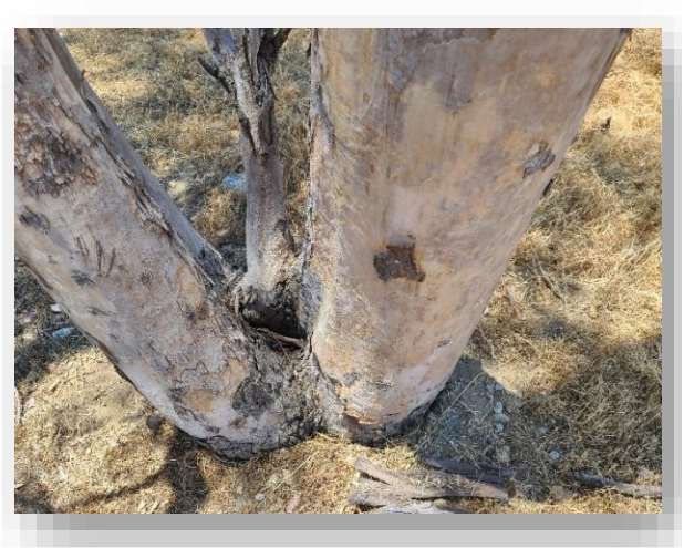
Plate 15. This is a view of sprouters that matured into codominant stems closing a topped stump (#949).