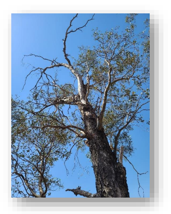
Plate 5. This is a view of upper canopy deadwood of a tree in decline (#906).