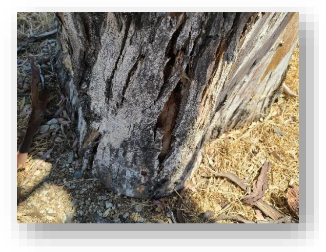
Plate 6. This is a view of exposed deadwood beneath infected tissue (#907).