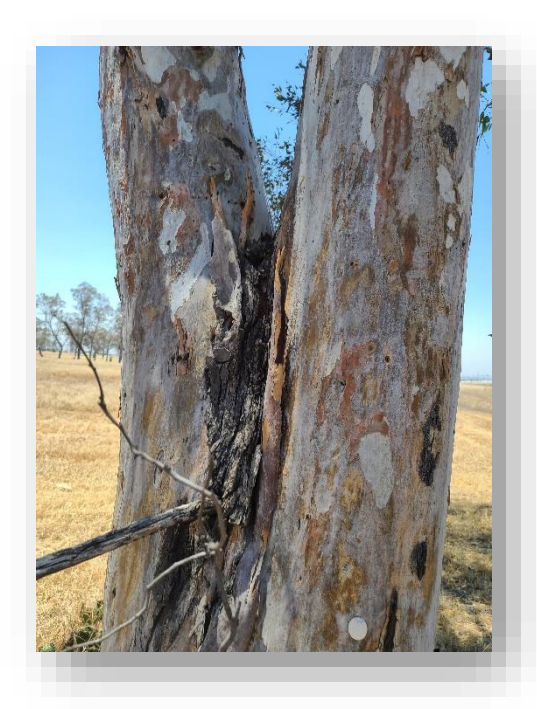
Plate 13. This is a view of included bark within the crotch between two codominant stems (#934).