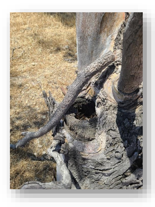
Plate 12. This is a view of a topped tree trunk with matured sprouters (#932).