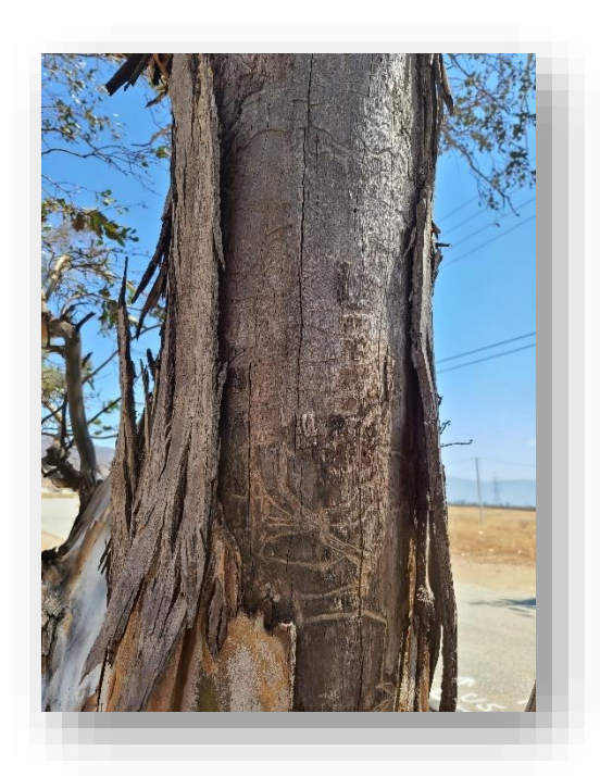
Plate 9. This is a view of a gallery produced by a borer (#916).