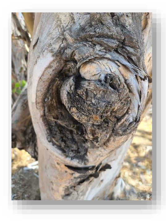
Plate 8. This is a view of decayed wood within an unclosed branch cut (#917).