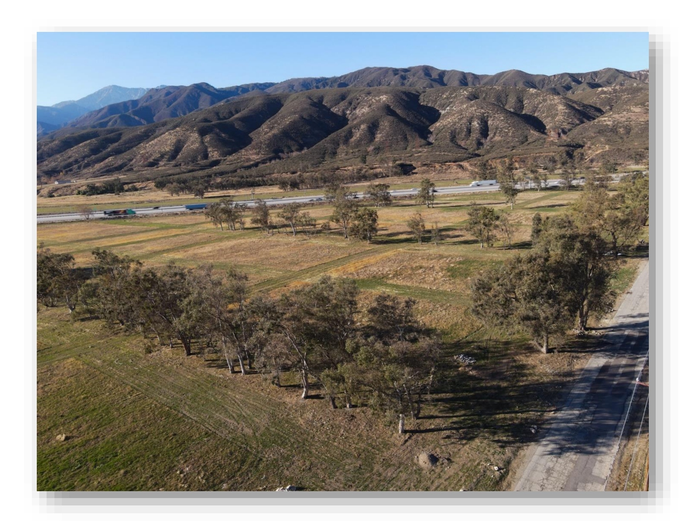
Plate 1. This is a current (January 8, 2021), aerial view to the NW showing the position of windrows within the project site with east-west orientation.