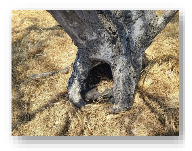
Plate 16. This is a view of a stump that has sprouted leaving an unclosed area with weak branch attachment (#952).