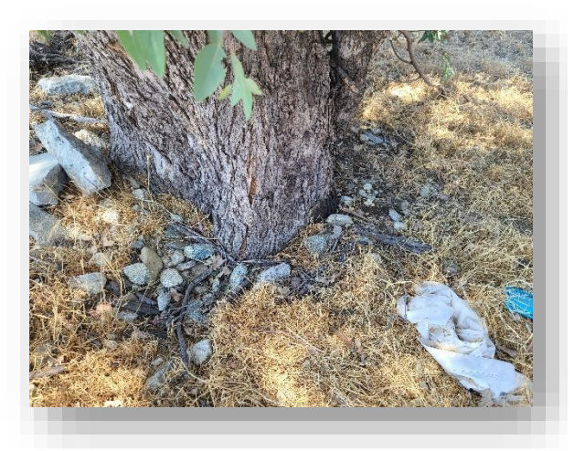
Plate 7. This is a view of stained soil at the base of a tree likely due to disposed motor oil (#912).