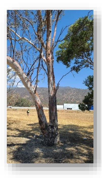
Plate 4. This is a view of a tree with a co-dominant stem (#903).