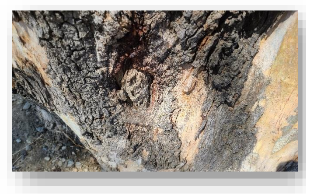
Plate 3. This is a view of internal deadwood with evidence of termites and borings (#903).