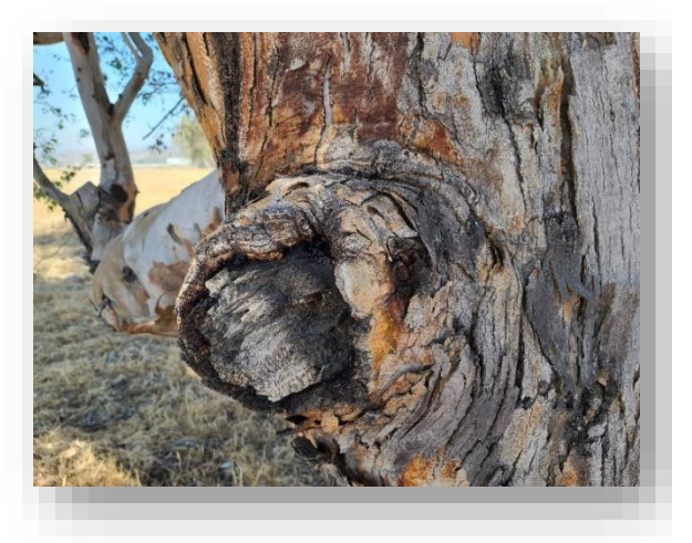
Plate 11. This is a view of internal deadwood within an unclosed wound (#919).