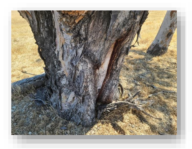
Plate 14. This is a view of a decay at a stem flare (#924).