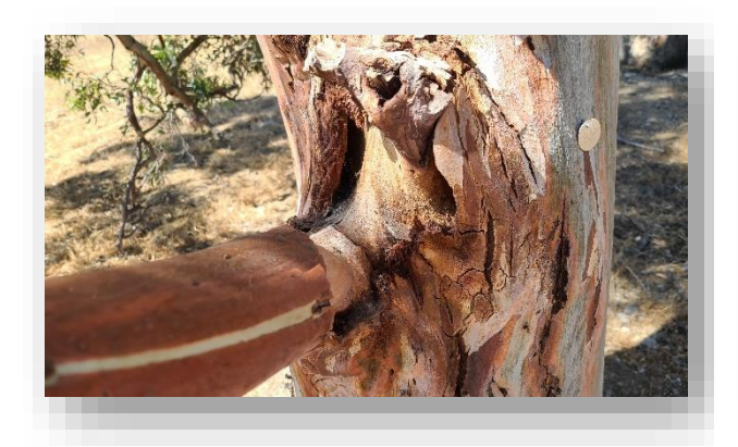
Plate 2. This a view of a cavity with internal decay above a branch collar (#902).

In all, 68 trees consisting of a single distinct species were assessed (see Figure 2 below). The red river gum was the only species observed within the site accounting for 100% of the total number of trees within the project area. The age of the trees onsite ranged from mature to senescent and the health from rigorous to dead. Because of neglect and poor maintenance, 45 (52.9%) of the trees onsite must be removed due to potential for failure, poor form and aesthetics, declining health or damage.