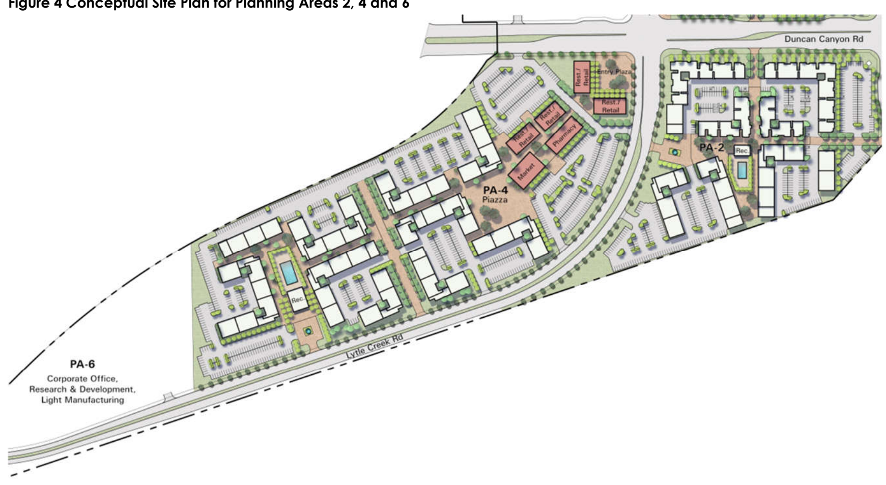
Figure 4 Conceptual Site Plan for Planning Areas 2, 4 and 6