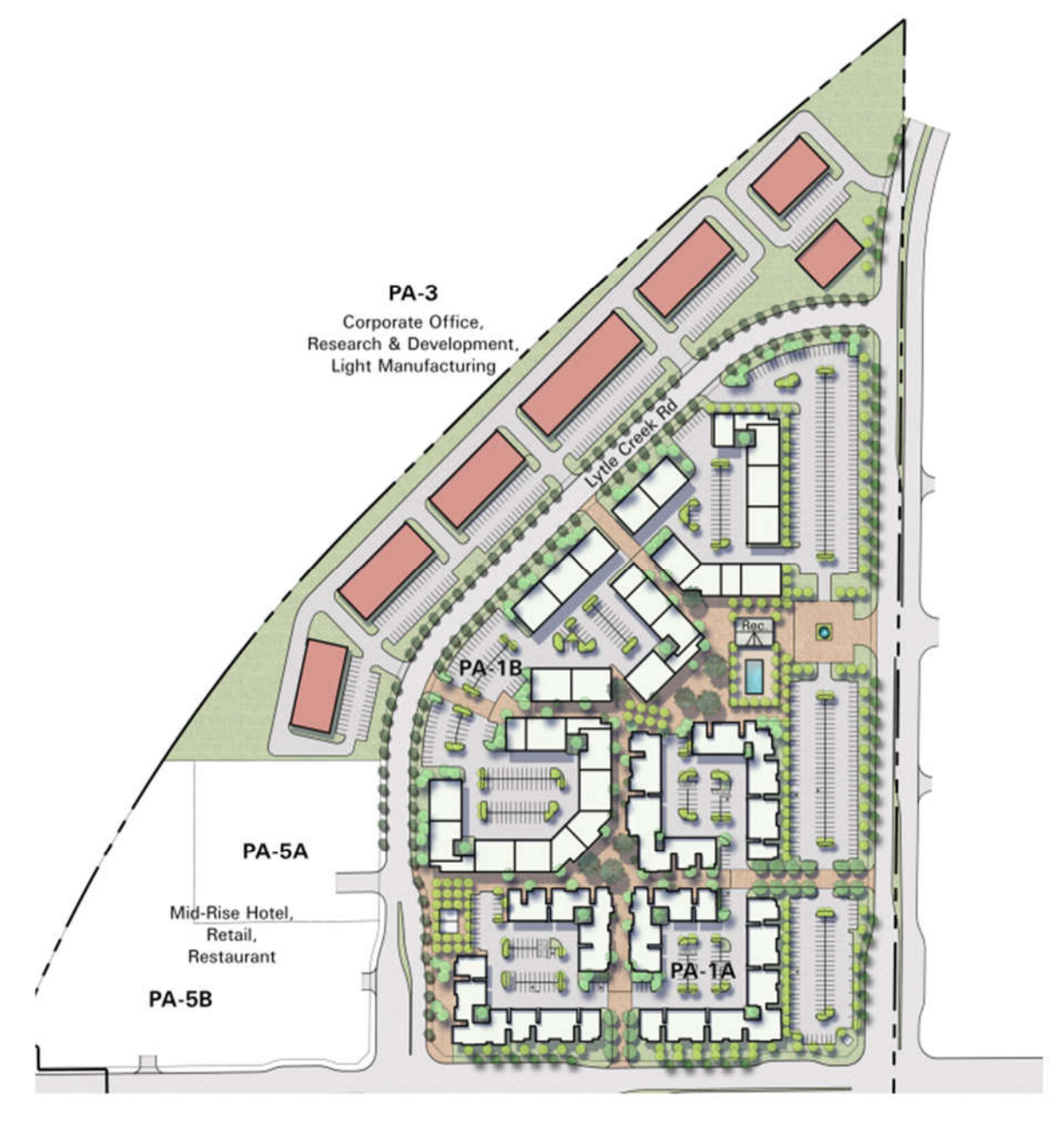
Figure 3 Conceptual Site Plan for Planning Areas 1, 3 and 5