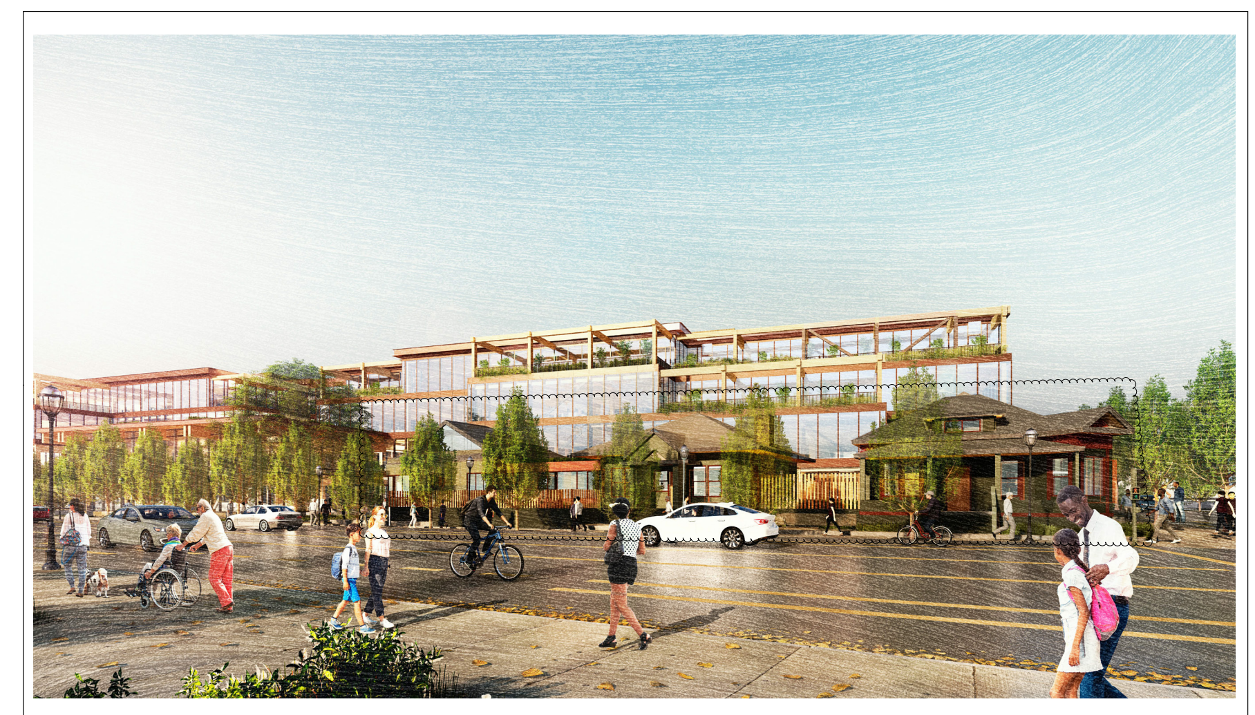
VIEW FROM THE CORNER OF ARGUELLO STREET AND WHIPPLE AVENUE