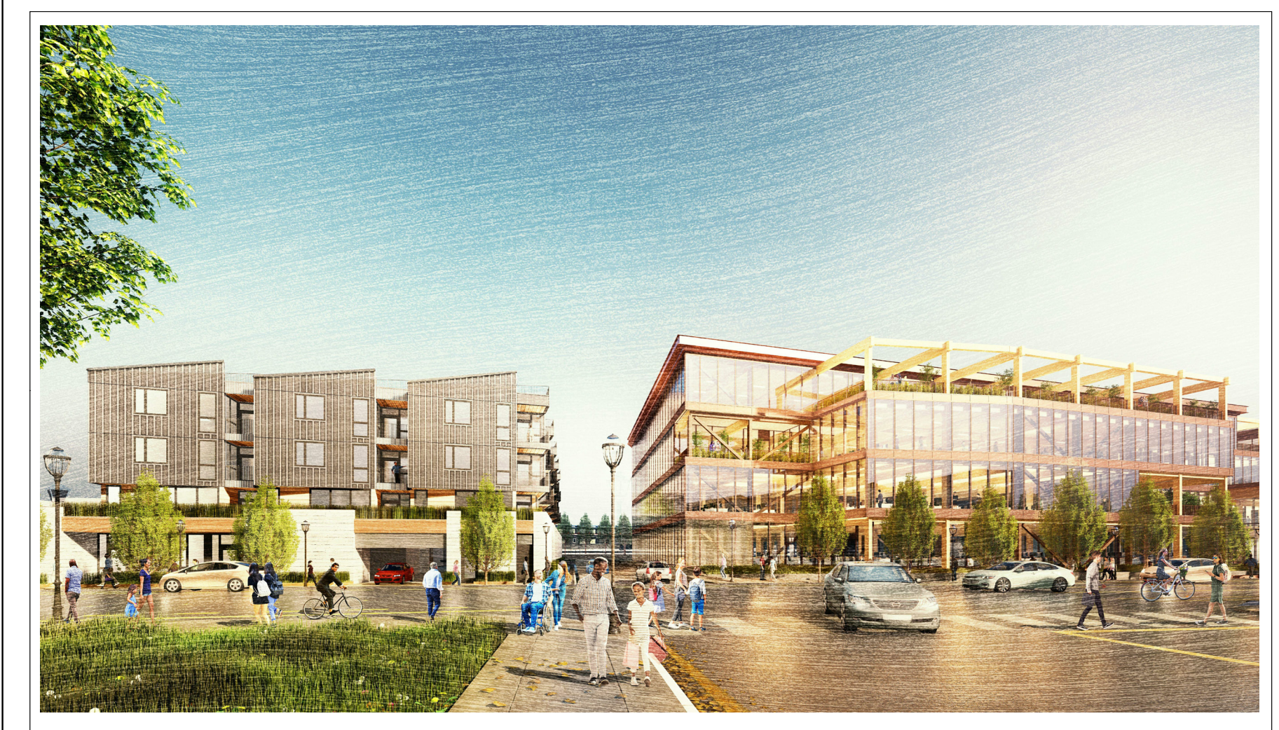
VIEW FROM THE CORNER OF ARGUELLO STREET AND STANDISH STREET