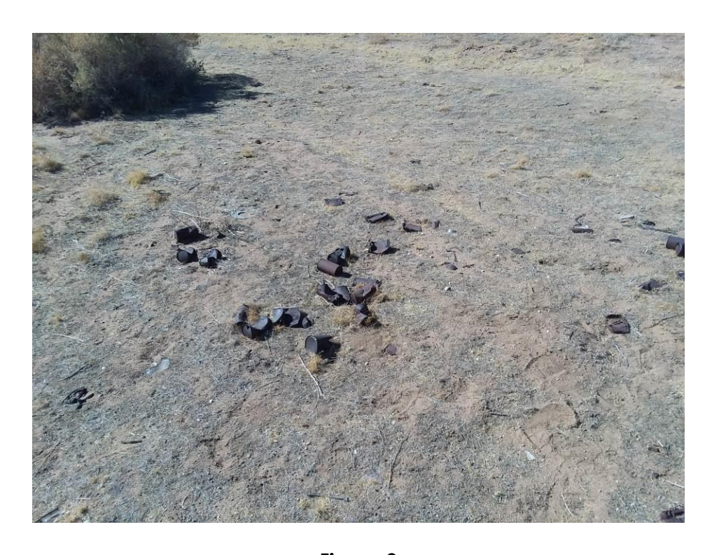
Figure 2 R-1, View towards the Northwest