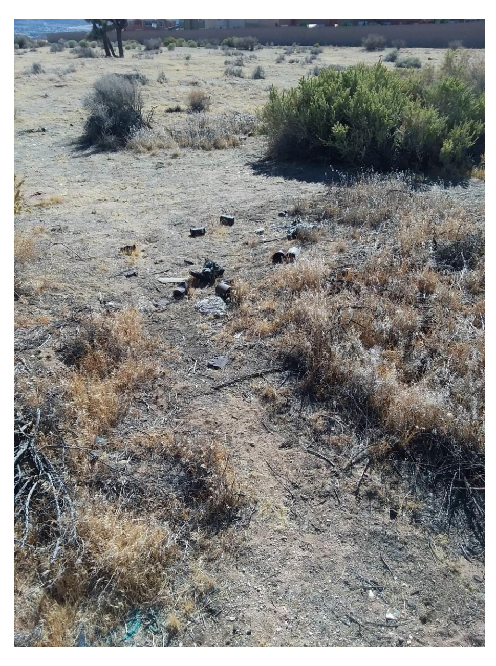
Figure 4 R-1, Trash Scatter, View towards the Southwest