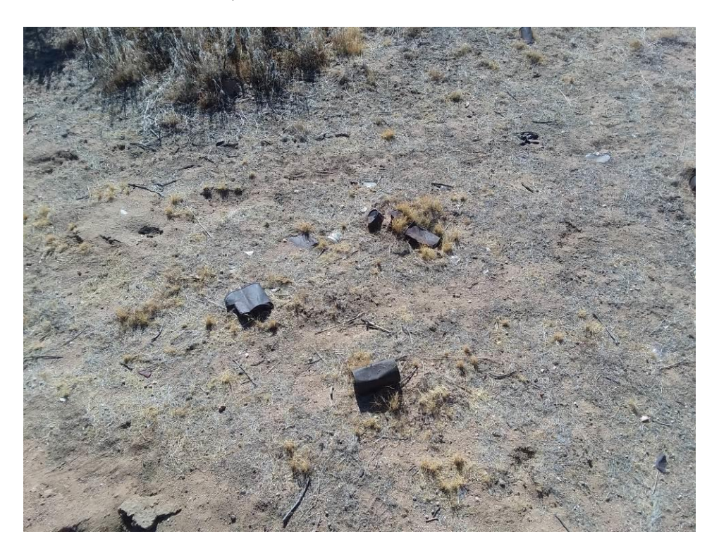
Figure 3 R-1, Trash Scatter, View towards the West