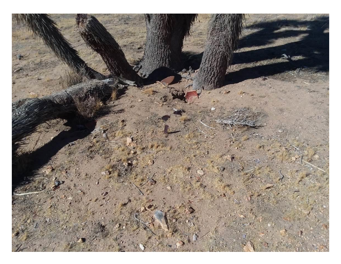
Figure 5 R-1, Trash Scatter, View towards the North