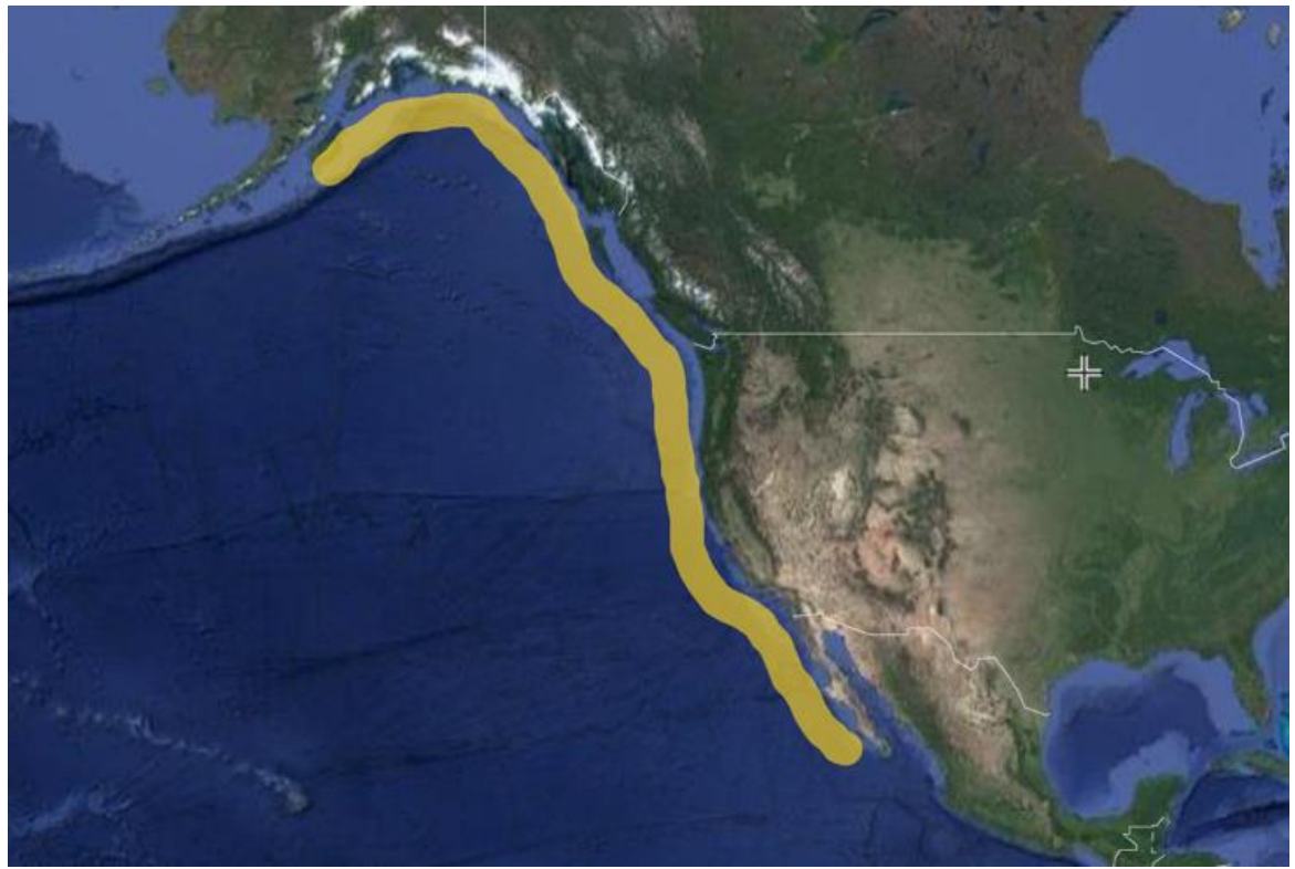
Figure 2. Range of pink shrimp (Pandalus jordani).

Pink shrimp ( Pandalus jordani ) is an oceanic shrimp species that range from southeast Alaska down through Baja California (Figure 2). However, they are only abundant enough to support a commercial fishery between British Columbia and Point Arguello, California during most years (Hannah and Jones 2007). As such most fishing activities in California have occurred north of Point Conception. Fishing south of Point Conception can be conducted under a general open access permit, as opposed to a limited-entry one (Title 14, California Code of Regulations (CCR), § 120.2).