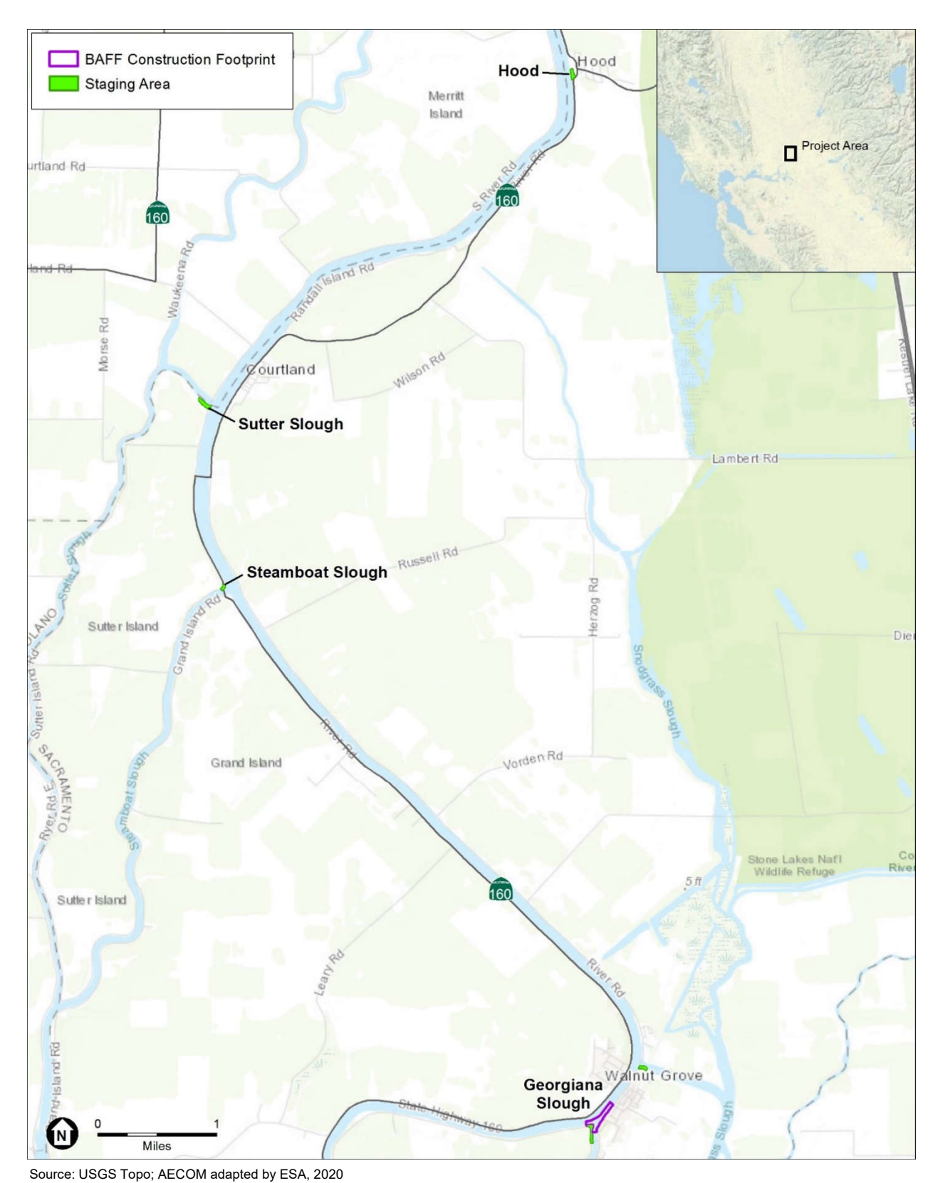
Figure 1 Georgiana Slough Salmonid Migratory Barrier Overview Map