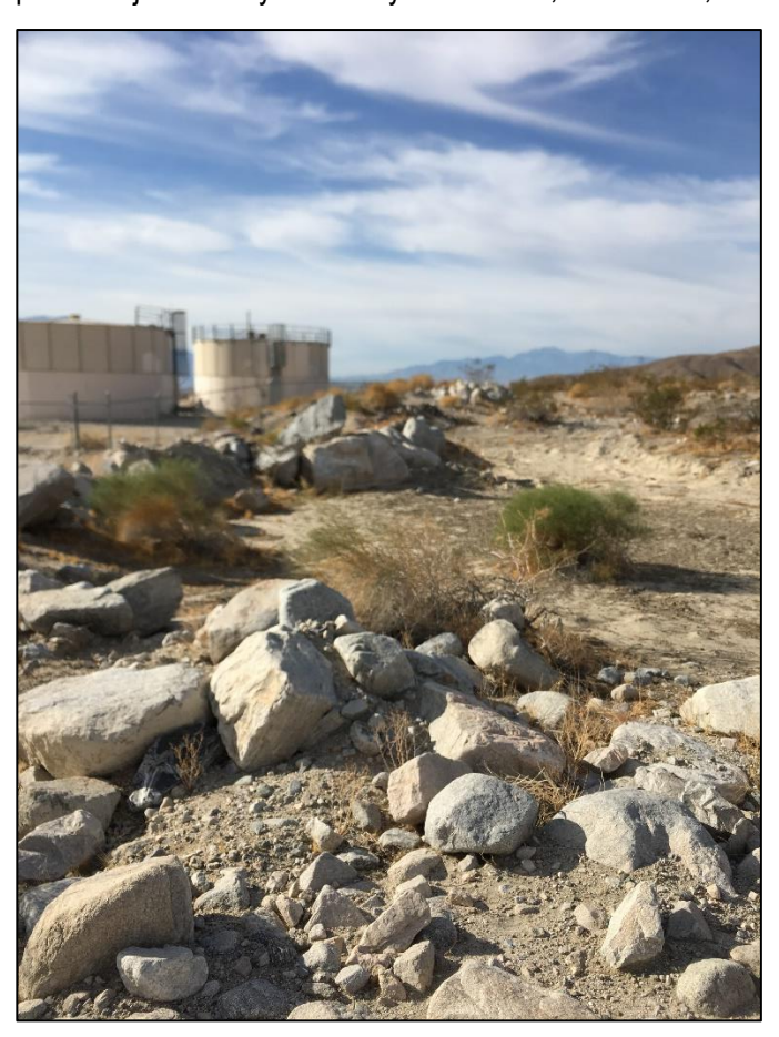
Photograph 6: Project survey view, Transect 5, facing West