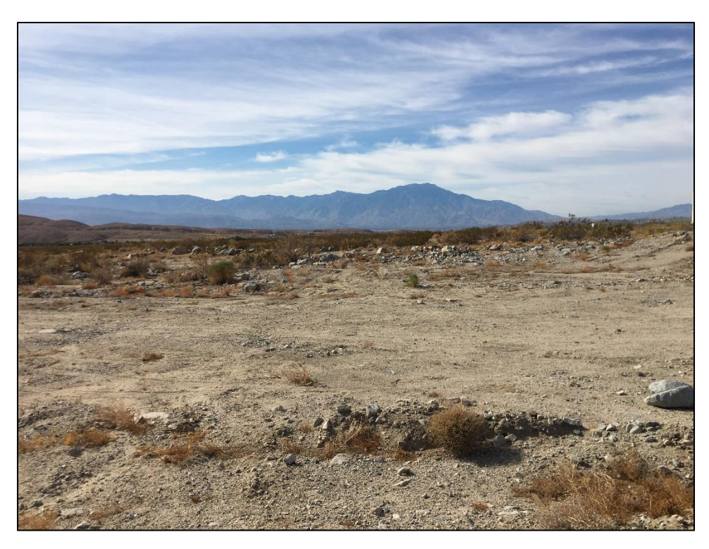
Photograph 1: Project survey view, Transect 1, facing West