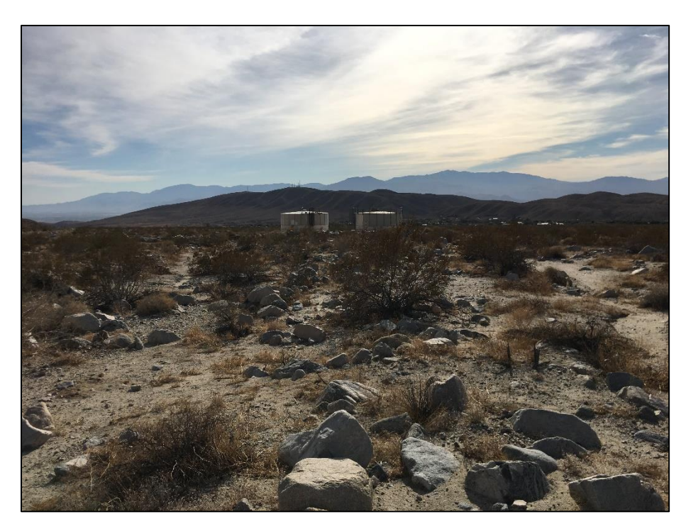
Photograph 5: Project survey boundary NW corner, Transect 3, facing South