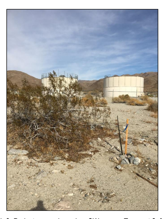
Photograph 3: Project survey boundary SW corner, Transect 2, facing North