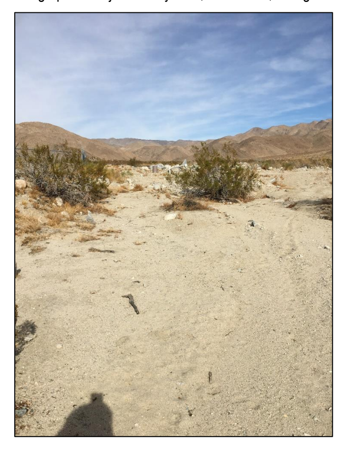
Photograph 2: View to north of wash, Transect 1, facing North