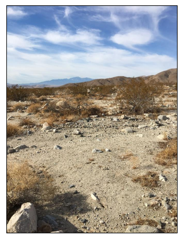
Photograph 4: Project survey view, Transect 2, facing West