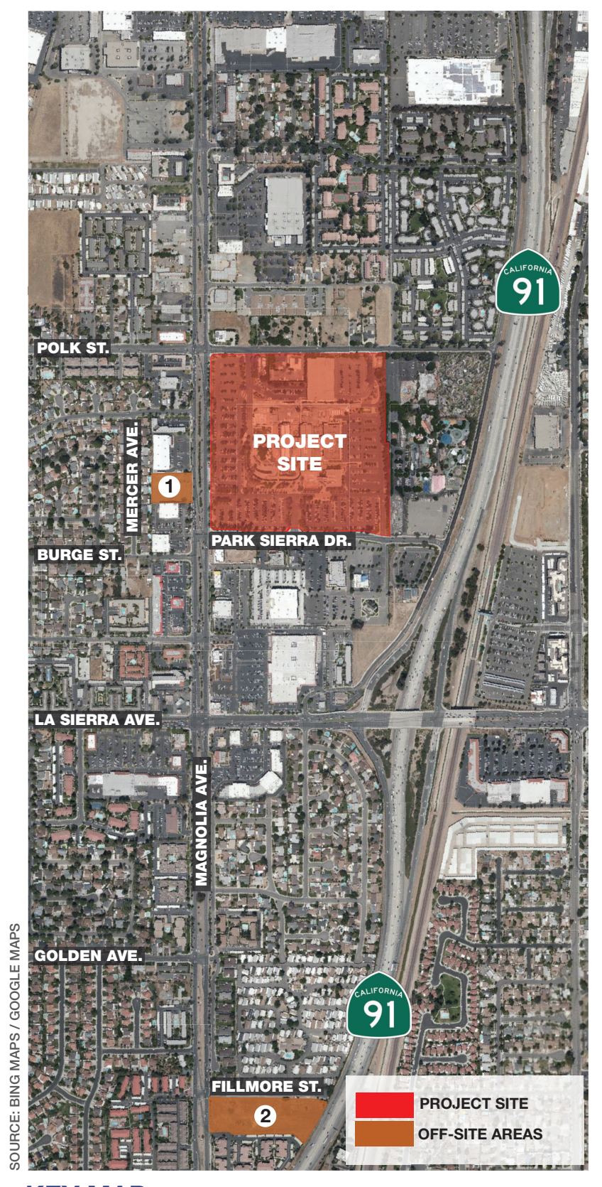
KEY MAP SCALE: 1" = 1,000'