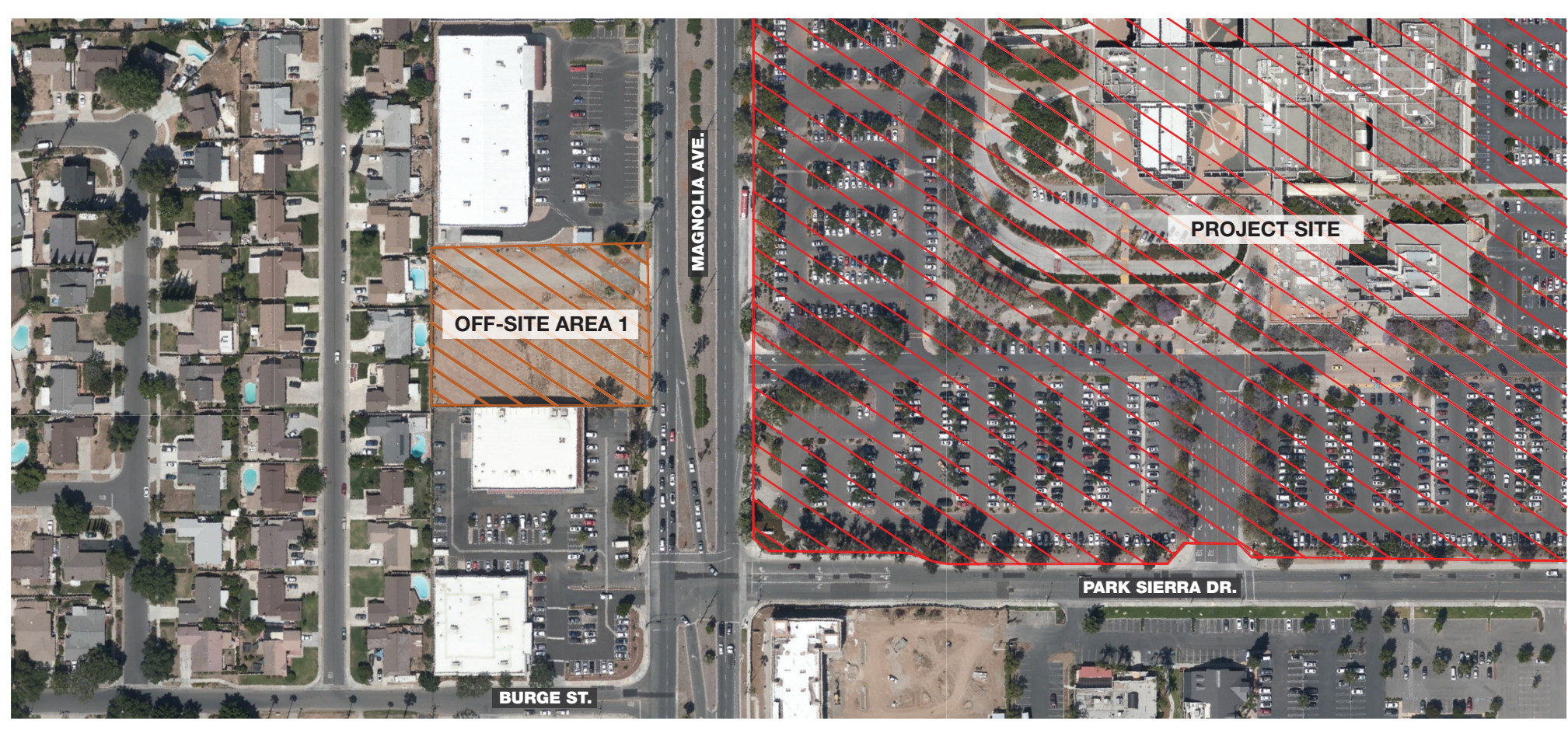
OFF-SITE AREA 1 SCALE: 1" = 60'