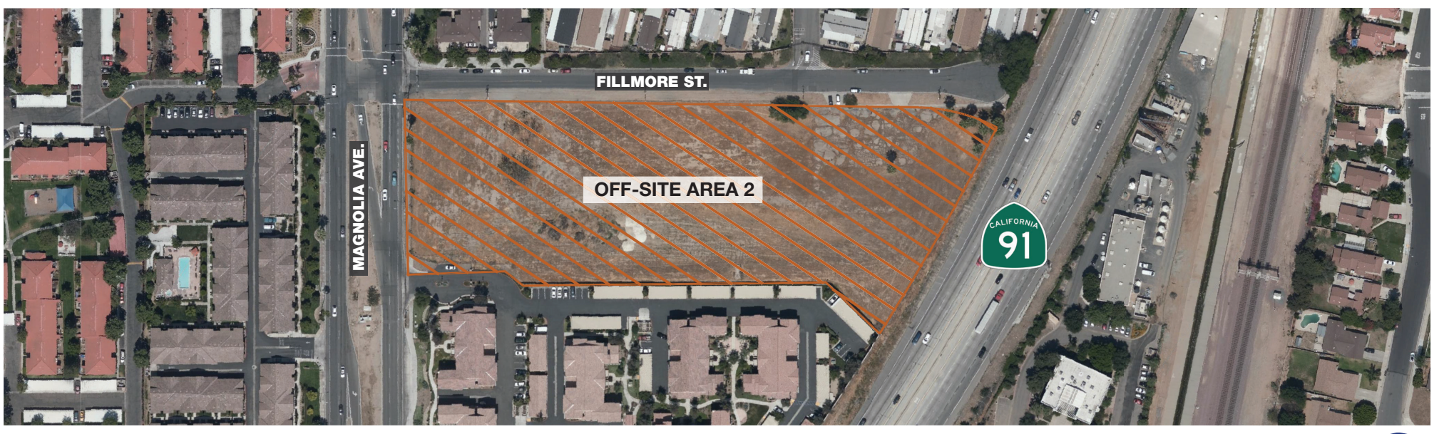
OFF-SITE AREA 2 SCALE: 1" = 60'