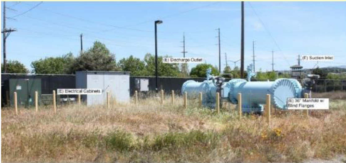
Figure 3. Current Site Condition

The planned project includes the following elements: