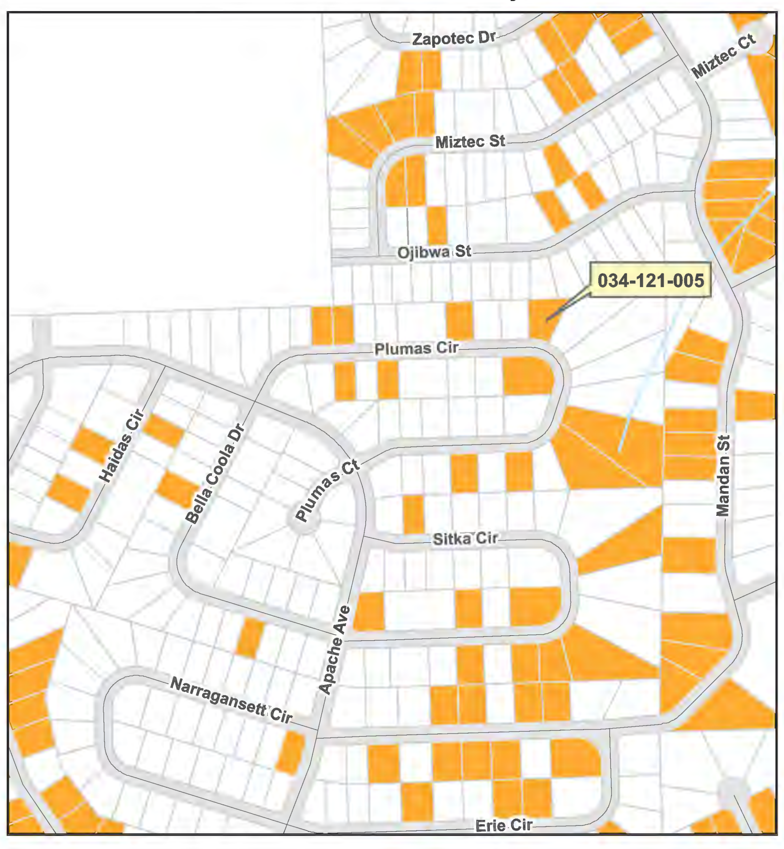
EXHIBIT A Plumas Urban Lot Restoration Project 2