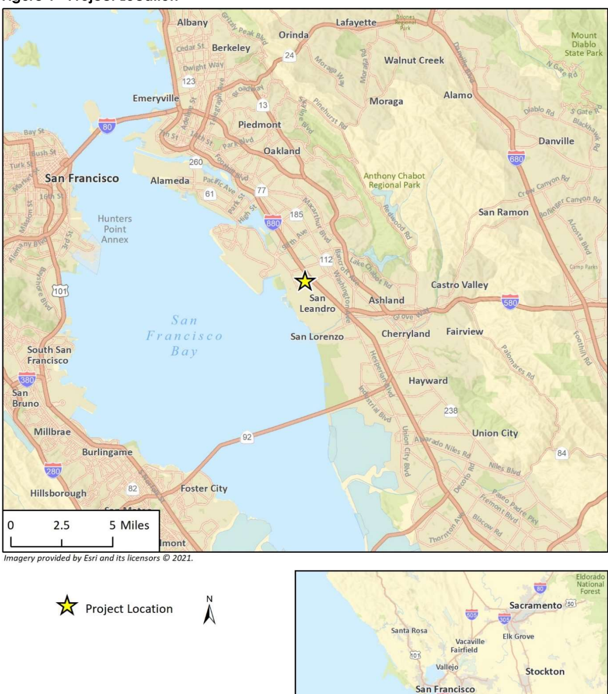
Figure 1 Project Location