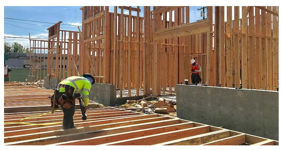
Figure 1-1. Construction of New Housing, photo by Andrew Bowen,

Providing adequate housing for all residents is a priority for the City of Isleton as to California as a whole. The State has declared that "the availability of housing is a matter of vital statewide importance and the attainment of decent housing and a suitable living environment for all Californians is a priority of the highest order." (Cal. Gov't Code § 65580)