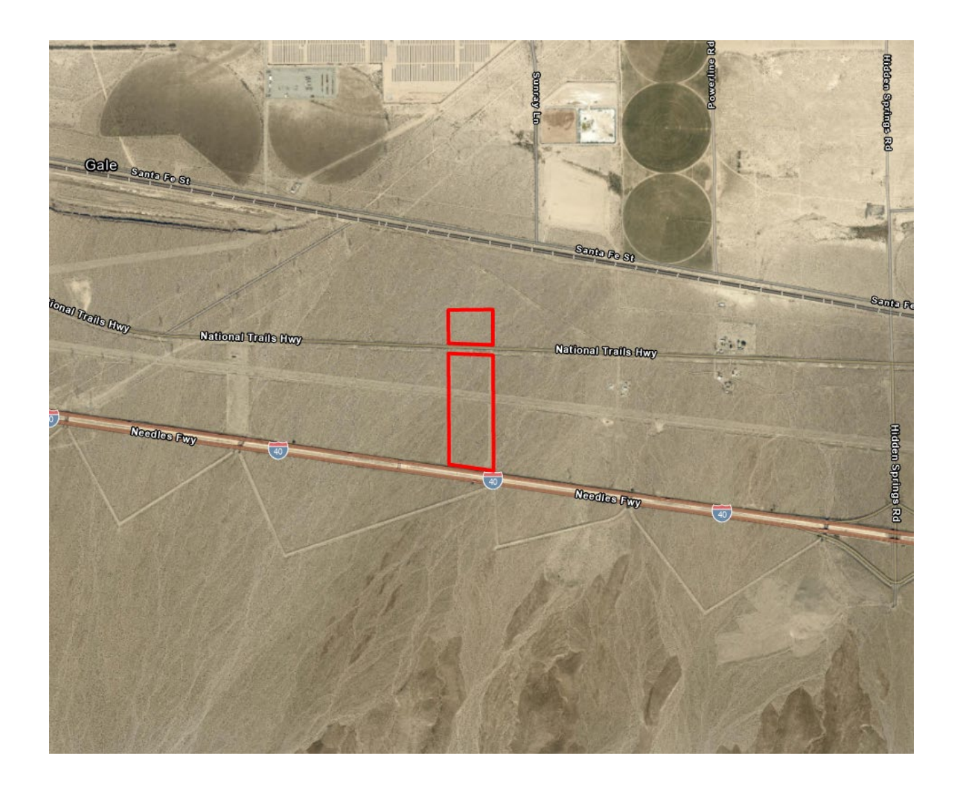
Figure 1 Vicinity Map (Aerial View)