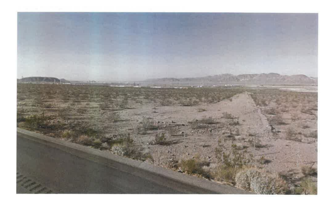
Figure 5 Site Photographs – continued

Looking northwest at project site from I-40 (westbound)