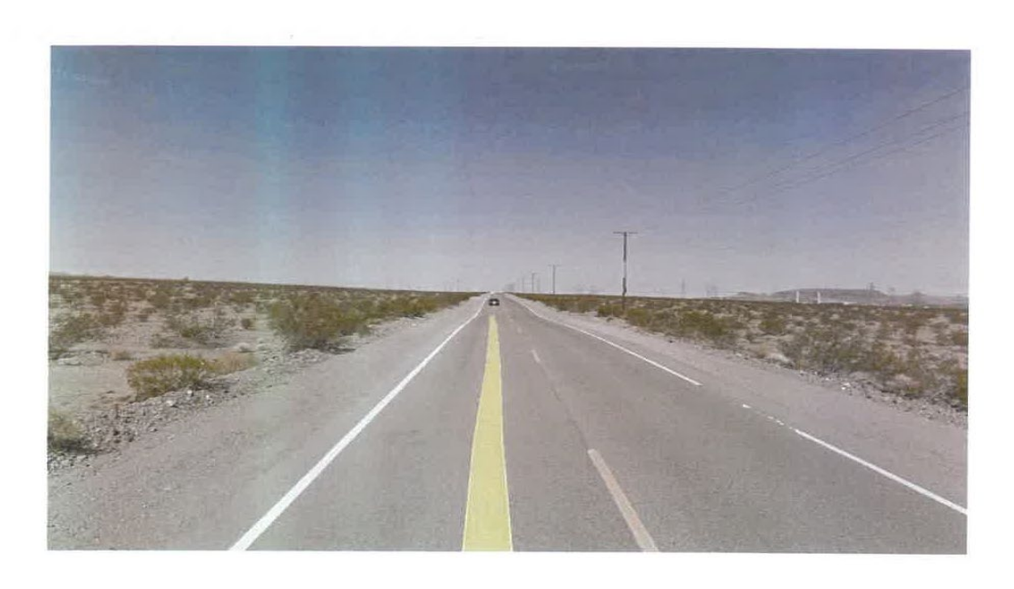
Looking west along National Trails Highway