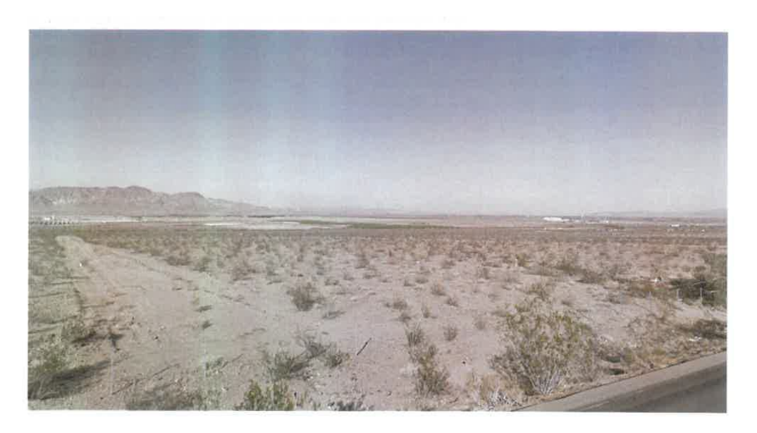
Looking northeast at project site from I-40 (westbound)

Looking northwest at project site from I-40 (westbound)