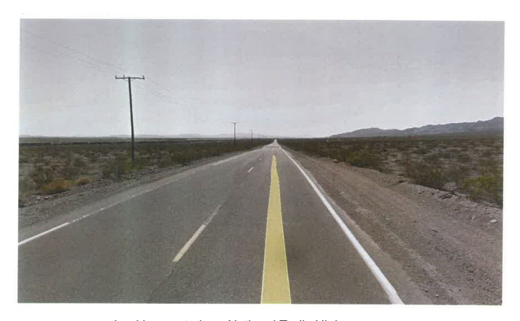
Looking east along National Trails Highway