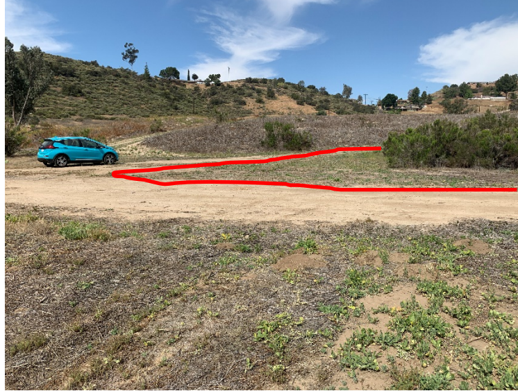
Photo 6 – Potential receiver site at Hanson Pond in the vicinity of Population #20.