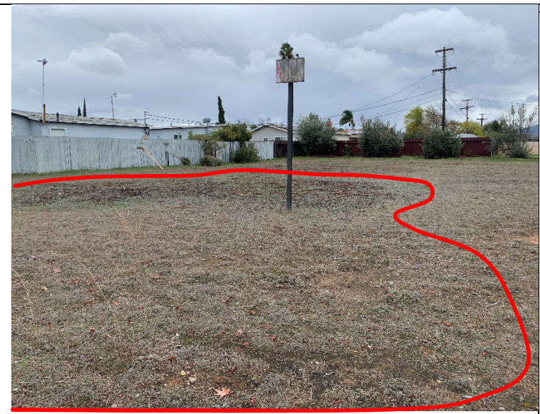
Photo 1 – Extant San Diego ambrosia population at Oakdale donor site.