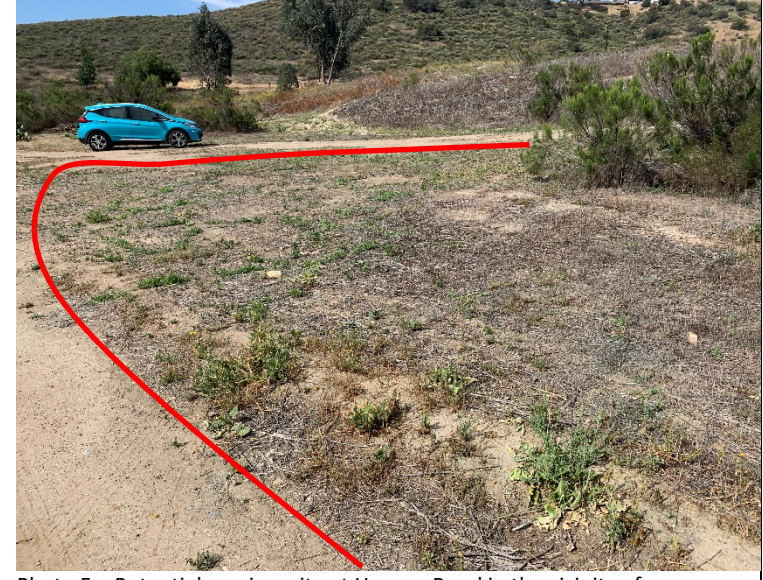
Photo 5 – Potential receiver site at Hanson Pond in the vicinity of Population #20.