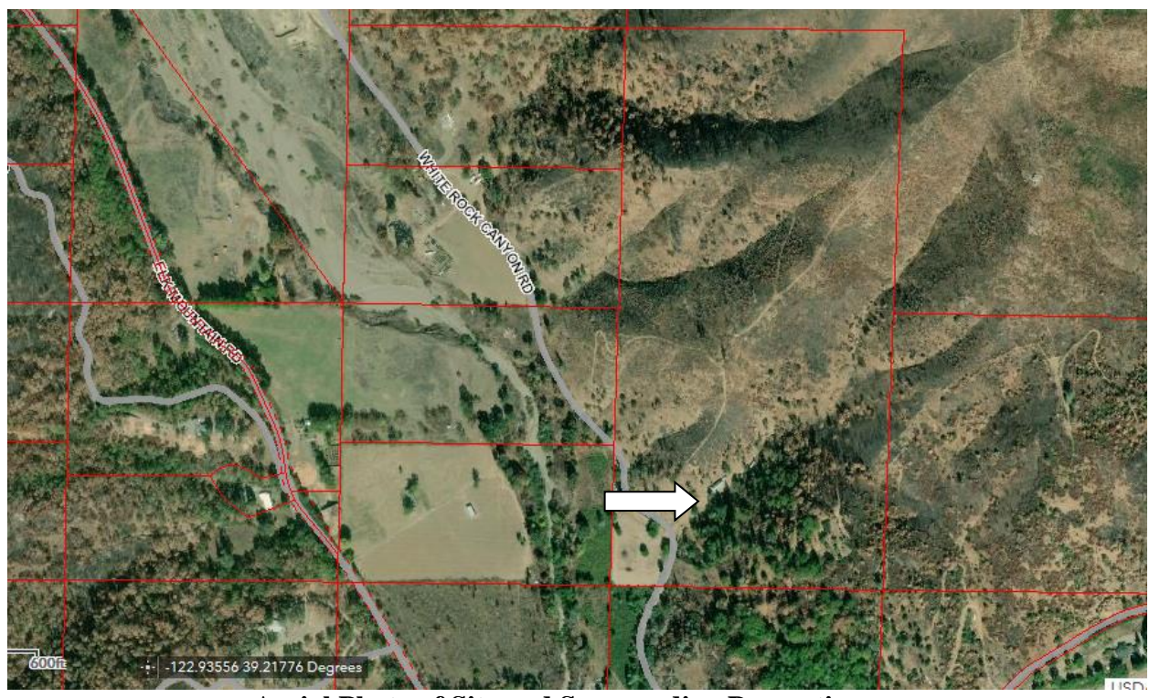
Aerial Photo of Site and Surrounding Properties