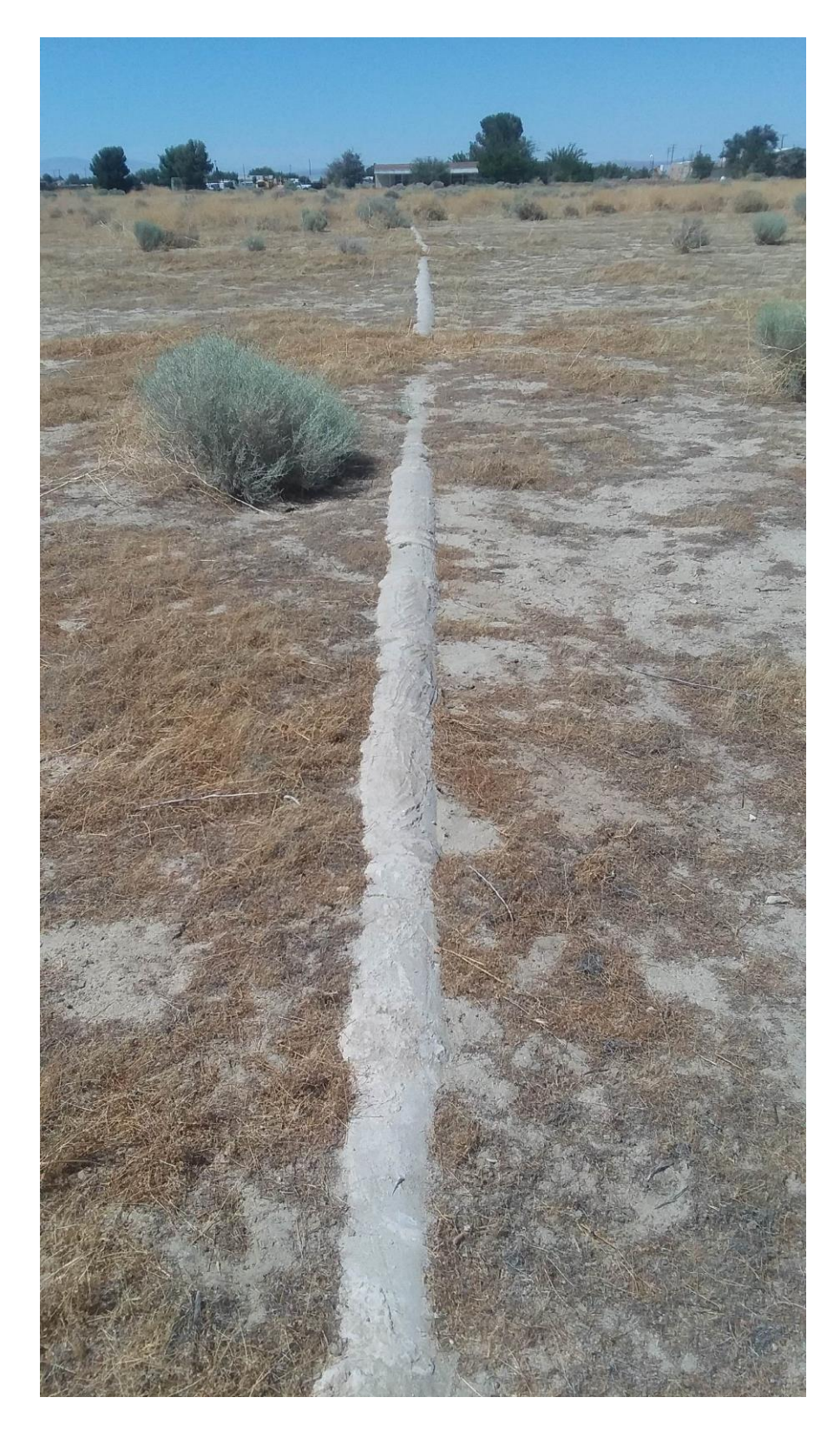
Figure 3 Site R-2, Agricultural Water System, View to the North