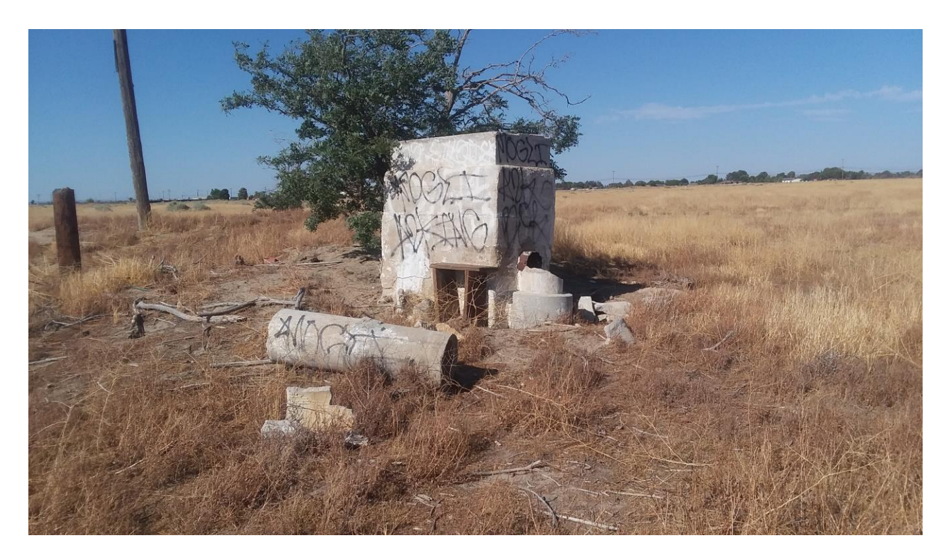
Figure 5 Site R-3, Homestead Remains, View to the West