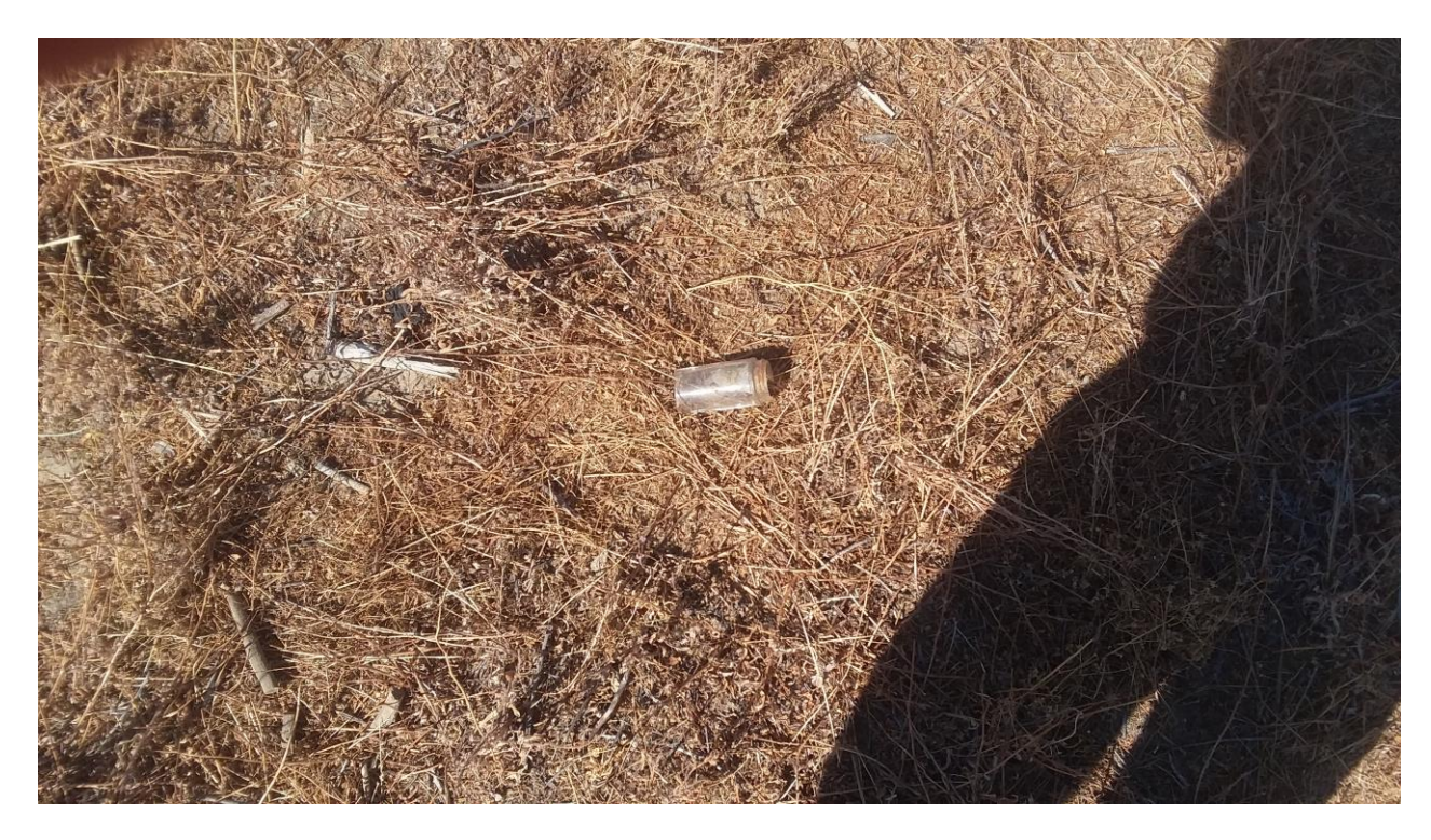
Figure 7 Site R-3, Intact Sample Bottle