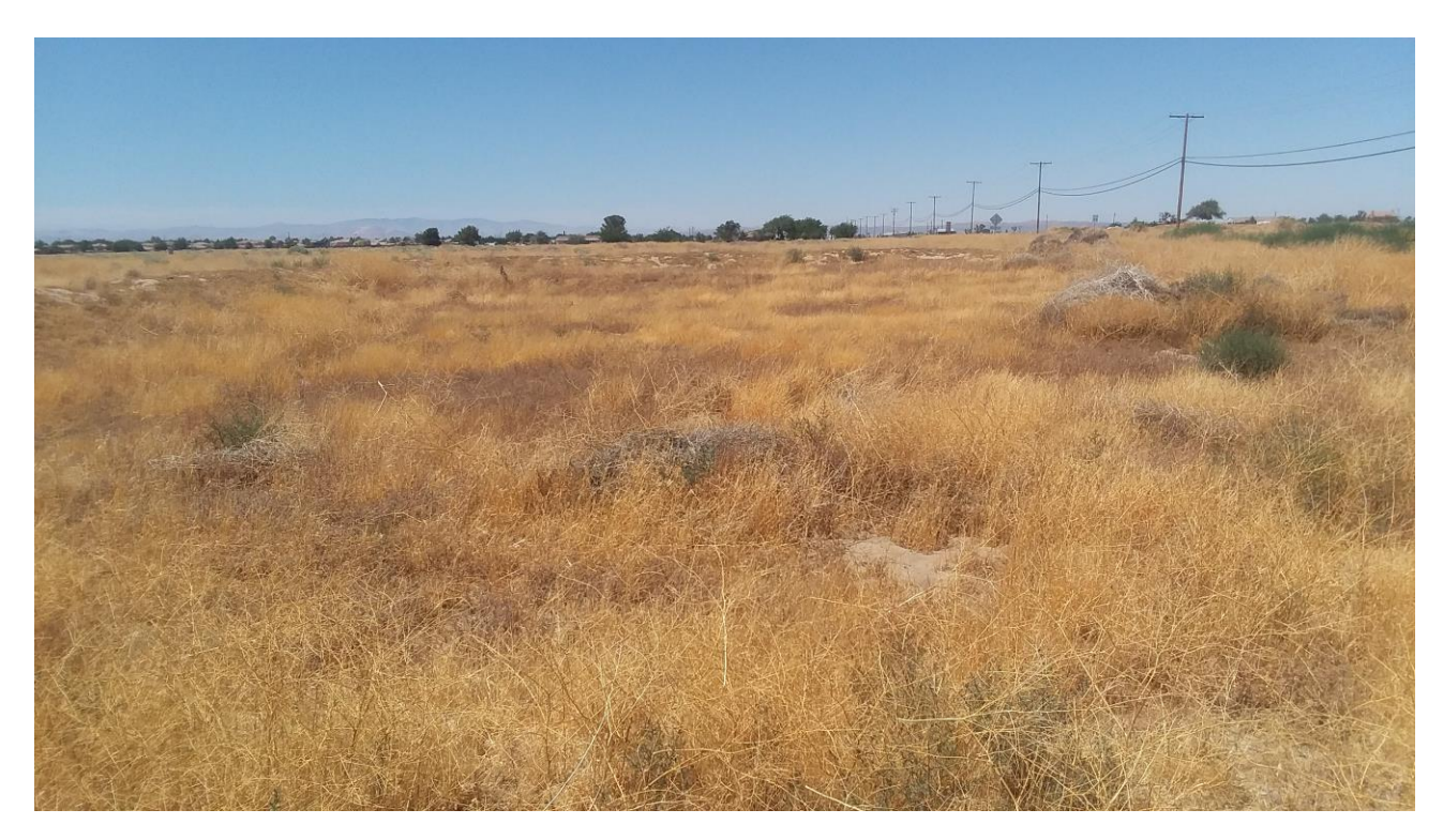
Figure 2 Site R-1, Sump/Pond, View to the North

R-3 is the remains of a small homestead on the western edge of the parcel. The homestead is primarily a concrete block that has been heavily tagged with graffiti (Figure 5). Fence posts, a set of wooden steps, and a large underground cistern are also present (Figure 6). Although, some architectural remains, including wall boards, are presents, the outlines of the homestead are difficult to discern. No intact foundation or roofing elements are present to assist with understanding the nature of this small homestead. A smattering of domestic artifacts, including both food cans and bottles, are present, which suggest that the homestead dates to the 1930s. Most of the artifacts are broken and disintegrated, except a few intact bottles (Figure 7).