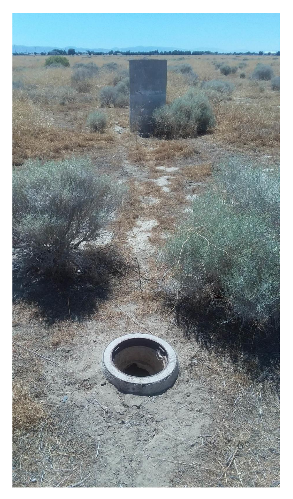
Figure 4 Site R-2, Agricultural Water System, View to the West