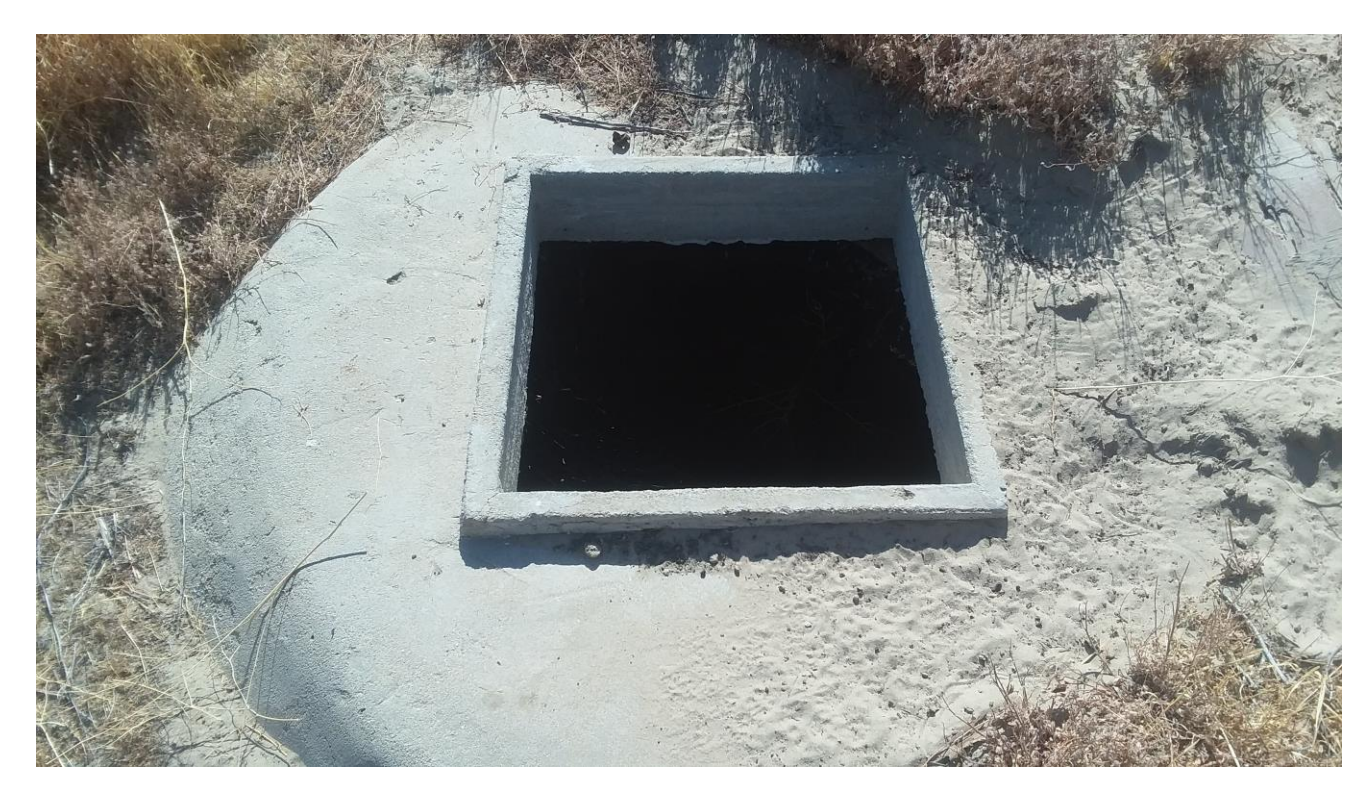
Figure 6 Site R-3, Underground Cistern