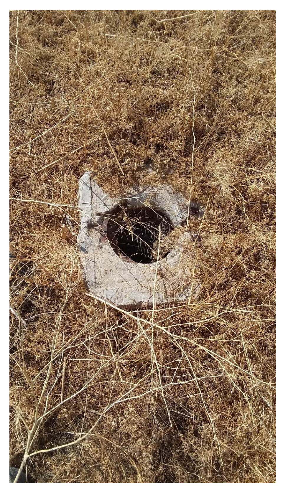
Figure 4 R-2, Underground Waterline