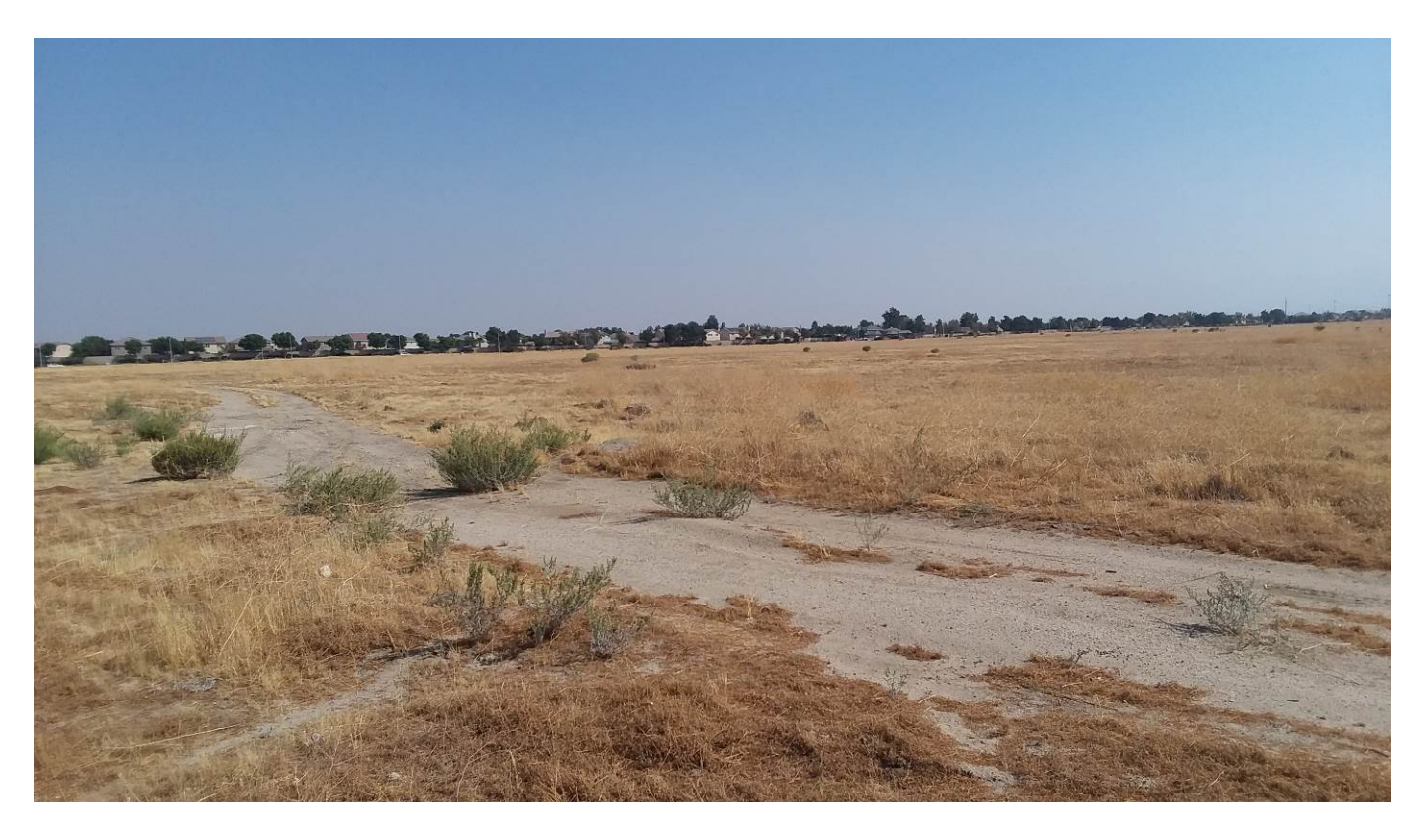
Figure 2 Project Area, View to the West

Flat were believed to have extended their food-collecting activities into the surrounding mountains (Wallace 1977:121).