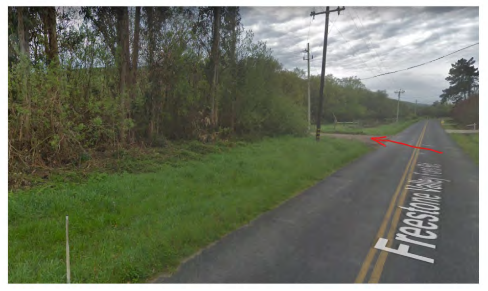
Figure 5. Property entrance along Freestone Valley Ford Road, looking south.

Following County "Visual Assessment Guidelines," <sup>6</sup> public viewpoints were considered for determining the project's visibility to the public. Based on the County "Visual Assessment