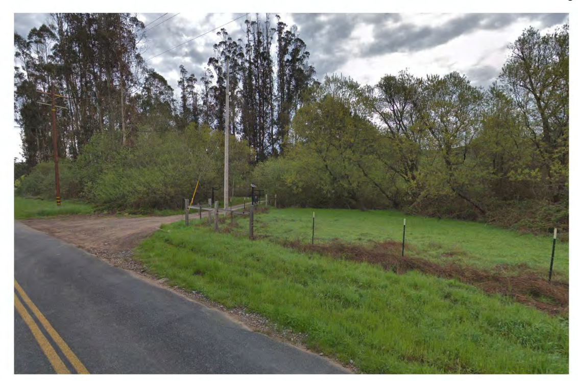
Figure 4. Property entrance along Freestone Valley Ford Road, looking north. (Google Maps, 2019)