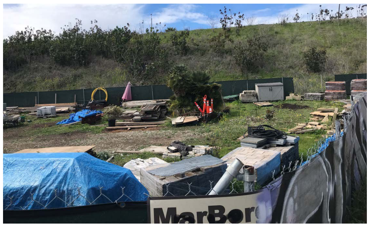
Photograph 5. View of a developed area (storage yard) in the project site. Photograph taken from near the northern corner of the project site facing west.