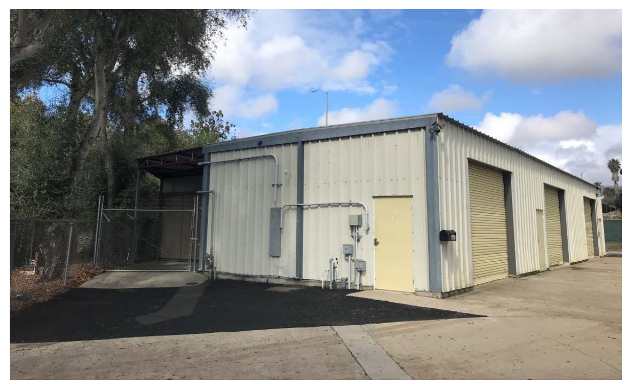
Photograph 4. View of an existing structure in a developed area of the project site. Photograph taken near the southwestern corner of the project site facing northwest.