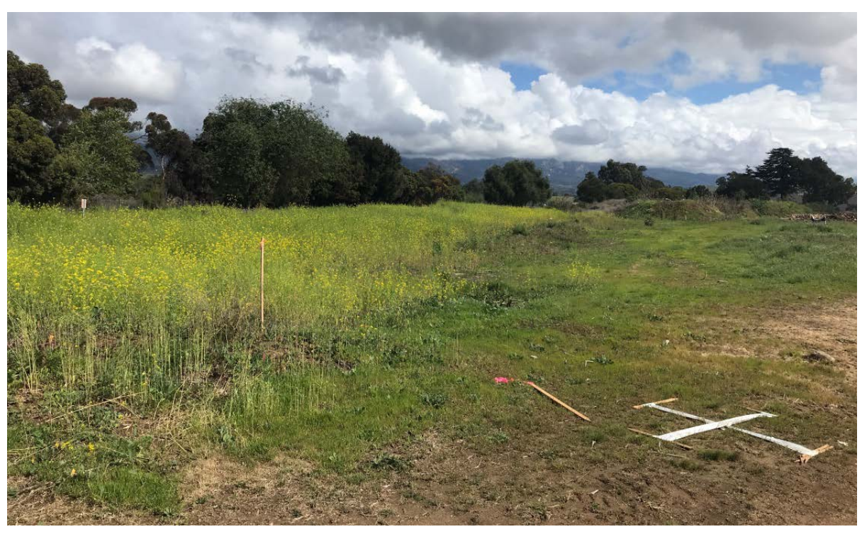
Photograph 8. View of disturbed vegetation in the biological study area north of the project site. Photograph taken near the northern corner of the project site facing east.