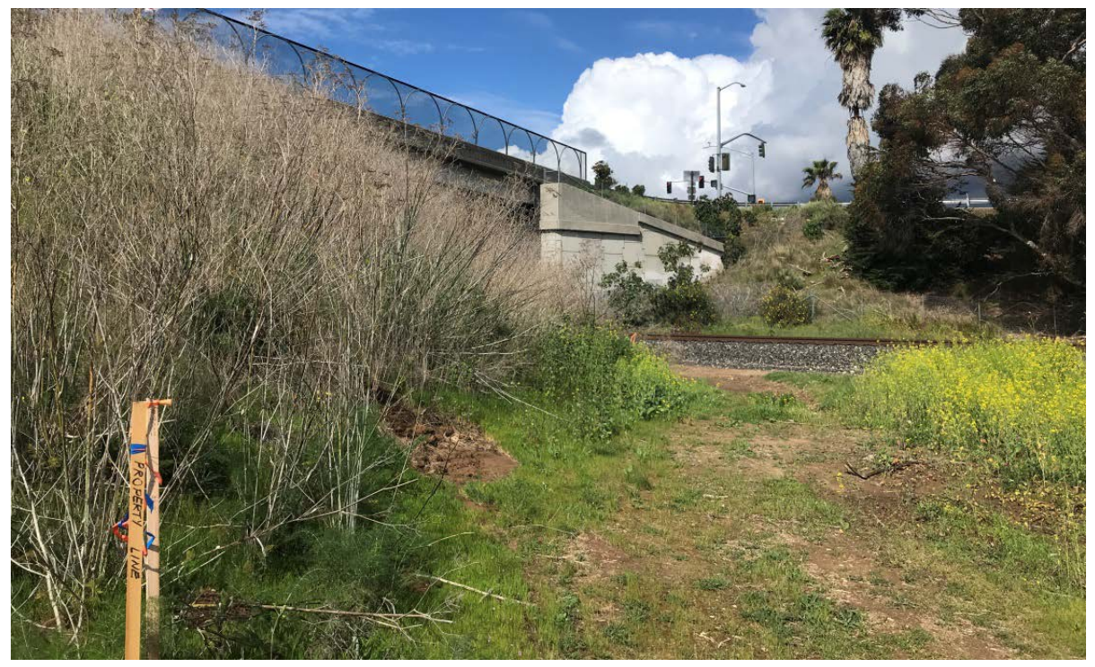
Photograph 7. View of disturbed vegetation, the Amtrak railway, and the Storke Road overpass in the biological study area north of the project site. Photograph taken near the northern corner of the project site facing northwest.