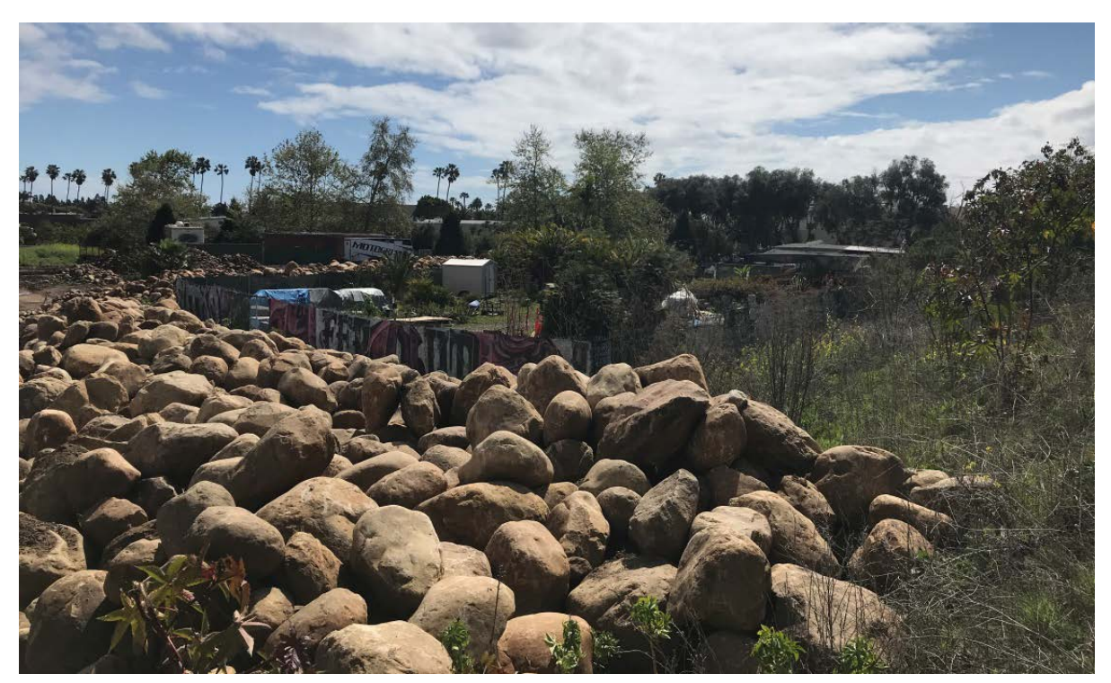
Photograph 6. View from near the northern corner of the project site facing southeast.