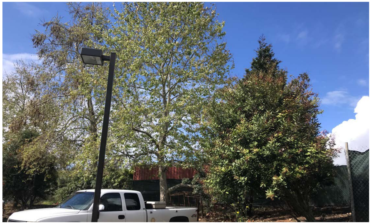
Photograph 3. View of California sycamore woodland in the project site. Photograph taken near the northern boundary of the project site facing west.