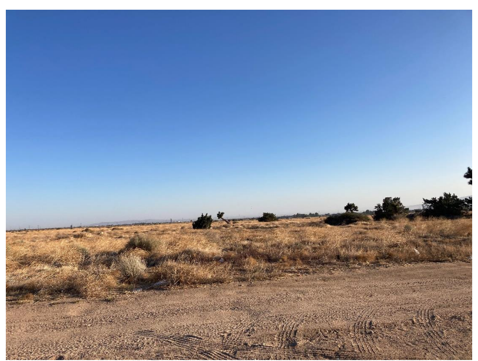
Figure 4. At southeast corner of the Building 1 site, showing general survey conditions, view looking north (IMG 1159)

Figure 3. At southwest corner of Building Site 2, showing off-road vehicle tracks and general survey conditions, view looking northeast (IMG 1141)