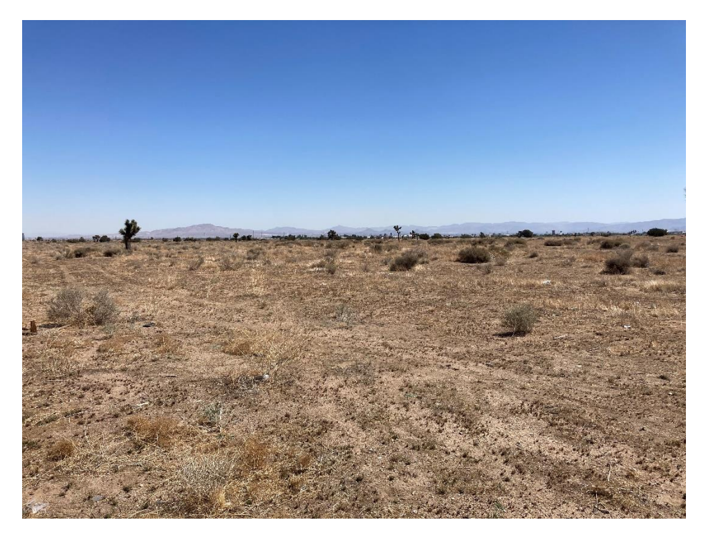
Figure 3. At southwest corner of Building Site 2, showing off-road vehicle tracks and general survey conditions, view looking northeast (IMG 1141)