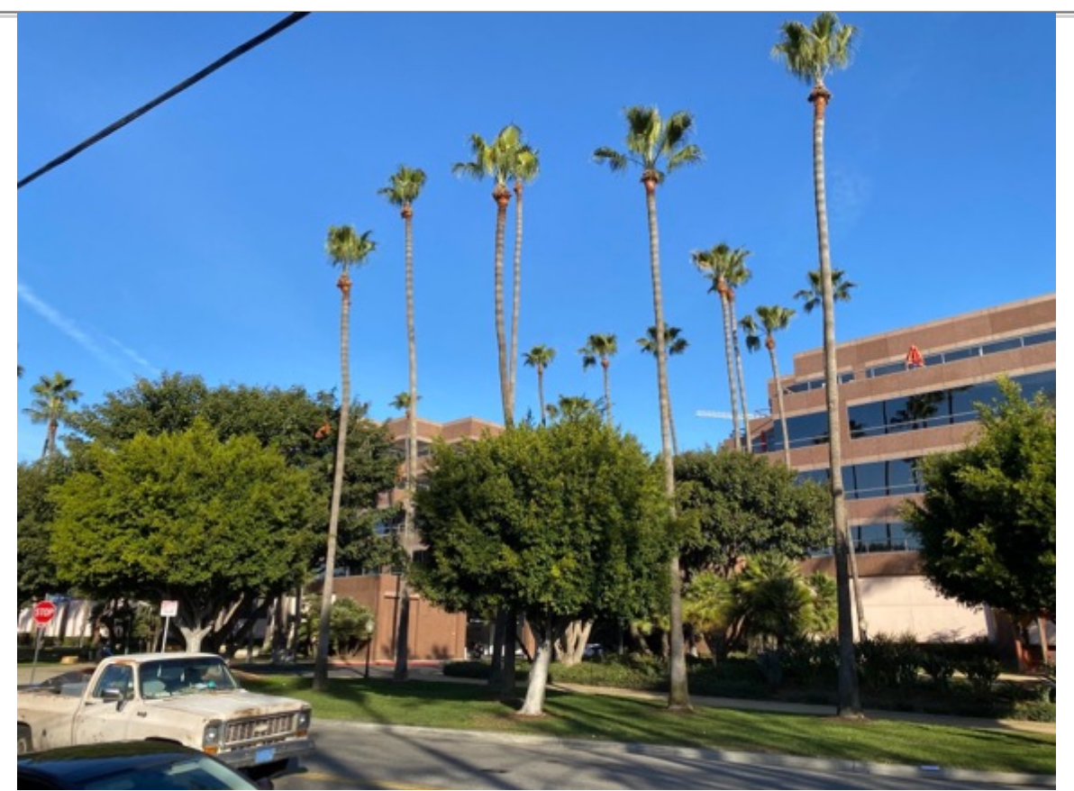
Trees along Eighth Street side of the site