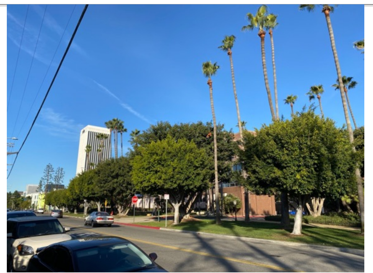
City Ficus trees along Eighth Street