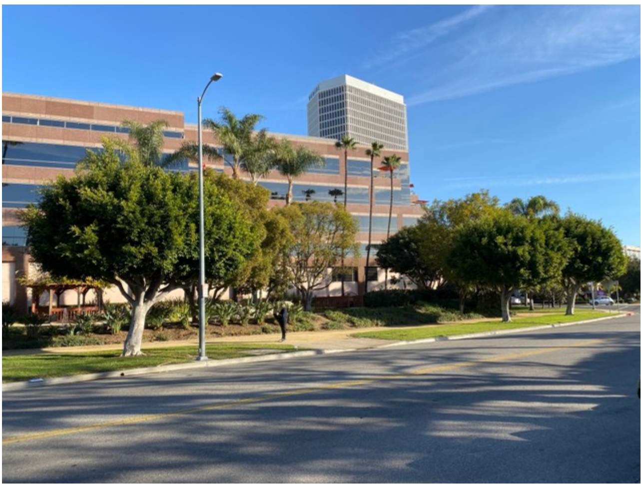
Trees along Eighth Street side of the site