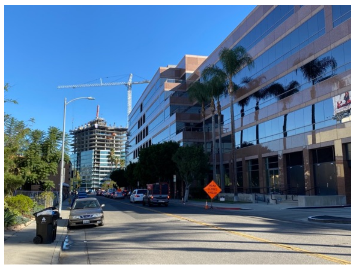
City Ficus Trees along Curson Ave