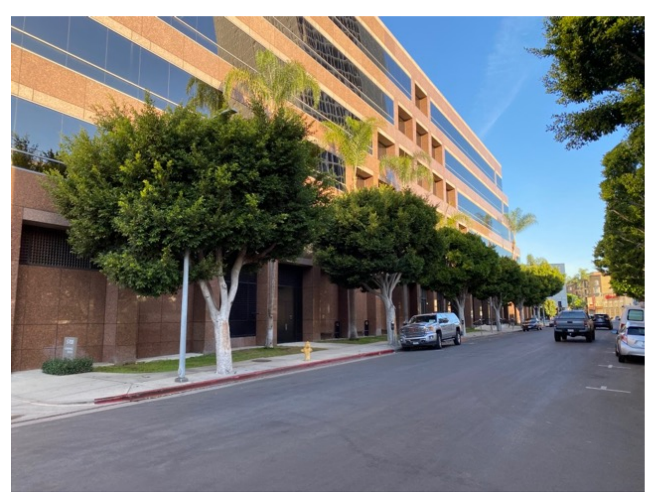
City Ficus trees and private property Queen Palm trees along Masselin Ave