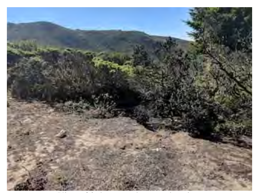
View of 3rd proposed turnout location.