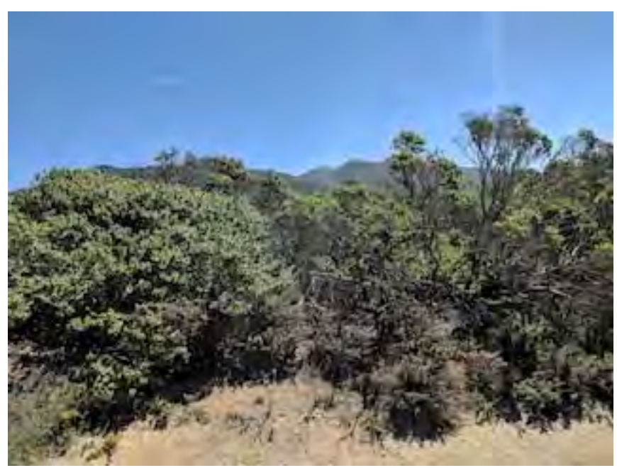
View of lower proposed turnout location facing southeast.