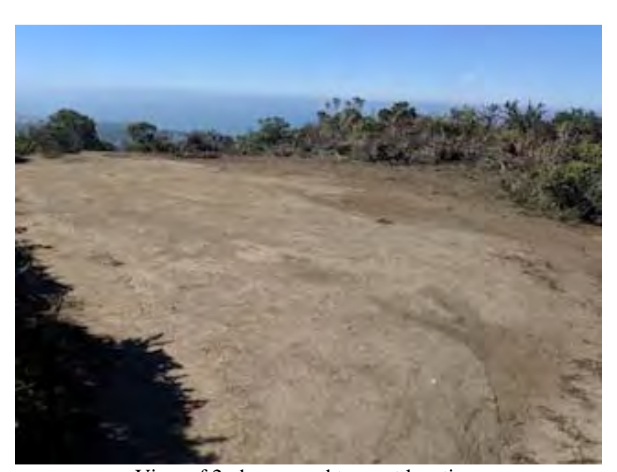
View of 2nd proposed turnout location.