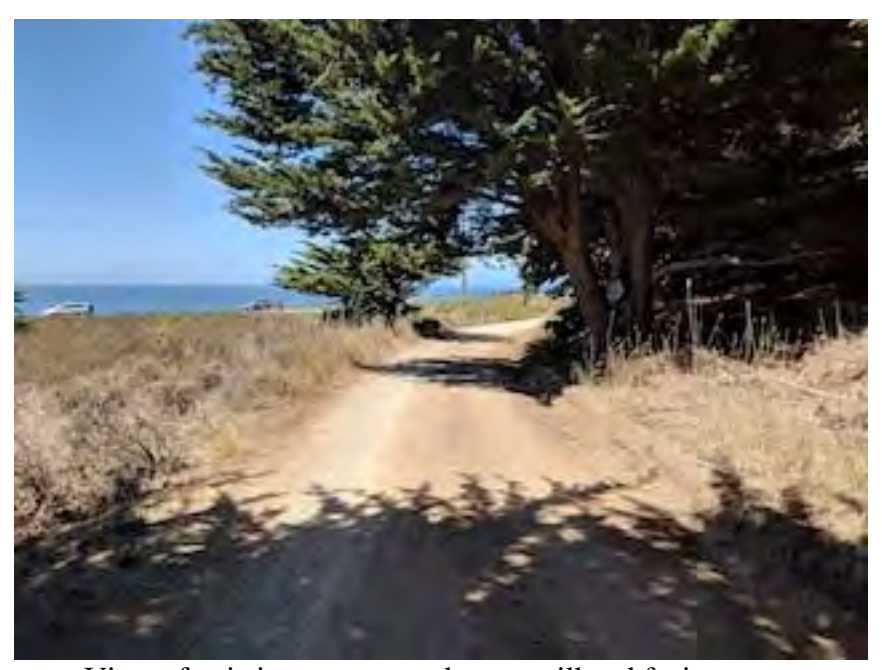
View of existing access road near trailhead facing west.