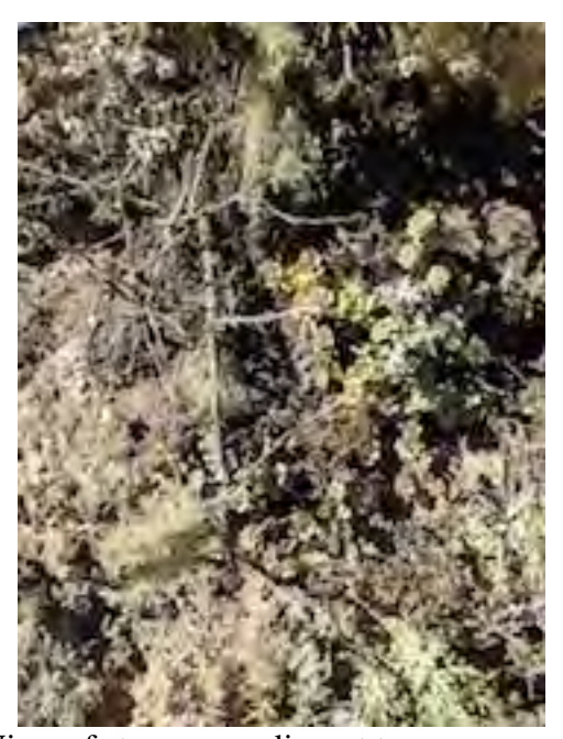
View of stonecrop adjacent to access road.