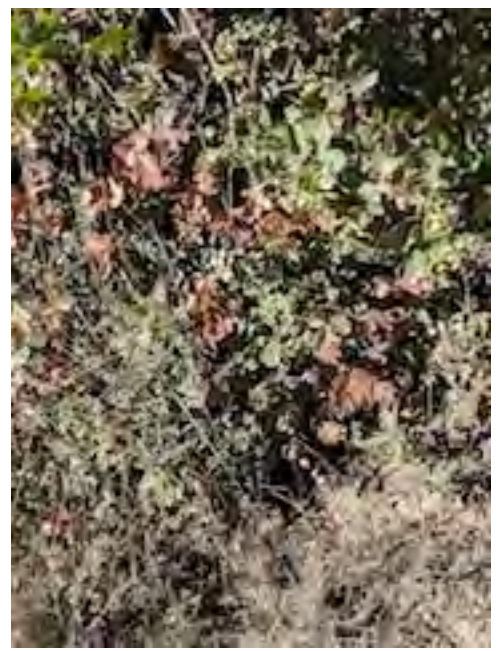
View of stonecrop adjacent to access road