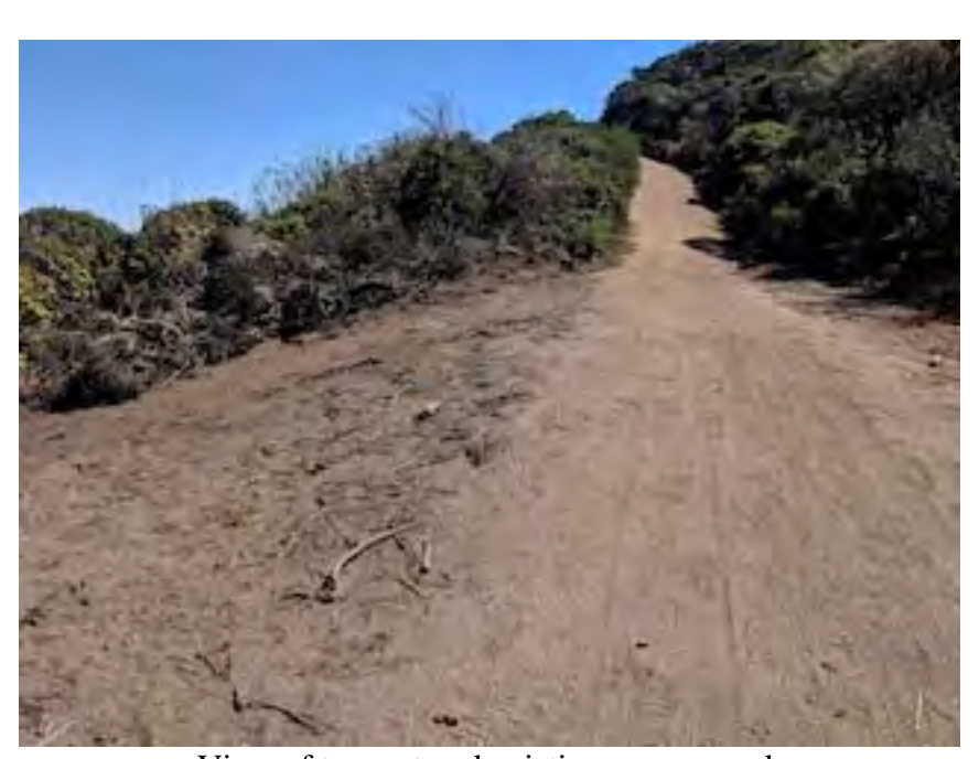
View of turnout and existing access road.