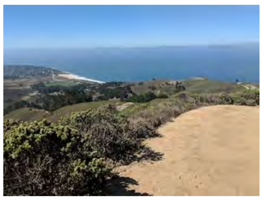
View of lower proposed turnout location facing south.