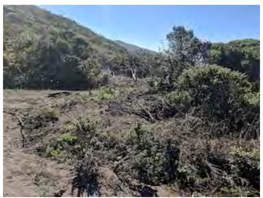
View of 2nd proposed turnout location.