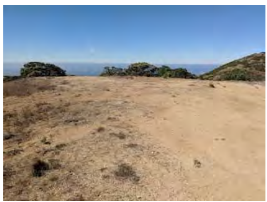
View of upper proposed turnout location.