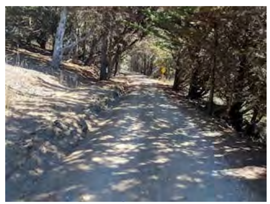
View of existing access road near trailhead facing east.