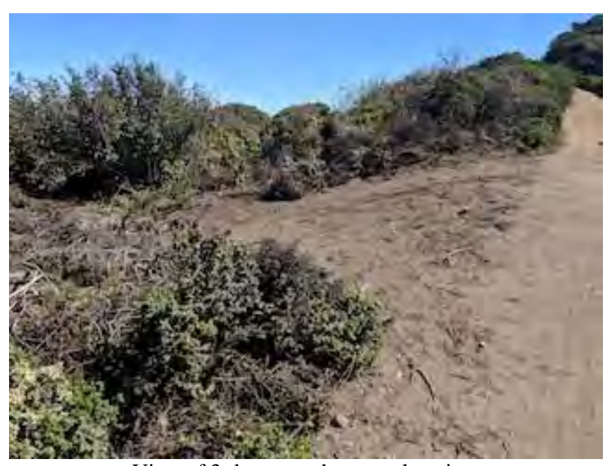
View of 3rd proposed turnout location.