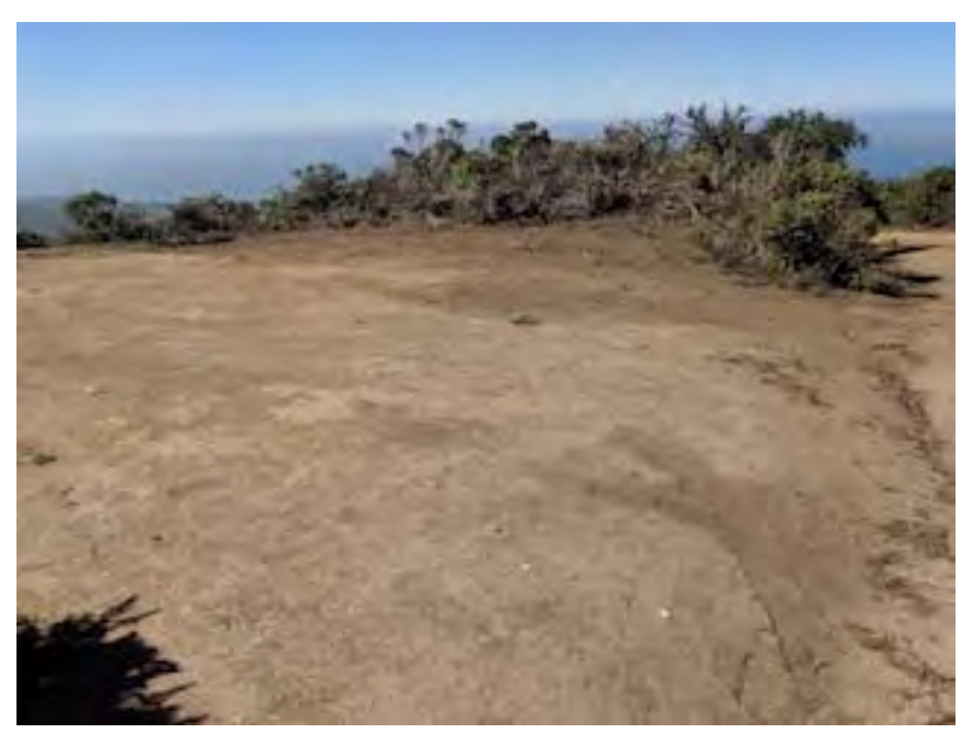
View of 2nd proposed turnout location.