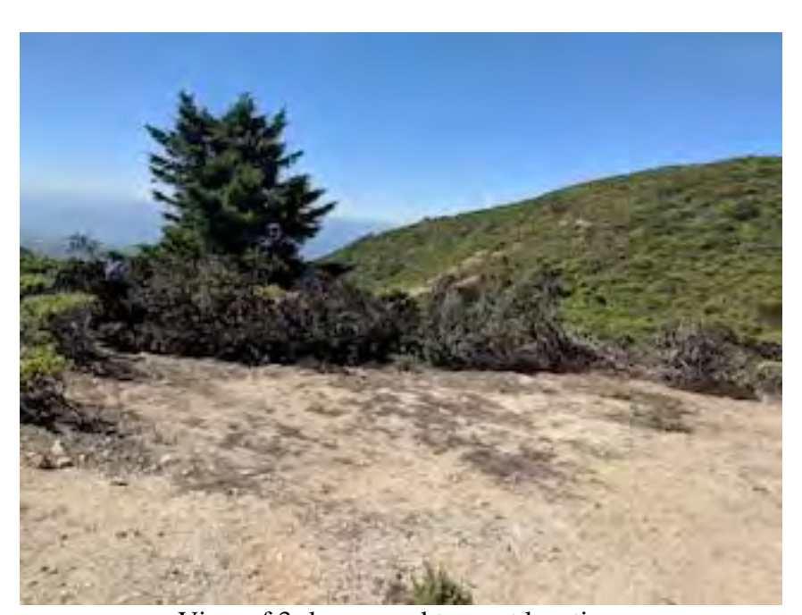
View of 3rd proposed turnout location.