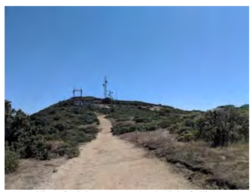
View of existing access road and cellular facility.