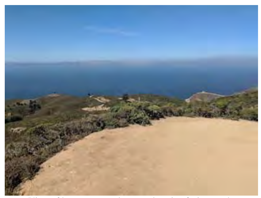
View of lower proposed turnout location facing south.