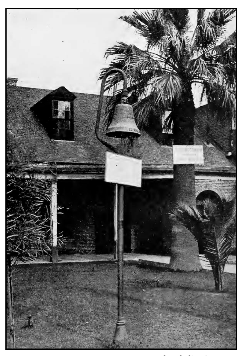
PHOTOGRAPH 1 First Bell Erected on El Camino Real at the Plaza Church, Los Angeles