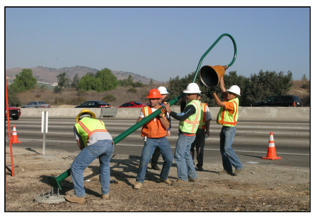
{\bf PHOTOGRAPH~4} "Caltrans" Style Staff, Circa 2012