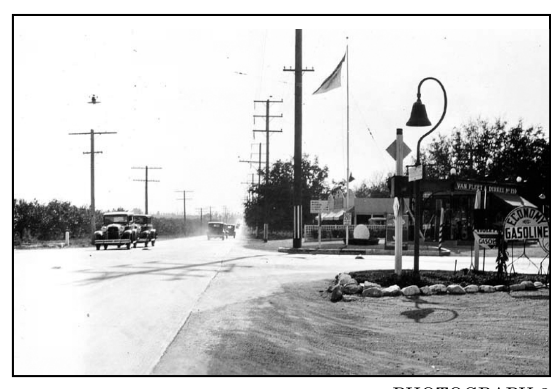
{\bf PHOTOGRAPH~3}\\ {\bf ``Curved''~Style~Staff,~Circa~1920}