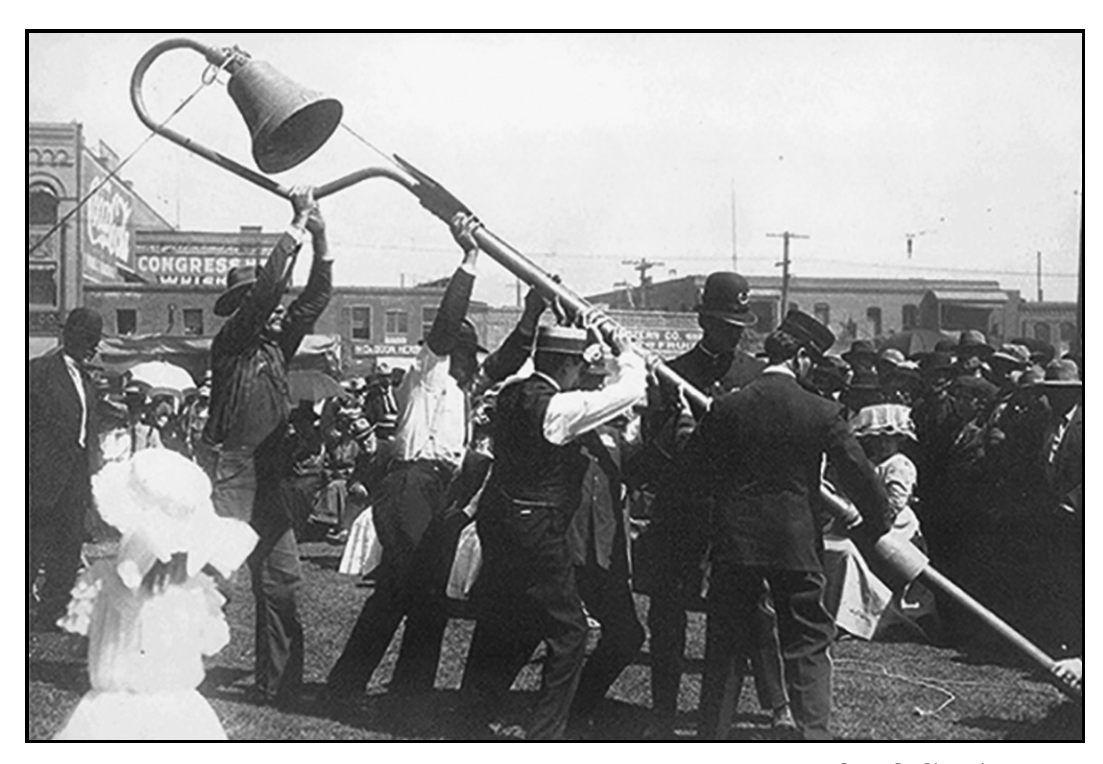
PHOTOGRAPH 2 "Paper Clip" Style Staff, Circa 1906