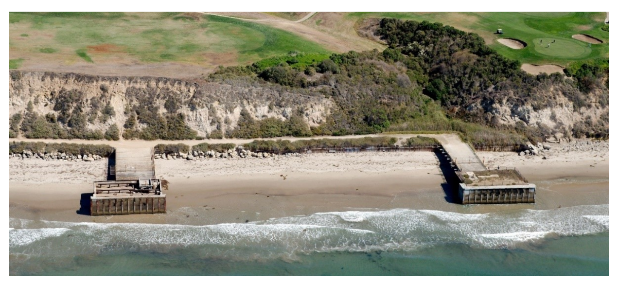
Figure 2. PRC 421 Piers and Caissons