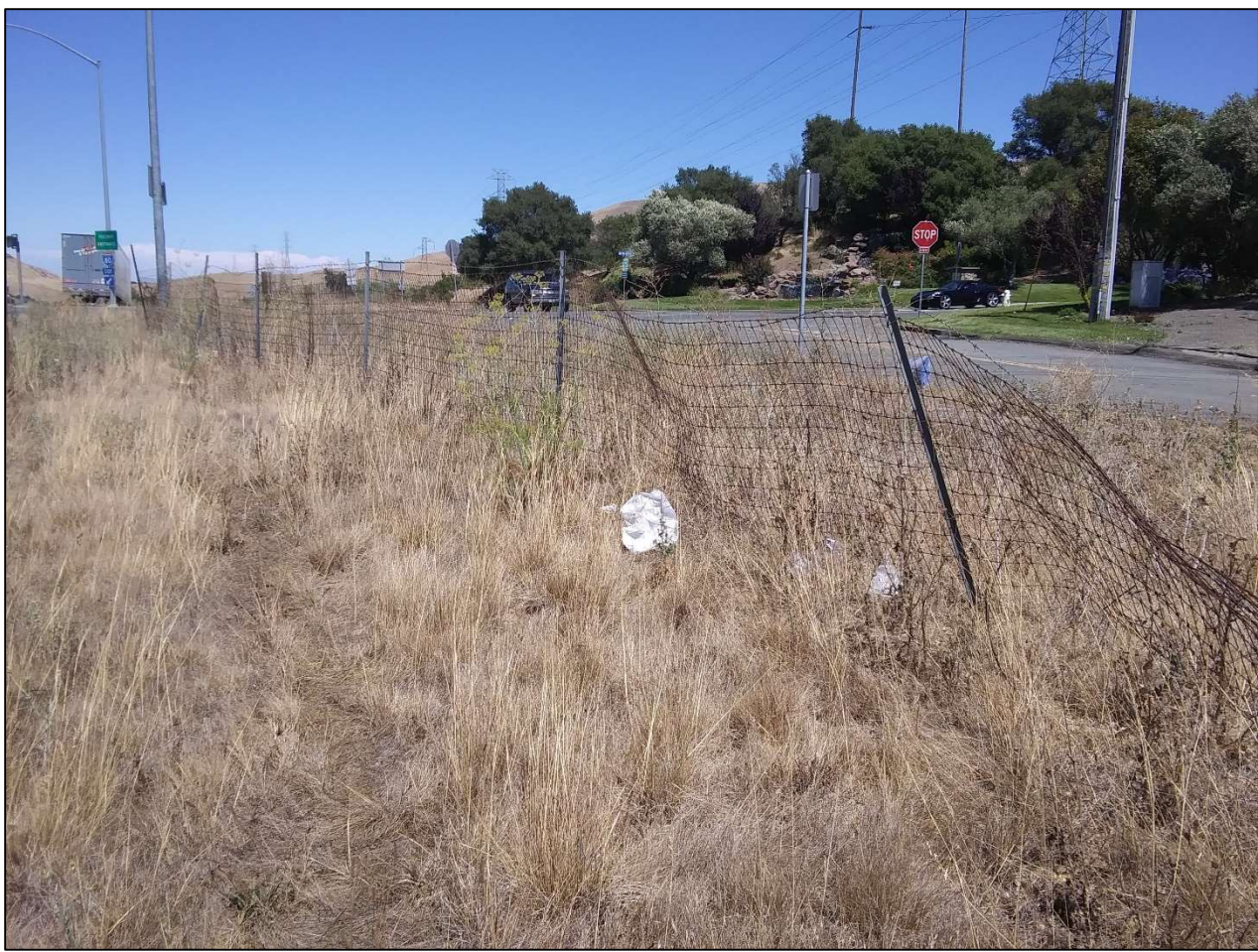
Figure 4. McGary Road and Hiddenbrooke Parkway, dense vegetation and fence along road, facing east