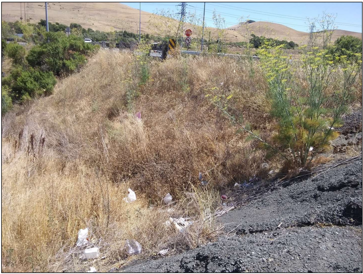
Figure 5. American Canyon Road with modern debris and dense vegetation, facing southeast