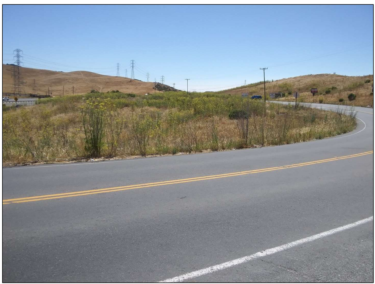
Figure 6. American Canyon Road with dense vegetation, facing southwest