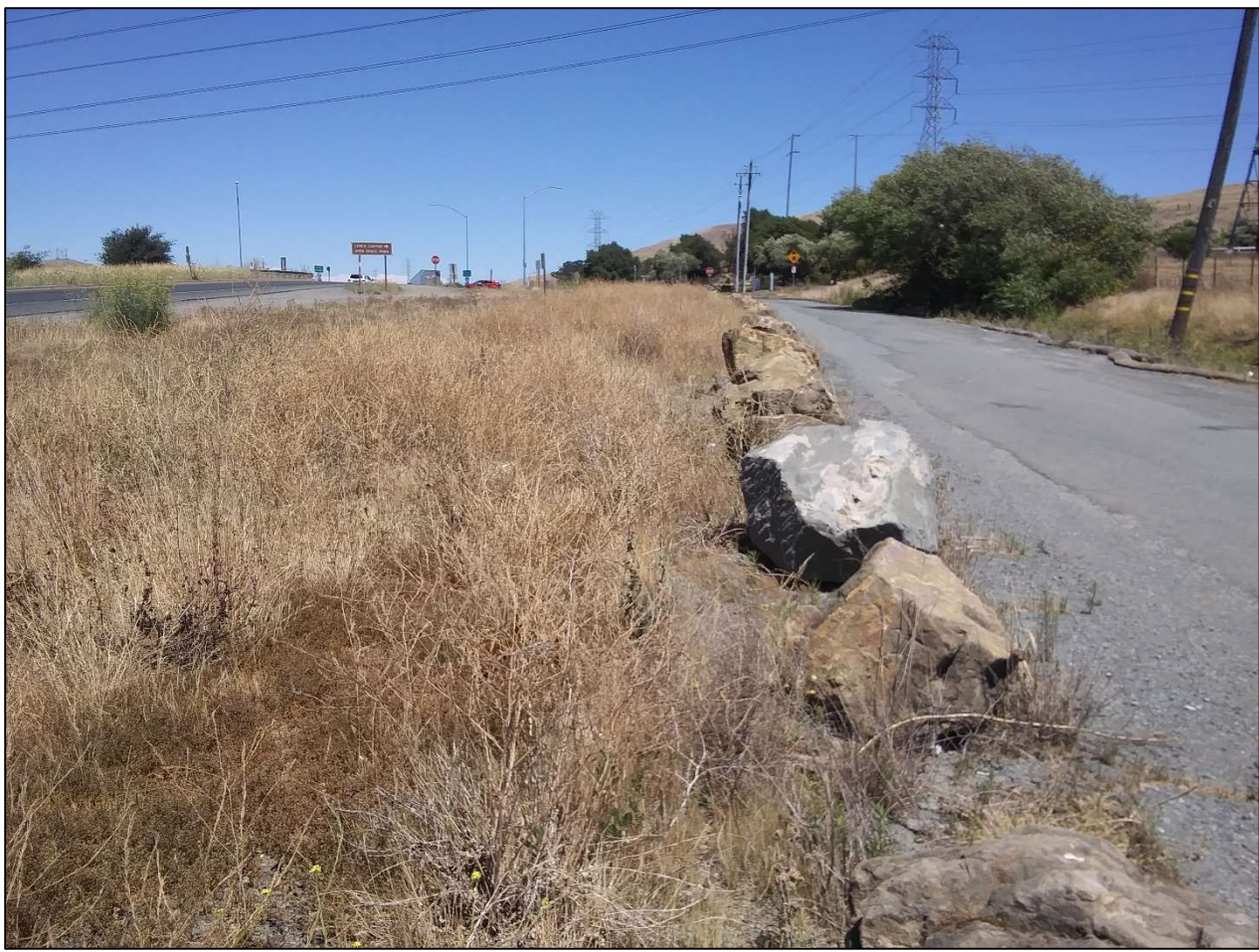
Figure 3. McGary Road, facing northeast