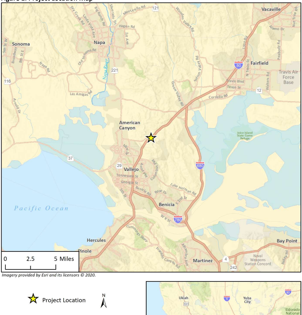
Figure 1. Project Location Map