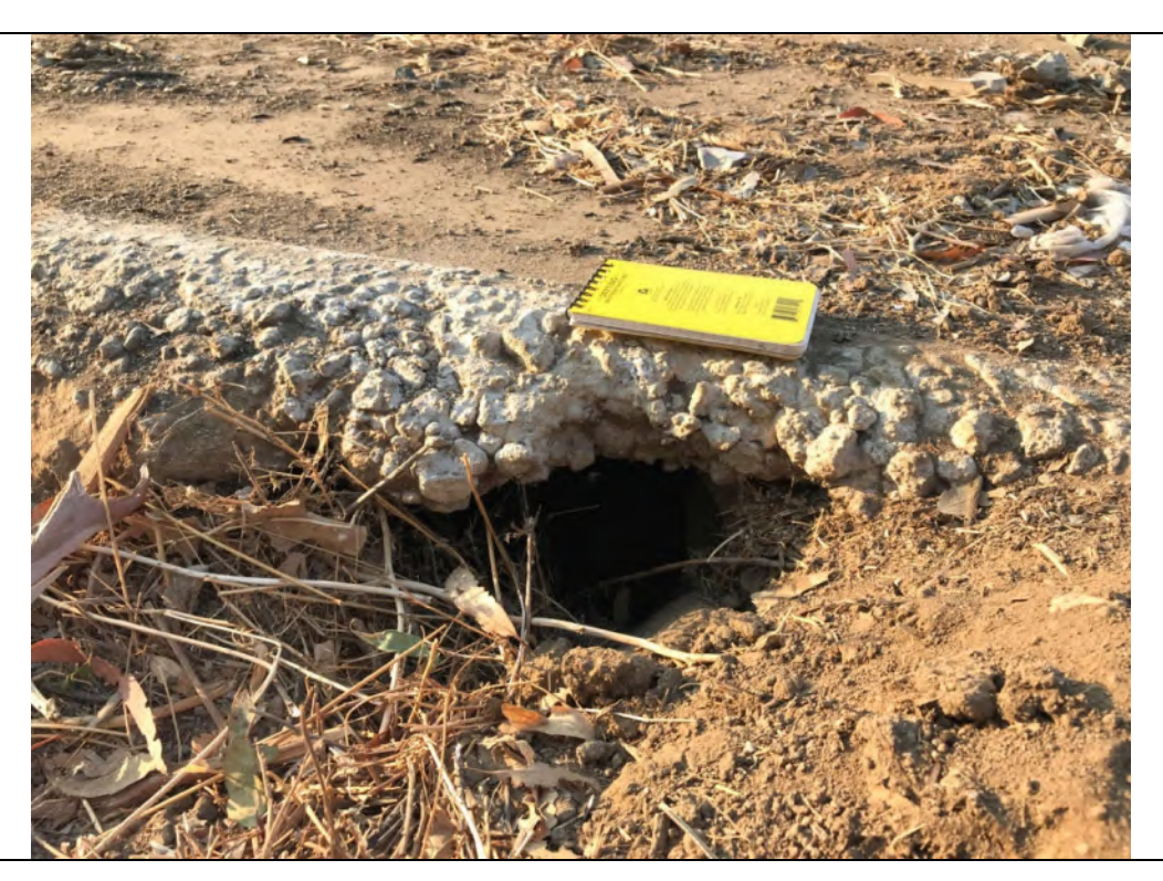
Photo 3: Potential BUOW burrow located in the northwest corner of the project site, under the corner of a cement block. Good size and location for BUOW burrow; however, no bird sign was seen around burrow.