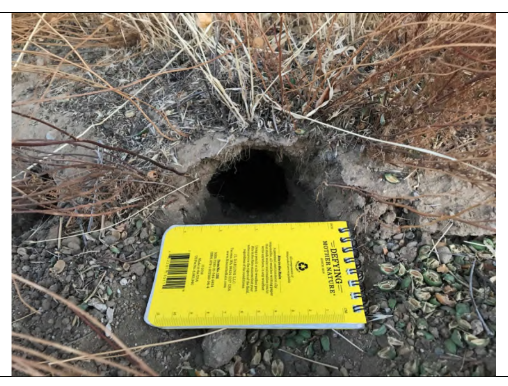
Photo 1: Potential burrowing owl (BUOW) burrow located in the northeast corner of the project site. Slightly small for BUOW burrow, and no bird sign seen around burrow.