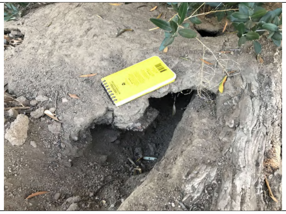
Photo 2: Potential BUOW burrow located in the northeast corner of the project site. While large enough for BUOW, the burrow is located under a eucalyptus tree, reducing the likelihood of hosting a BUOW.