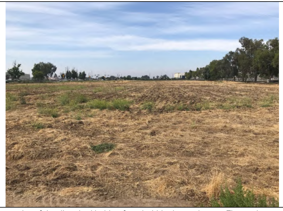
Photo 4: Representative of the disturbed habitat found within the study area. The study area is dominated by non-native grasses.