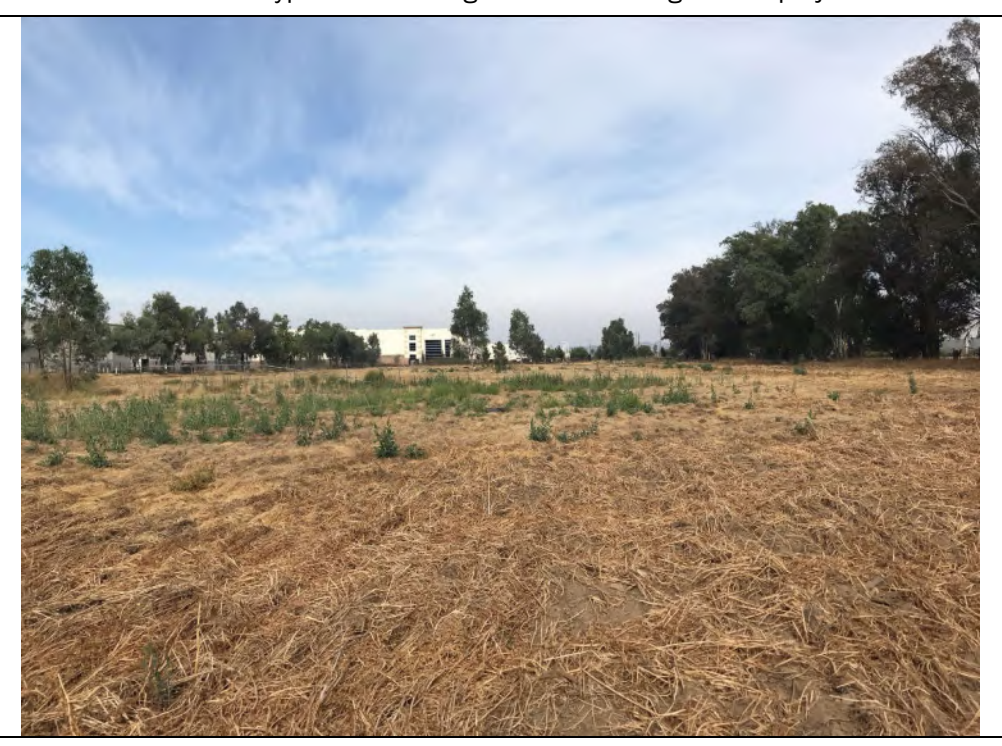
Photo 6: Center of the project site facing west. Representative of the disturbed habitat found within the study area.