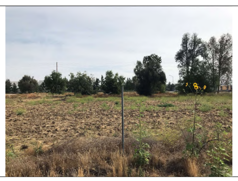
Photo 5: Center of project site facing north. Representative of the ruderal vegetation found on site, along with the row of eucalyptus trees along the northern edge of the project site.