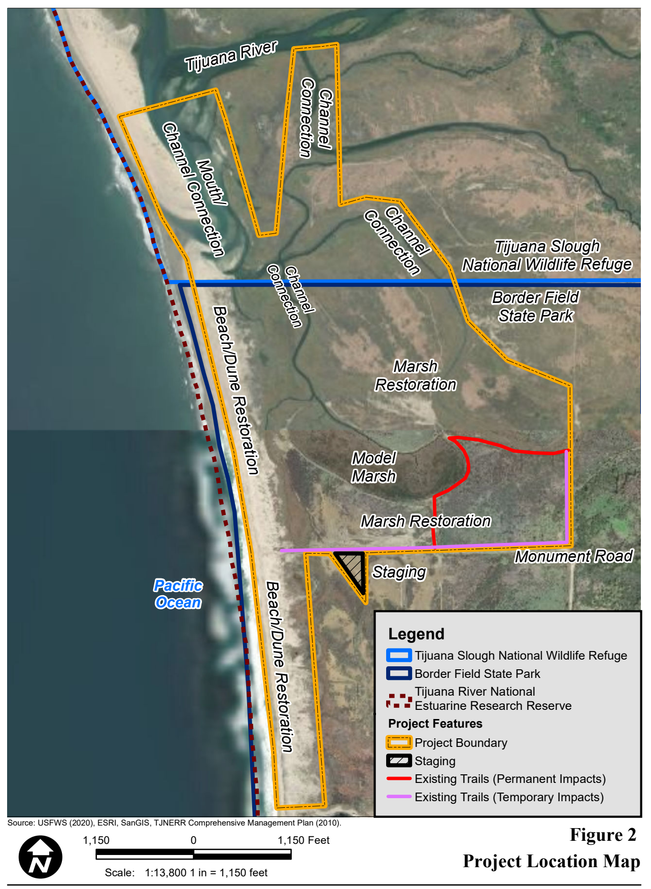
Tijuana Estuary Tidal Restoration Program II Phase I