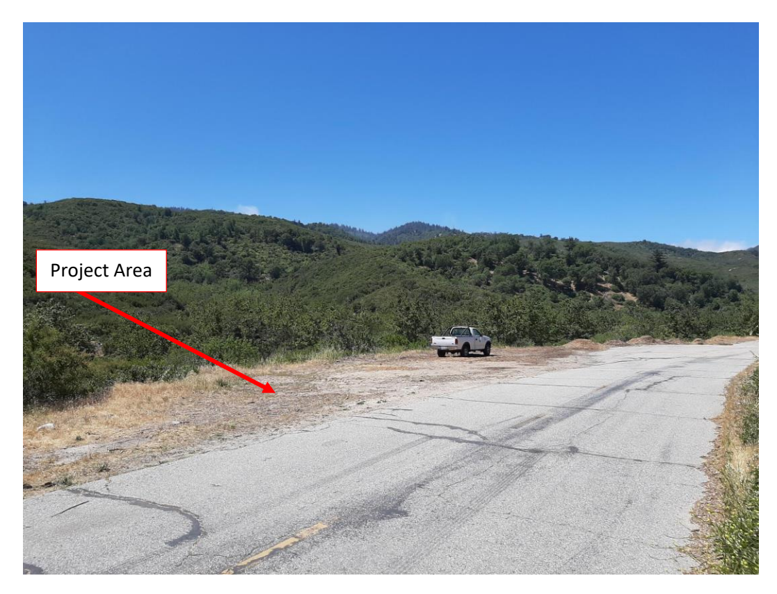
Photo 1 – Cleghorn HLZ project area. Taken from northside of Cleghorn Road, facing SW.