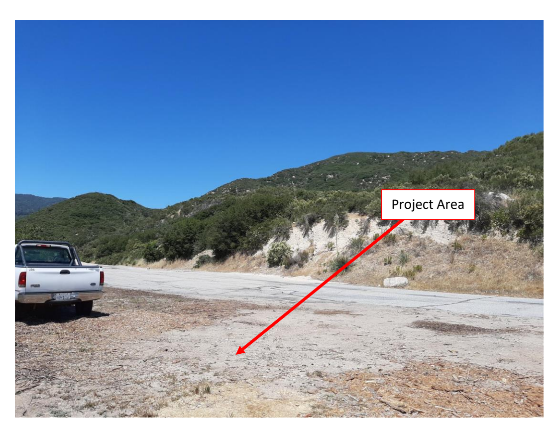
Photo 2 – Cleghorn HLZ project area. Taken from middle of project area, facing W.