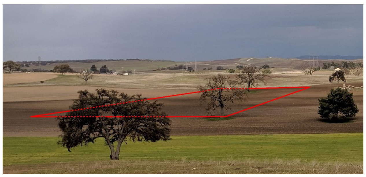
Figure 2: Project site as photographed from approximately 650 feet southeast facing northwest. The approximate revised cultivation area boundary is represented by a red polygon. Oak in foreground is not within project footprint and will not be impacted.