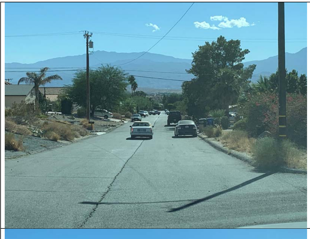
Photo 7. Project alignment near the eastern portion of the Project Area; south of Hacienda Avenue.