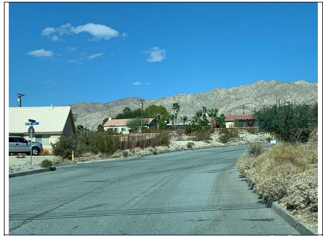
Photo 3. Looking north along the proposed Project alignment from the intersection of Agua Cayendo Road and Oro Loma Street. Northwest portion of the Project Area; north of Hacienda Avenue.