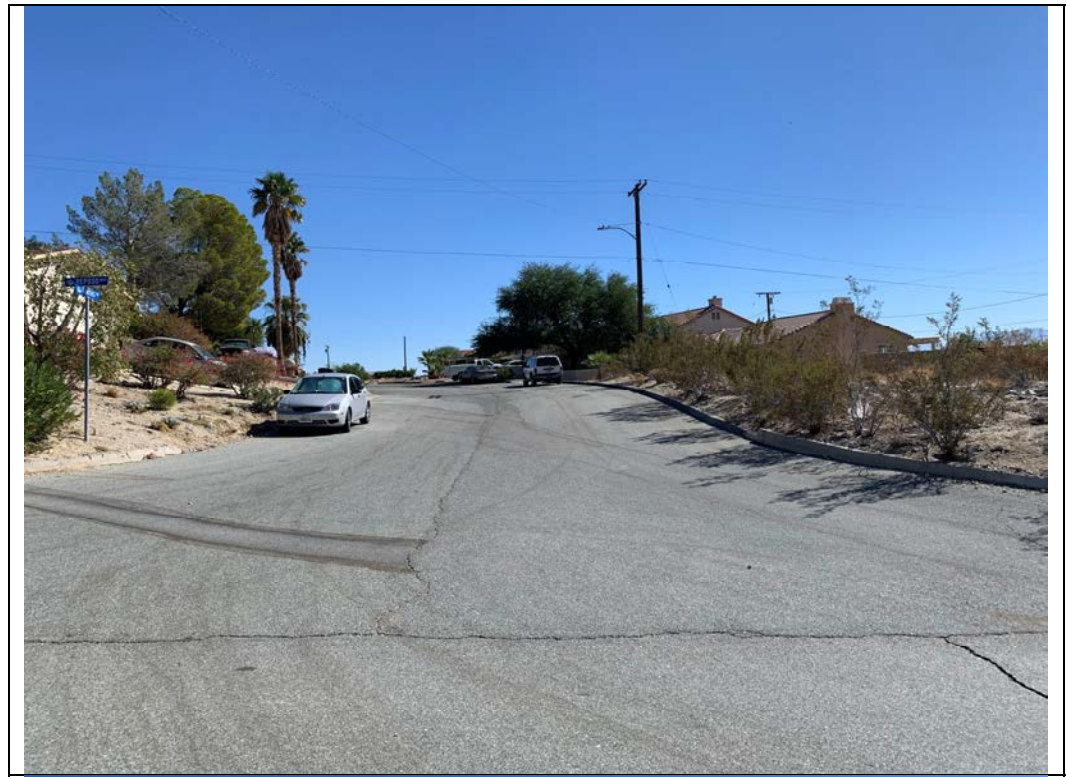
Photo 1. Looking southeast along the proposed Project alignment from the intersection of Tunitas Road and Reposo Way. Northwest portion of the Project Area; north of Hacienda Avenue.