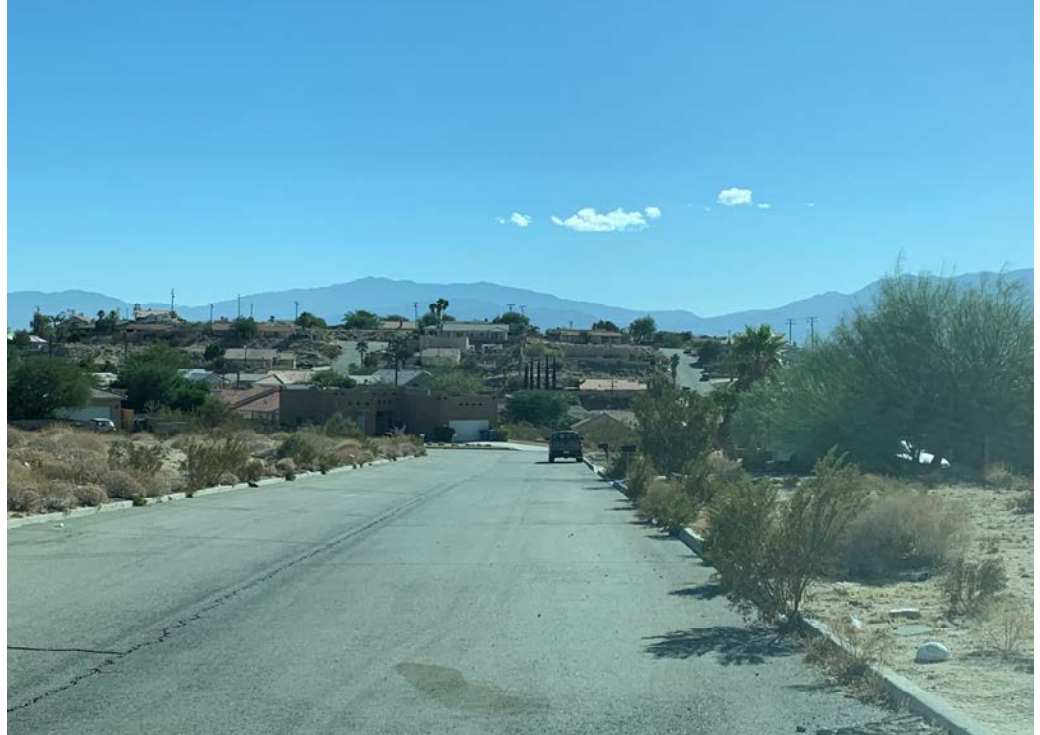
Photo 8. Project alignment near the soutwest portion of the Project Area; south of Hacienda Avenue.