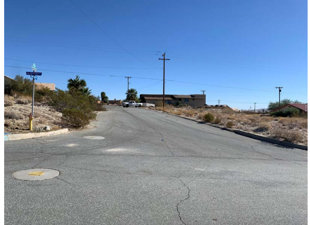
Photo 2. Looking southeast along the proposed Project alignment from the intersection of Suerte Way and Reposo Way. Northwest portion of the Project Area; north of Hacienda Avenue.