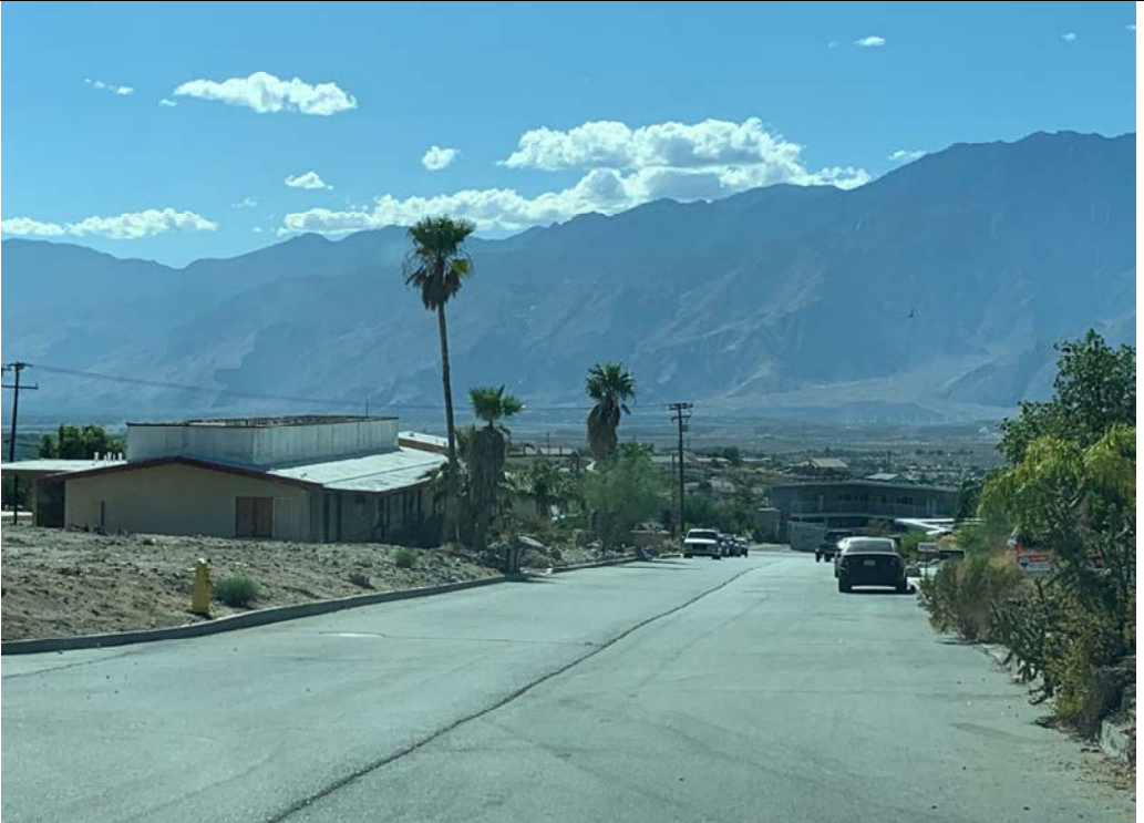
Photo 6. Project alignment near the northeastern portion of the Project Area; south of Hacienda Avenue.