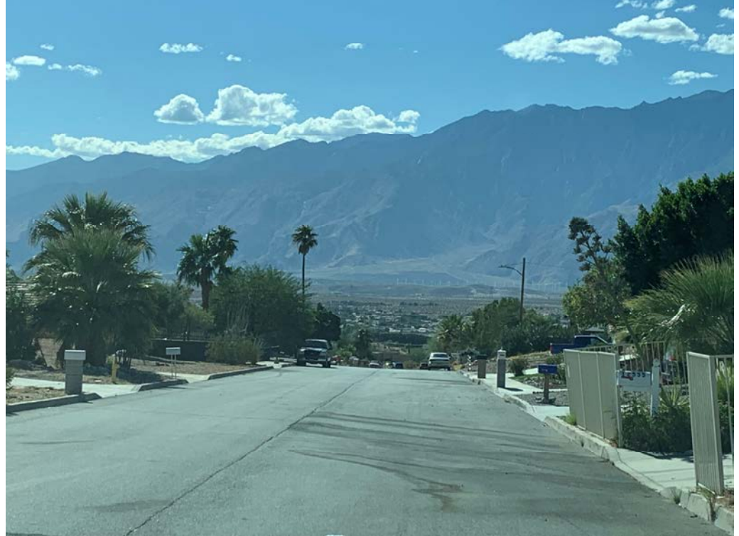
Photo 5. Looking south along the proposed Project alignment from the intersection of Cuando Way and Desert View Avenue. Northeast corner of the Project Area; north of Hacienda Avenue.