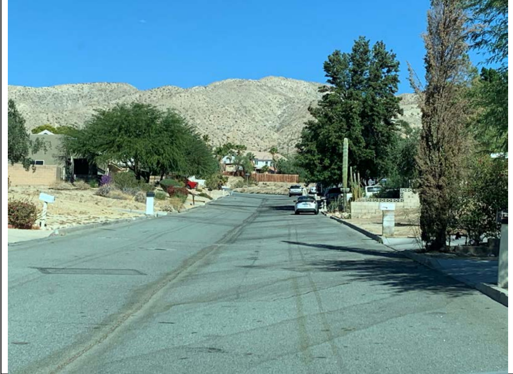
Photo 5. Project alignment near the northeastern portion of the Project Area; south of Hacienda Avenue.