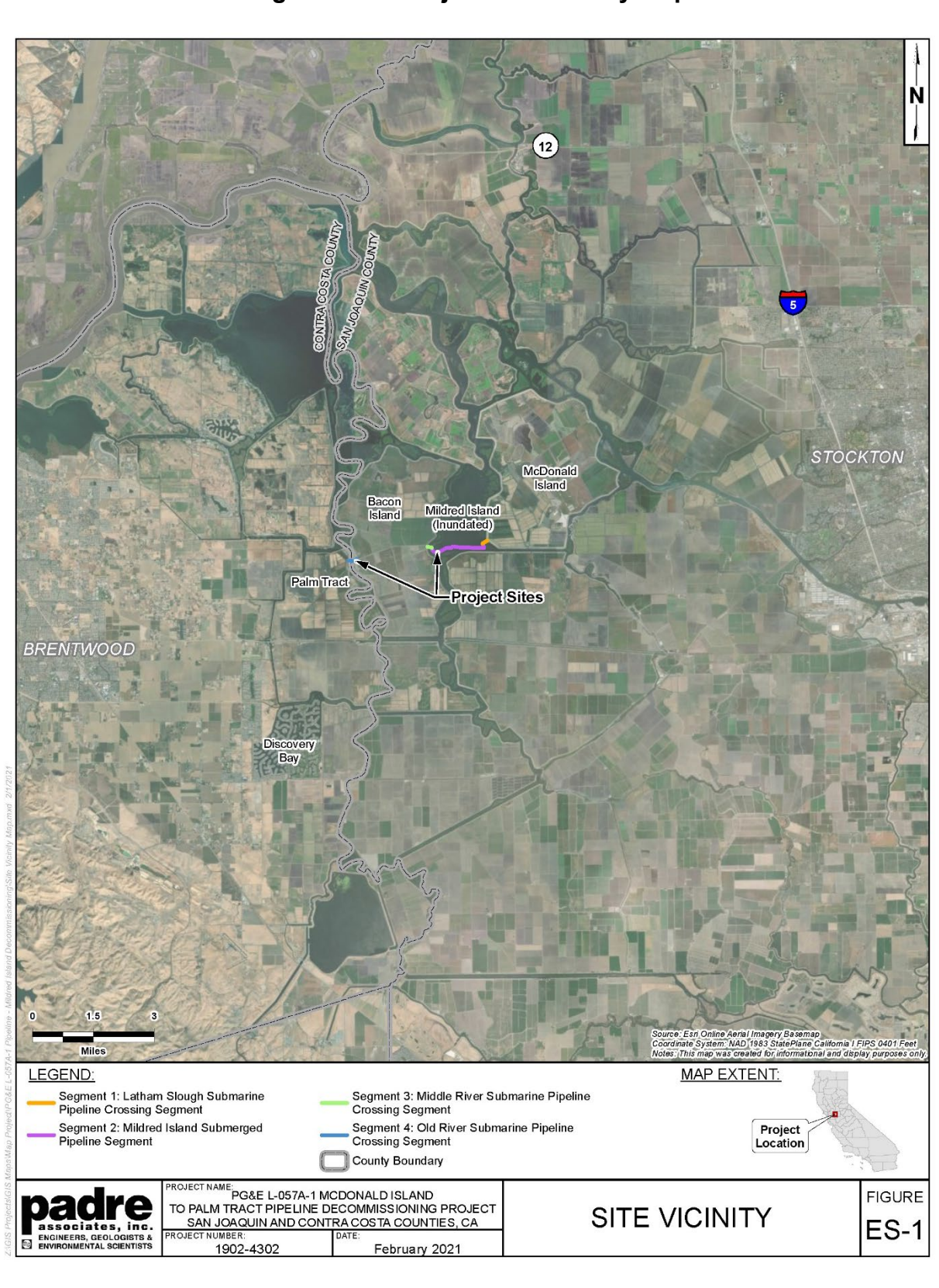
Figure ES-1. Project Site Vicinity Map