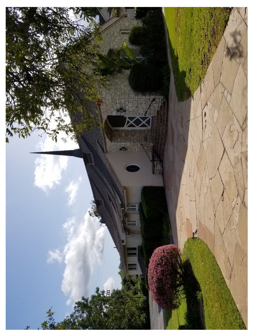
Northeast corner, looking southwest