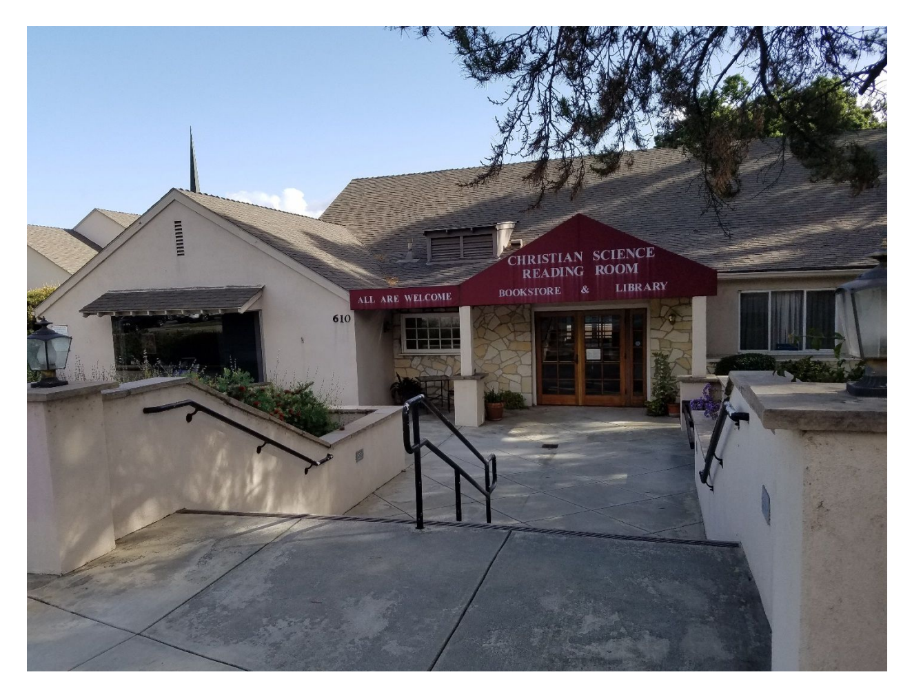
West end of north elevation, looking south