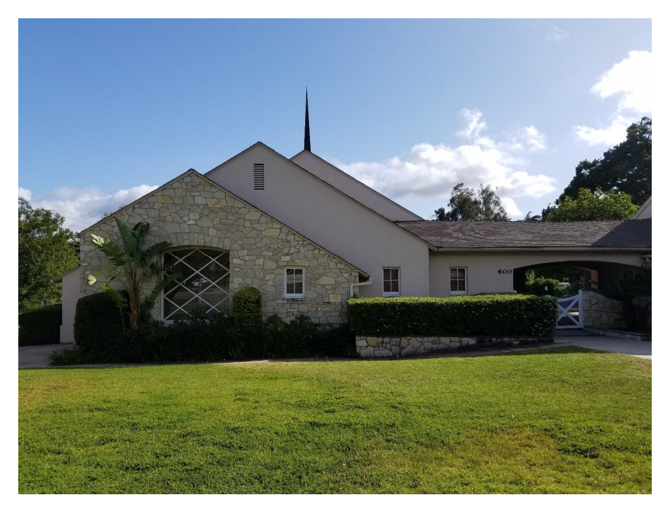
East end of north elevation, looking south