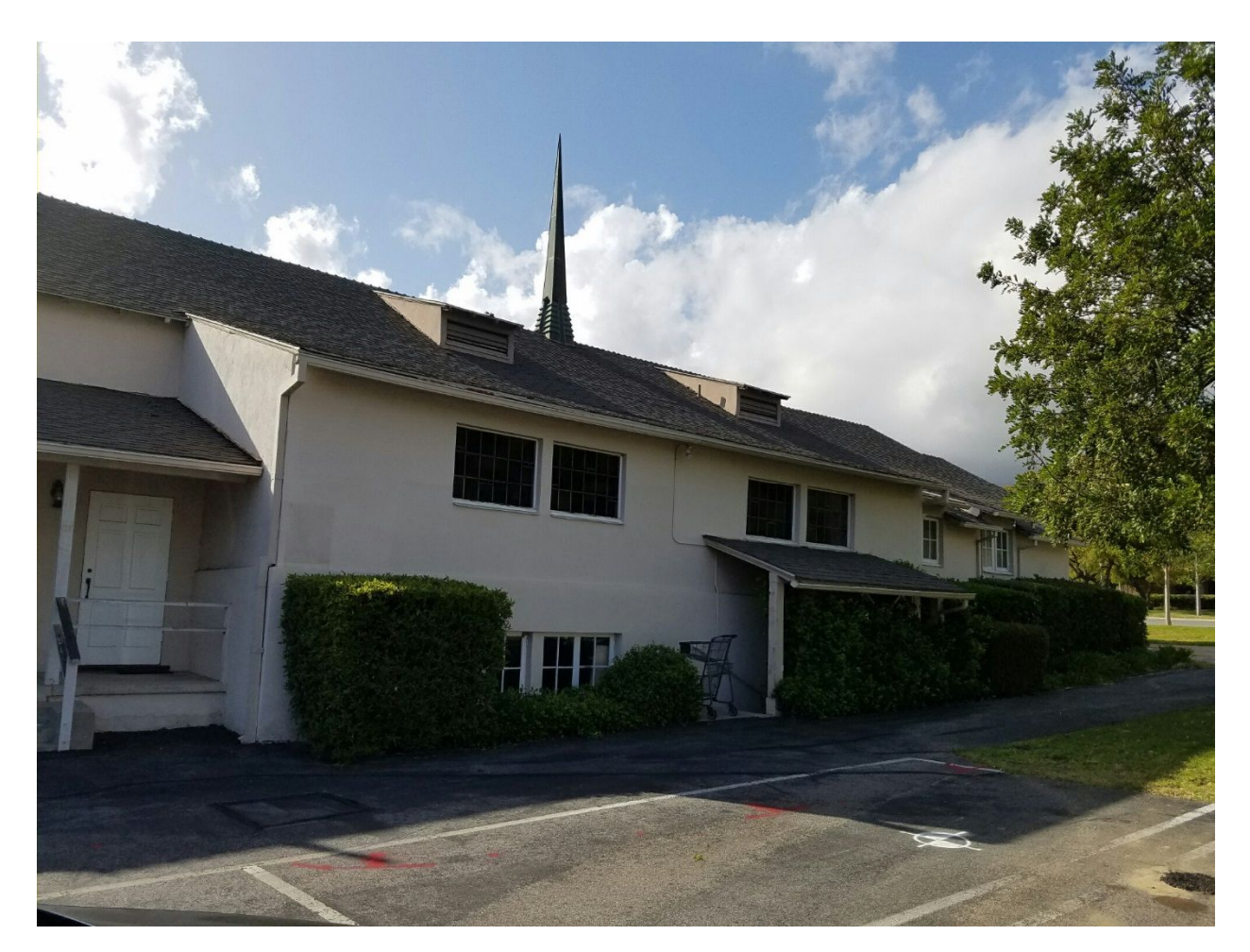
East elevation, looking northwest