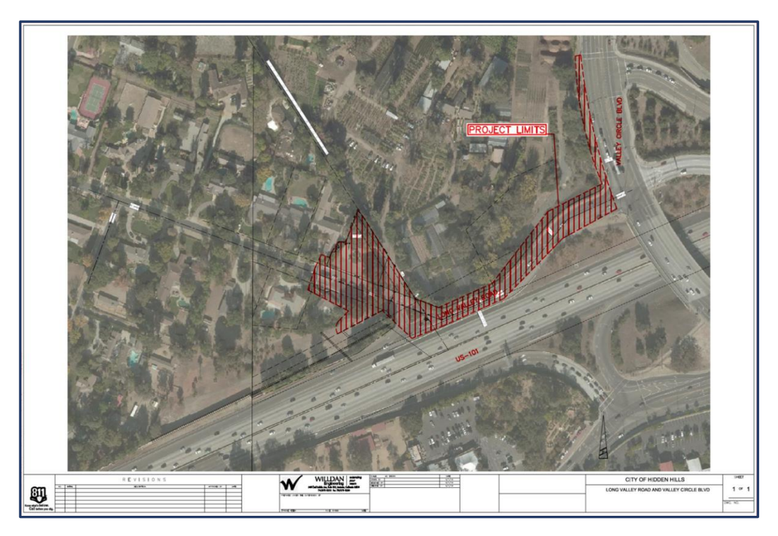
Figure 2- Project Location and Limits of Construction