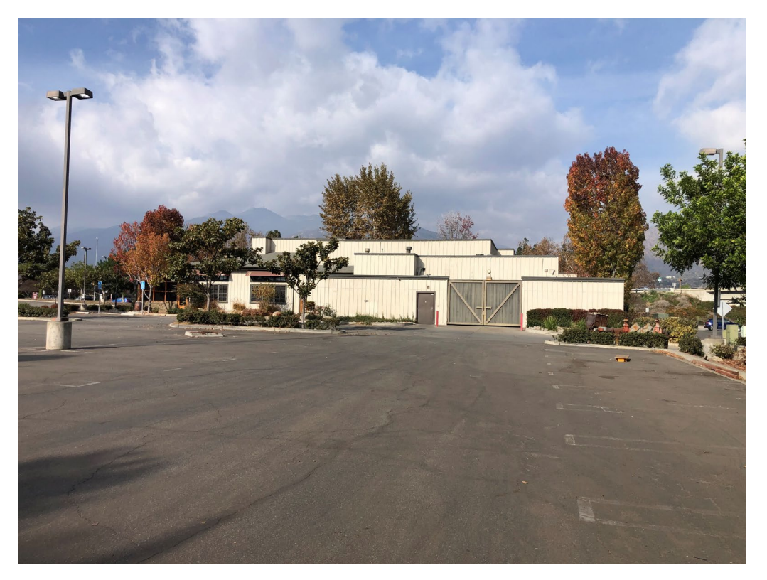
Photograph 1. View of project site from southeast corner, facing north.