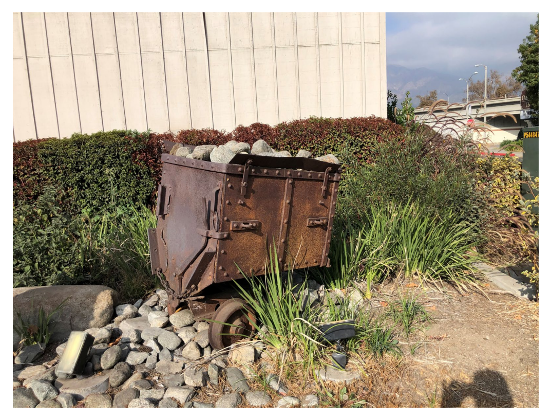
Photograph 4. Detail of mining cart on south elevation of building, facing north-northeast.