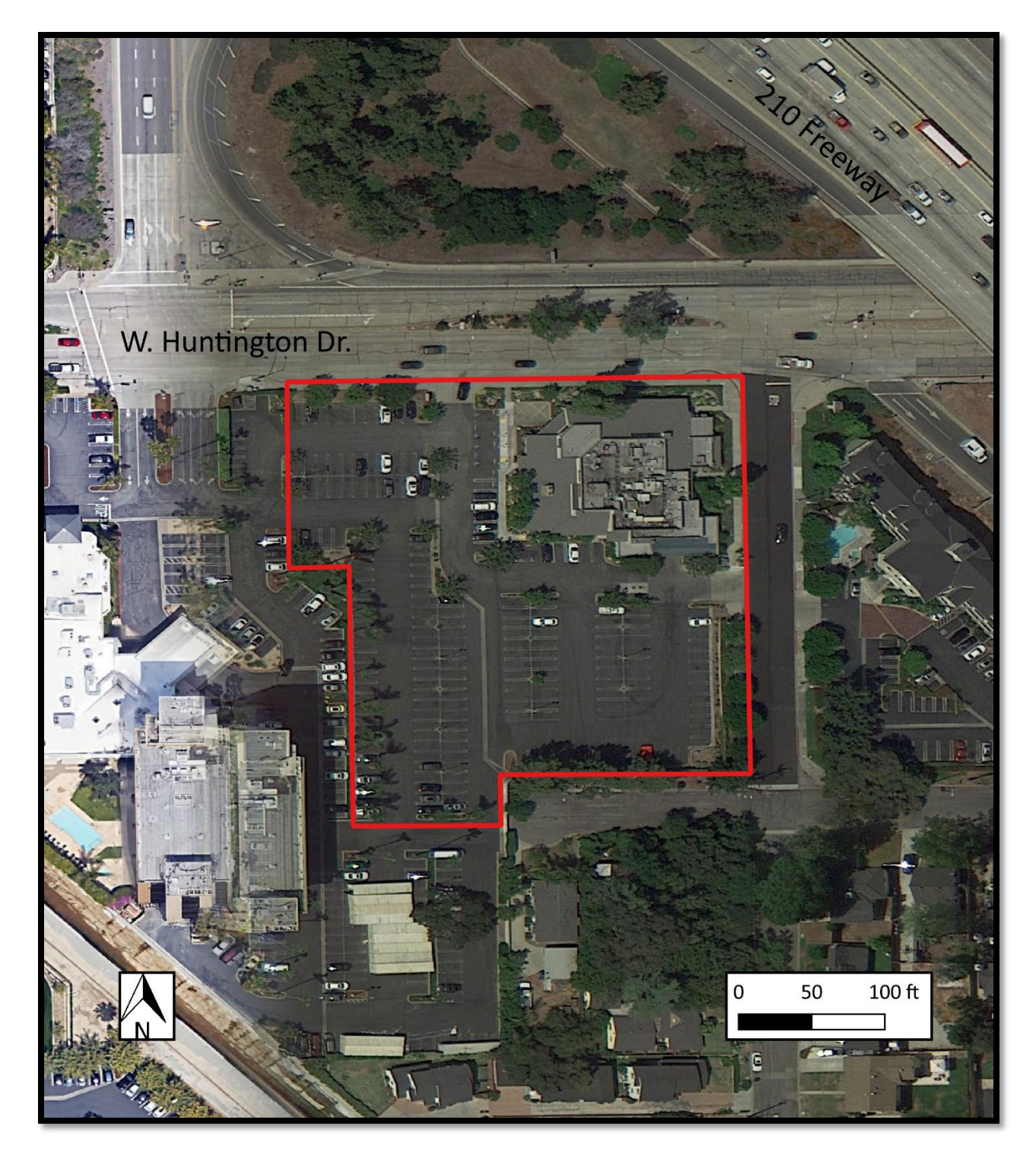
Figure 2. Aerial View of Project Site.