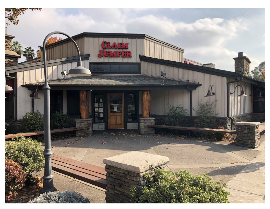
Photograph 2. View of front of building, facing southeast.