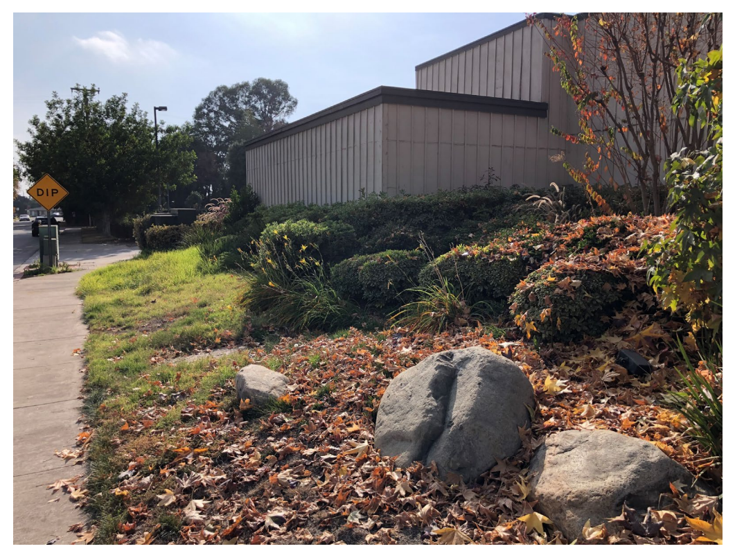
Photograph 3. View of north boundary of project site, facing east.