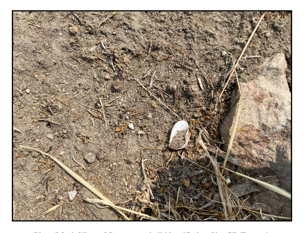
Plate 5.2–6: View of Donax sp. shell identified at Site CP-Temp-1.