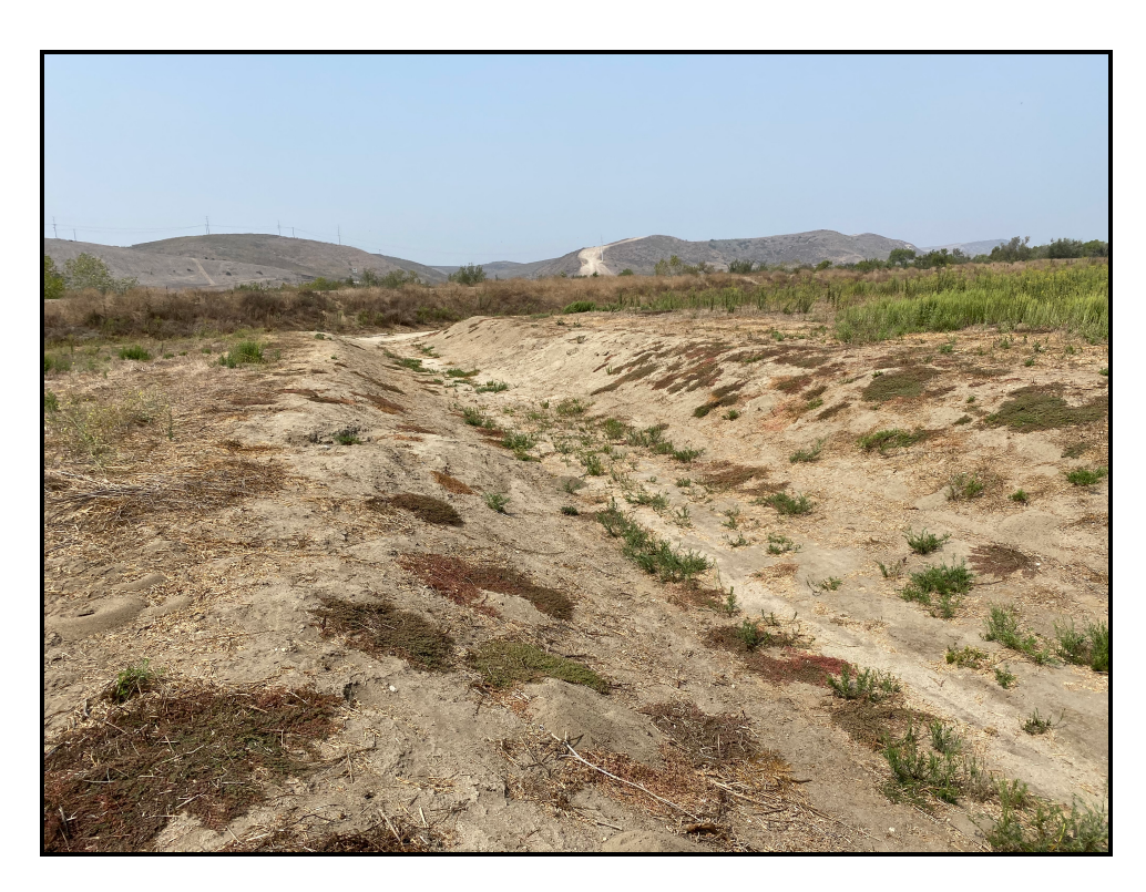
Plate 5.2–2: Overview of the northernmost drainage trench, facing northeast.