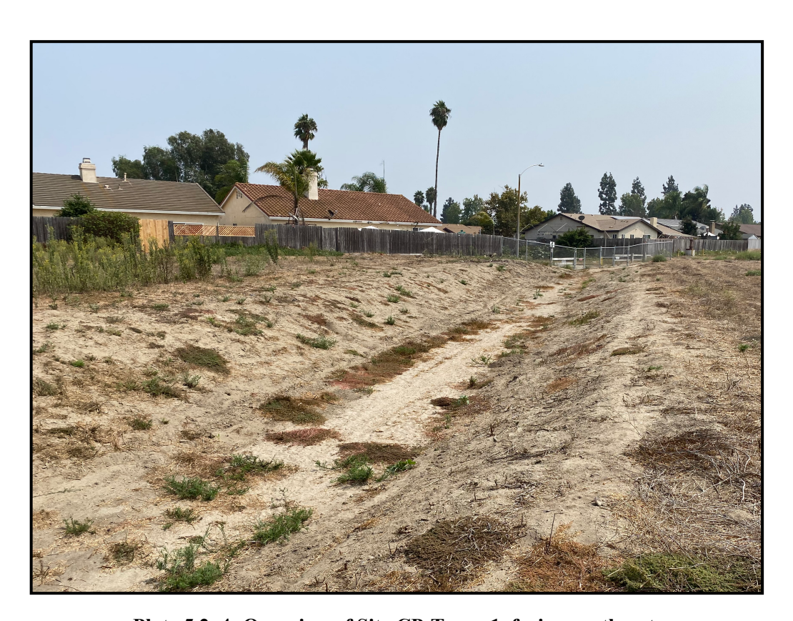
Plate 5.2-4: Overview of Site CP-Temp-1, facing southeast.

Despite the poor ground visibility during the survey, one previously unrecorded prehistoric site was identified and assigned the temporary designation CP-Temp-1. The site was identified as a scatter of marine shell in the northern quarter of the project (Figure 5.2–1), within the northernmost trench (Plate 5.2–4). The shell, which was identified as fragments of Ostrea sp., Chione sp., and Donax sp. (Plates 5.2–5 and 5.2–6), is consistent with nearby prehistoric occupation sites such as Site SDI-5445. Site CP-Temp-1 measures 15 meters north to south by seven meters east to west. Additional shell fragments were identified north of the CP-Temp-1 shell scatter (Figure 5.2–2), but this is likely the result of previous disturbance to the site created by grading, which would have spread the shell scatter outward. Additionally, the fact that the shell was exposed by one of the trenches indicates that buried cultural deposits may exist at this location. Proximity to the San Luis Rey River may have resulted in flood events that could have covered CP-Temp-1 with sediments and obscured the site.