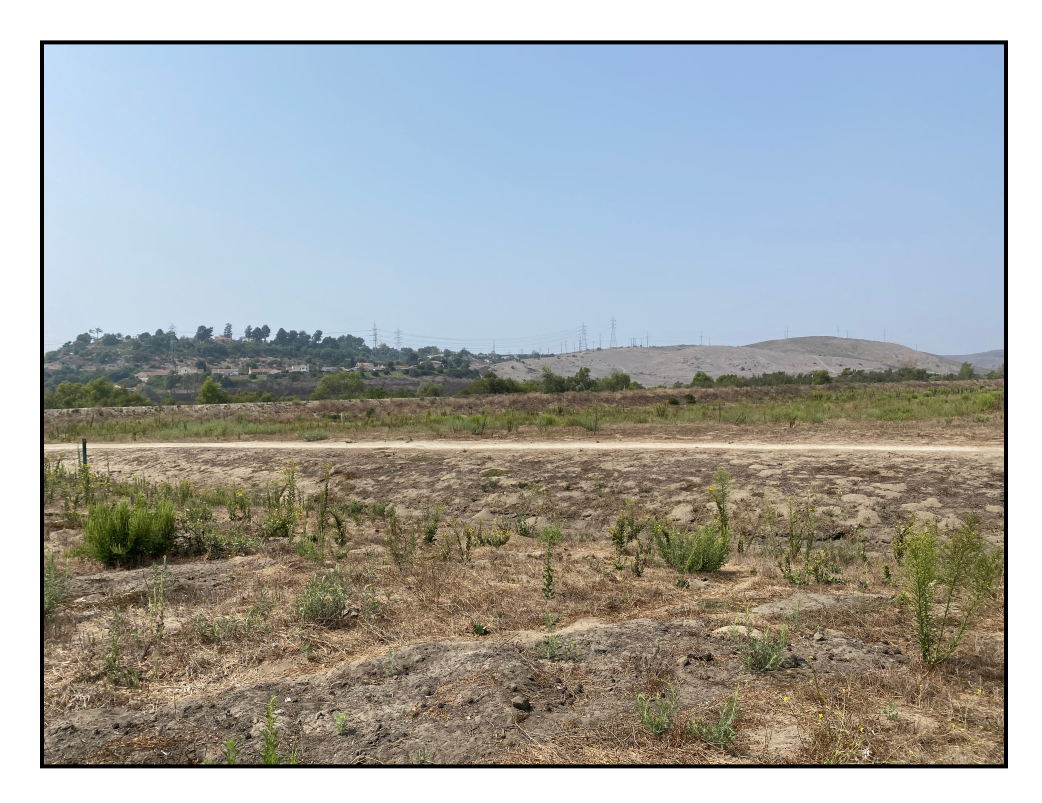
Plate 5.2–3: Overview of one of the walking paths, facing northwest.