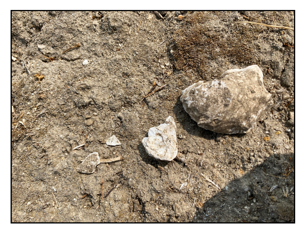
Plate 5.2-5: View of Ostrea sp. and Chione sp. shell identified at Site CP-Temp-1.