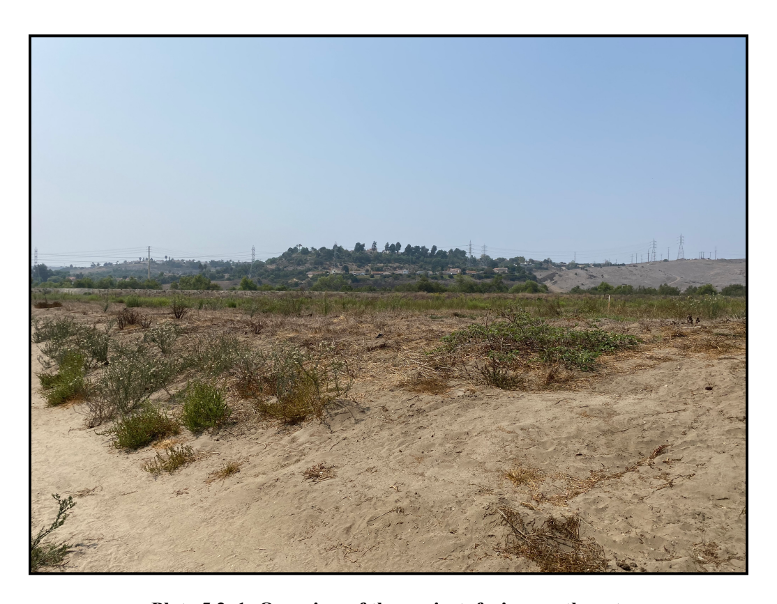
Plate 5.2–1: Overview of the project, facing northwest.

The topography of the project was noted as generally flat and previously graded (Plate 5.2–1). Including the previous grading of the property, noted disturbances include two man-made trenches and three dirt walking paths. The trenches, located at the north and south of the property, are a result of drainage pipelines between the neighboring residential development and the San Luis Rey River channel. The southernmost trench runs east to west along the southern project boundary and the northernmost trench runs southeast to northwest across the northern third of the project (Plate 5.2–2). The three dirt walking paths are located along the southern project boundary, running east to west through the center of the project, and running northeast to southwest along the northern third of the property (Plate 5.2–3). A majority of the property, with the exclusion of the dirt walking paths, was covered in dense, low-lying grasses, rendering ground visibility to be generally poor.